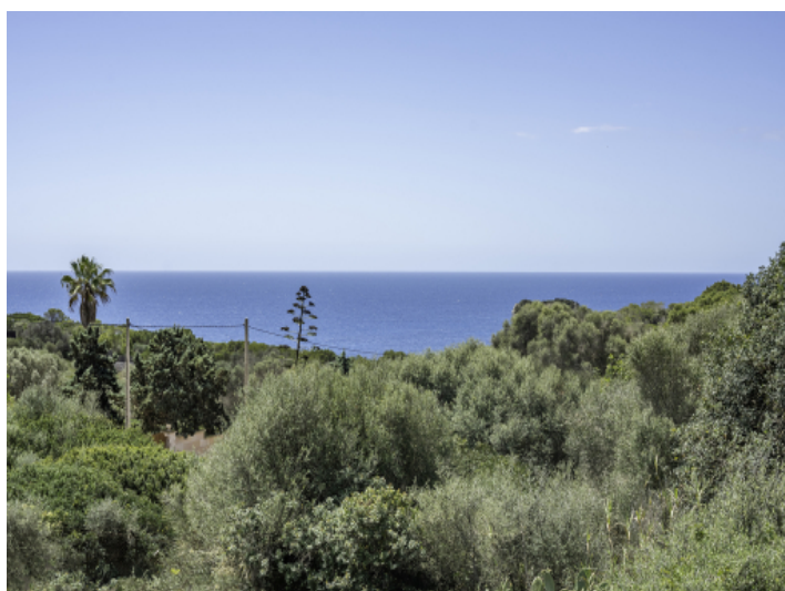
Mediterran sea views