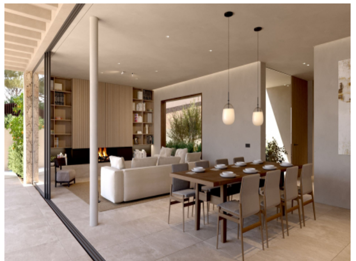
Bright living and dining room