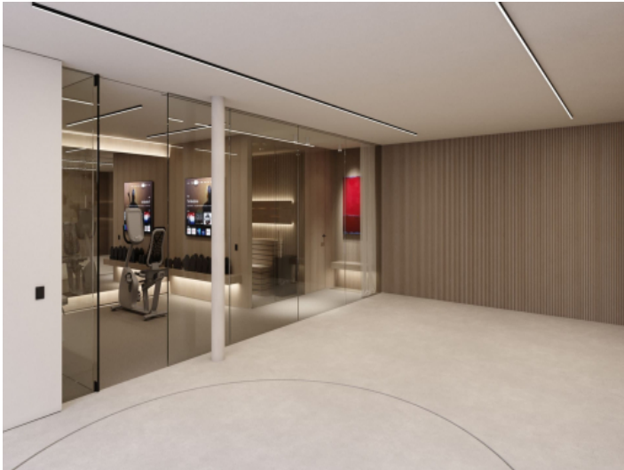
Fitness and sauna