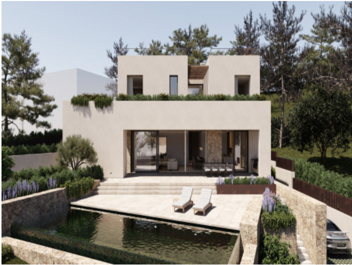
Newly built villa with pool in Cas Catalá