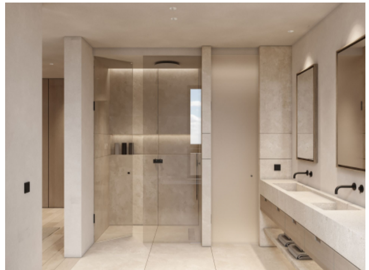
Bathroom with floor - level shower