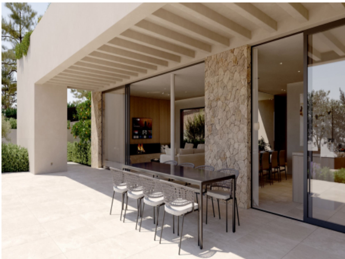
Large porched veranda