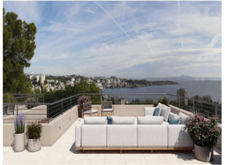
Comfortable rooftop terrace