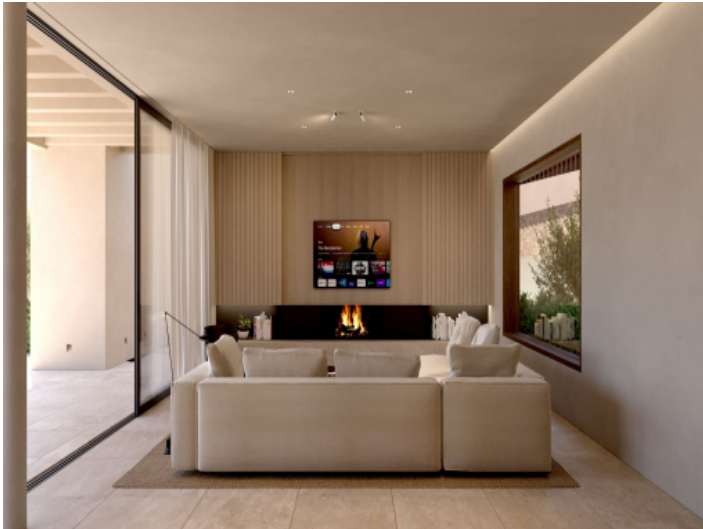
Comfortable living room with fireplace