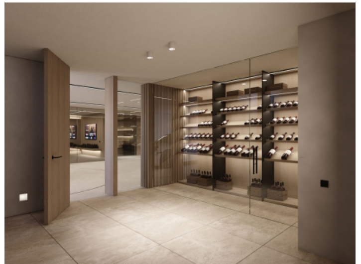
Nice wine cellar