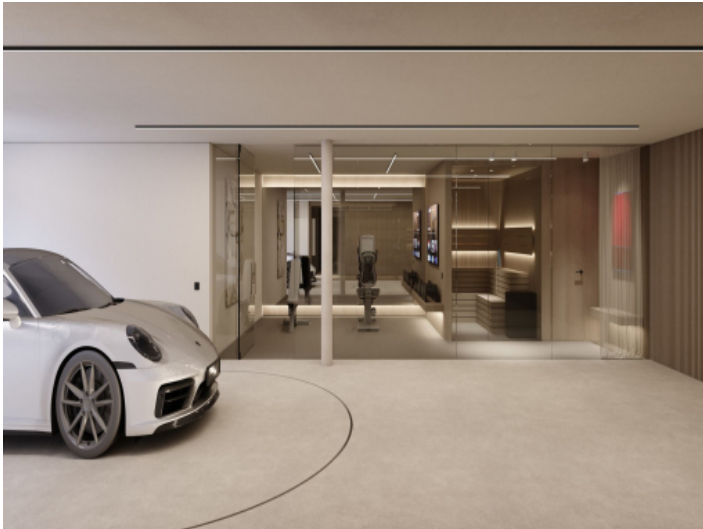
Fitness area and sauna