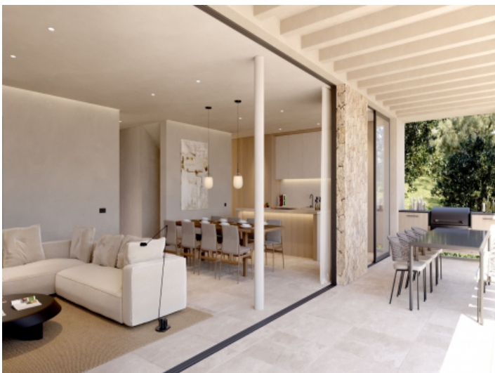
Open room layout