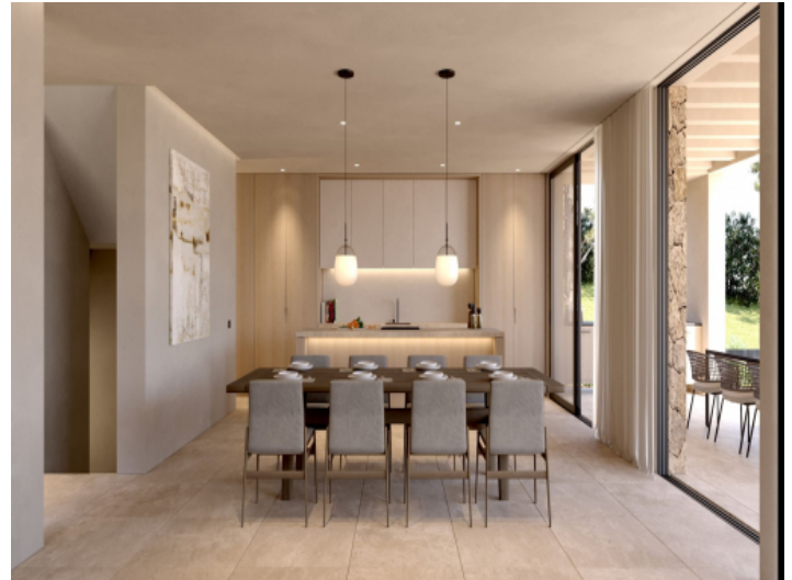
Modern kitchen with dining area