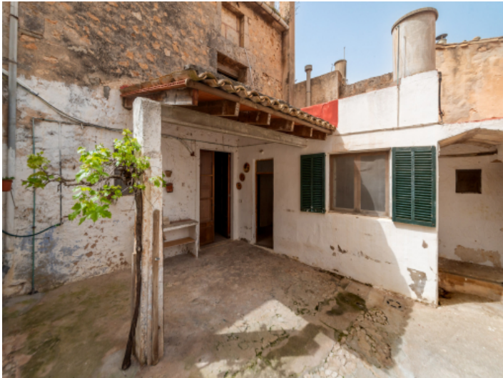
Patio with lots of possibilities