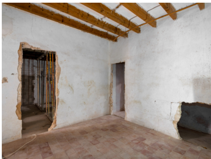
Old wooden beams