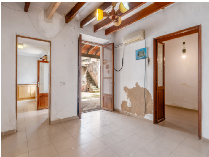
Kitchen area and direct access to the patio