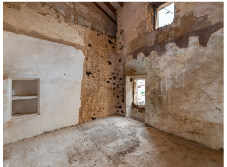
Room on the first floor