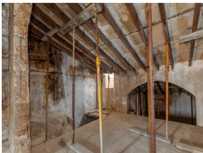
Original wooden beams