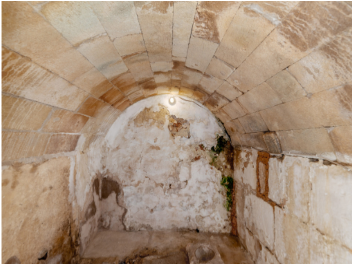
Possible wine cellar