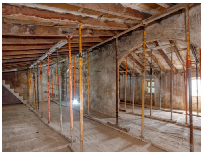
Attic with lots of space