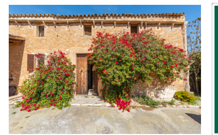
San Lorenzo search for property MAL-121356