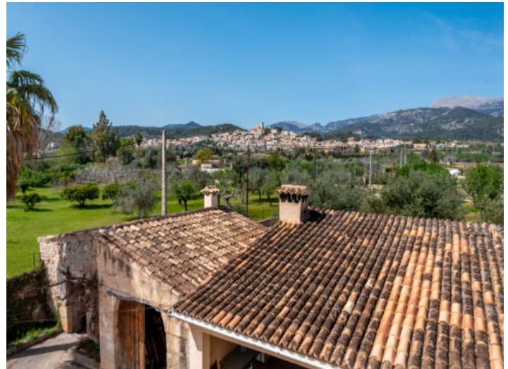
Views to the town