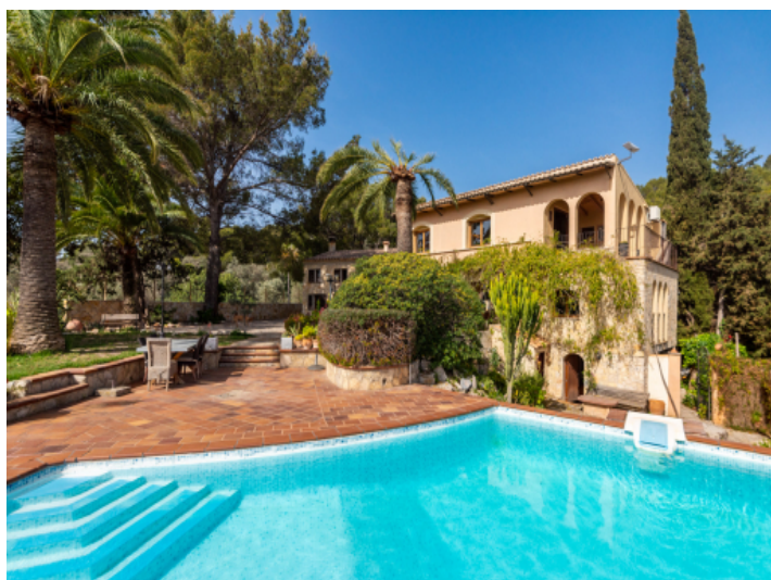
Beautiful pool in a very nice scenery