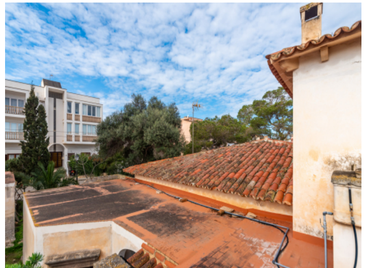
Views from the upper floor