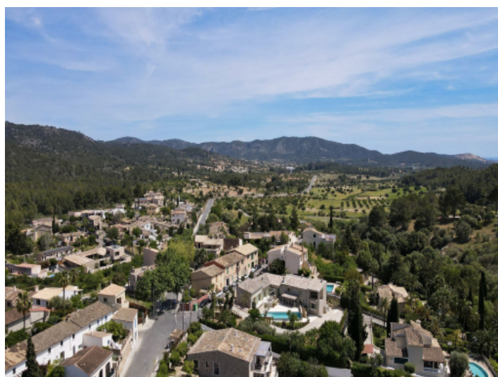
View to the property