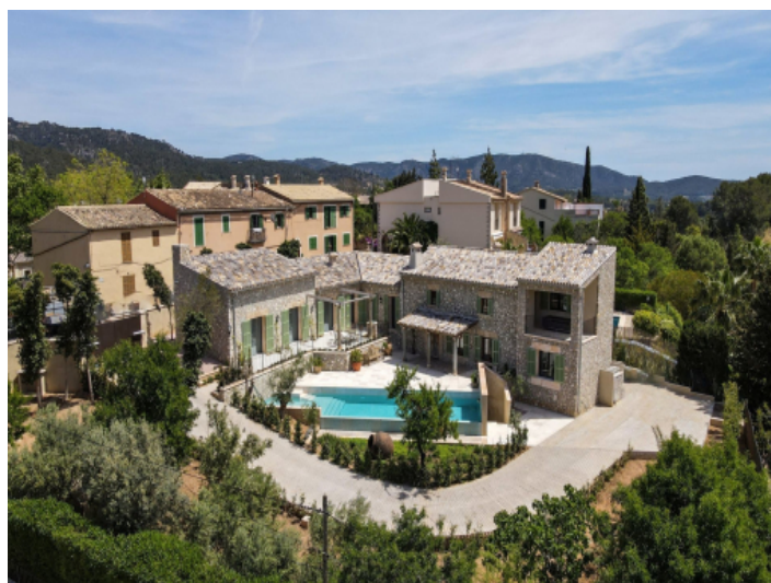
View to the property