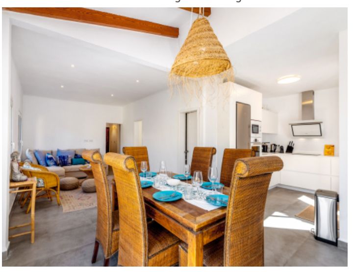
Open and communicative room layout