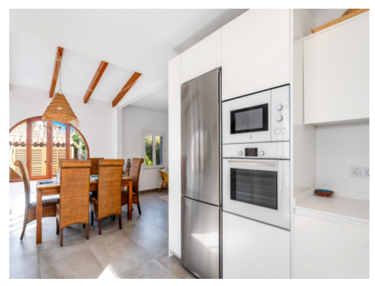
The dining area adjoins the open-plan kitchen