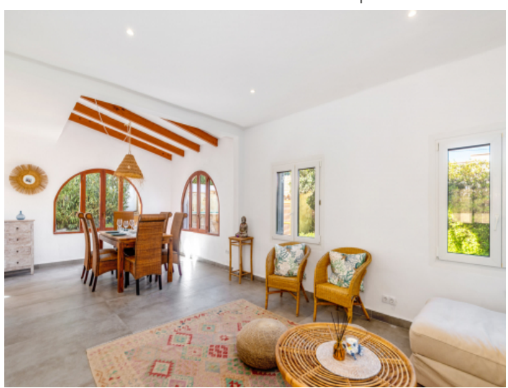
Comfortable living and dining area