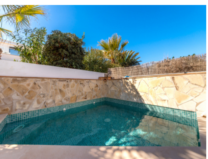
Pool area in the Mediterranean patio