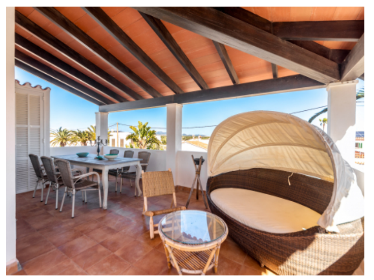
The charming rooftop with chill out area