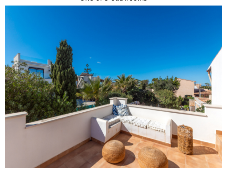
The sunny roof terrace