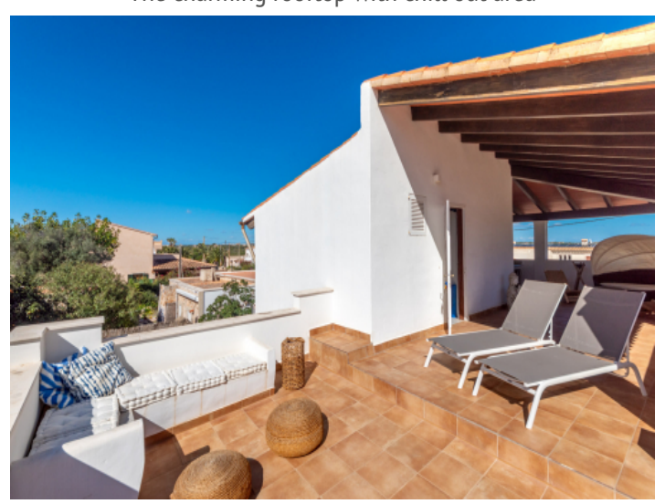
Sunny roof terrace