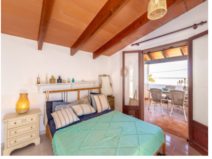
Bedroom next to the rooftop