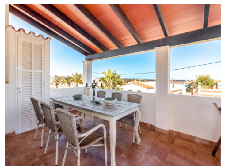
Cozy dining area on the rooftop