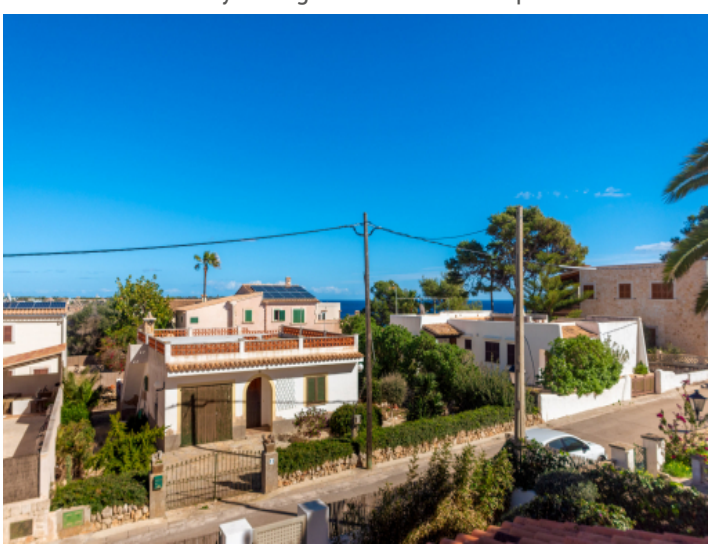
Beautiful view over the neighbourhood to the sea