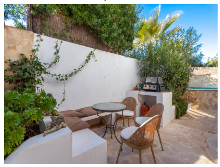
Pool terrace with BBQ area