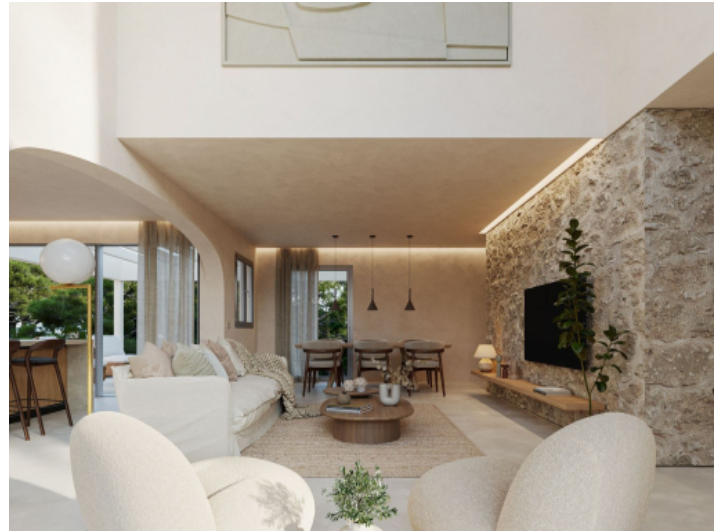
Modern living concept