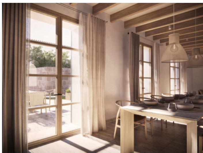
Direct terrace access