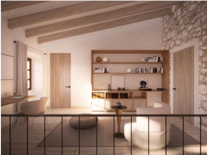
Lounge area on the upper level