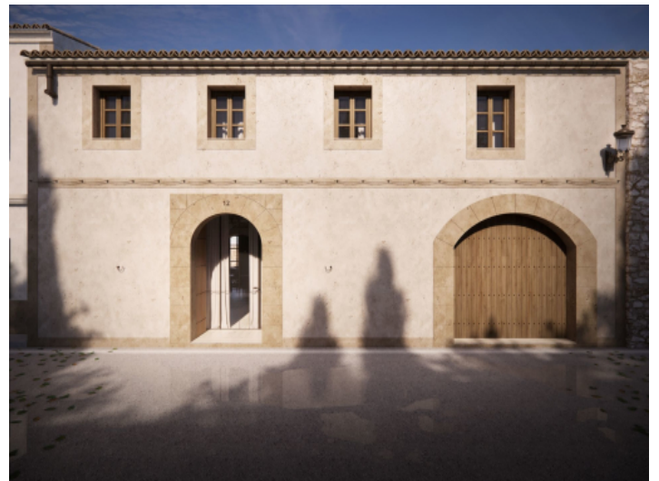
View from the street