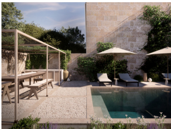
Town-house project with large garden, pool, garage and views