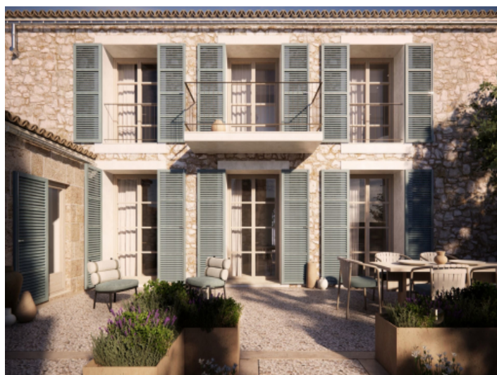
Fachade and terrace