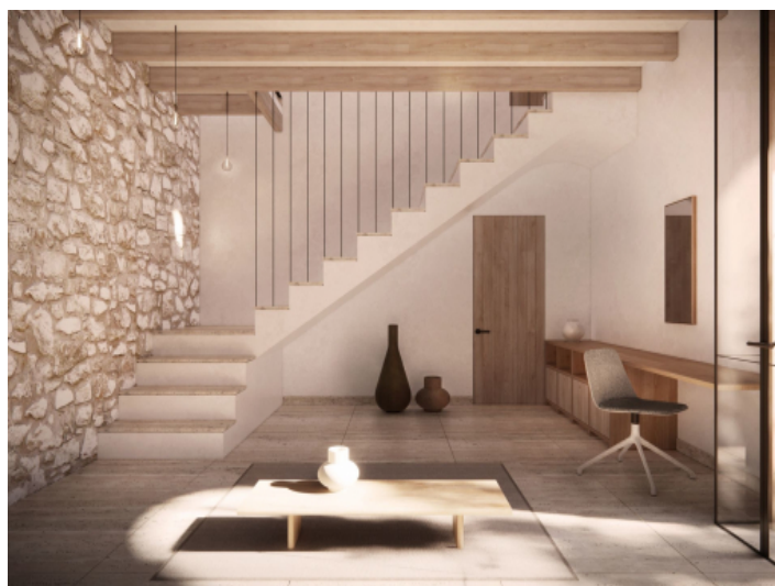
Hall with access to the upper level