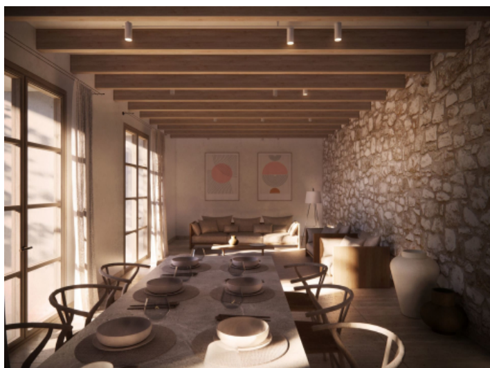
Dining and living area