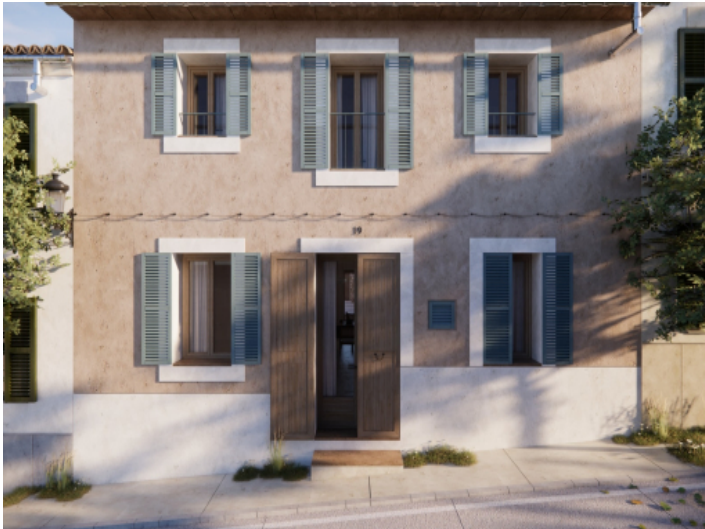
WhatsApp Image 2024-07-08 at 10.47.27