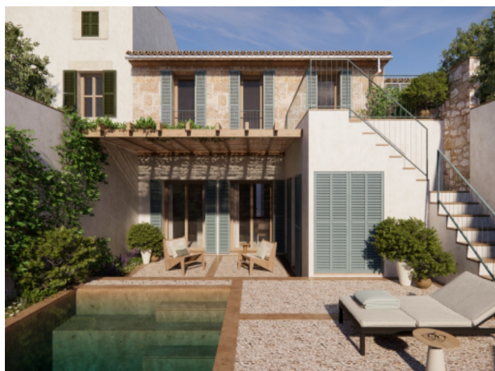
WhatsApp Image 2024-07-08 at 10.47.27-2