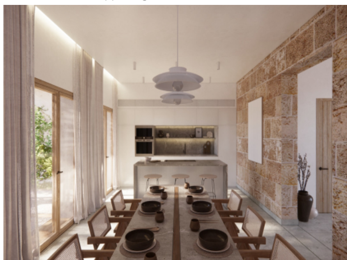
WhatsApp Image 2024-07-08 at 10.47.27-4