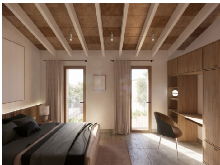
WhatsApp Image 2024-07-08 at 10.47.28