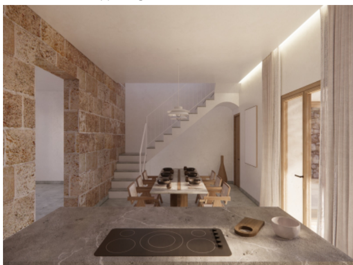
WhatsApp Image 2024-07-08 at 10.47.27-5