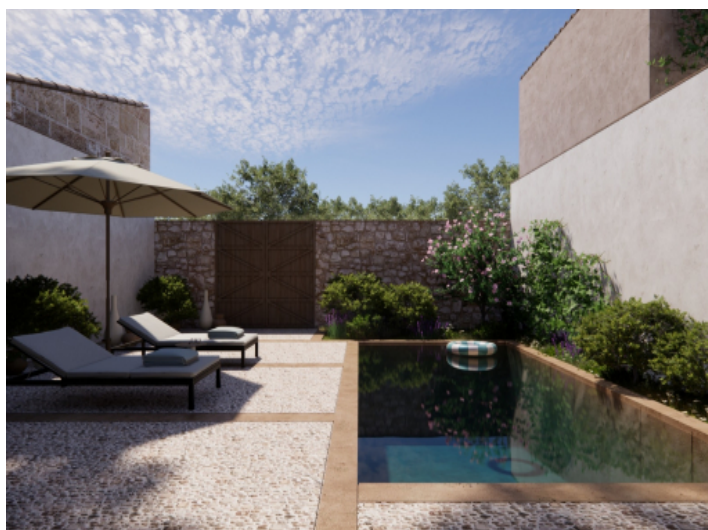
WhatsApp Image 2024-07-08 at 10.47.27-3