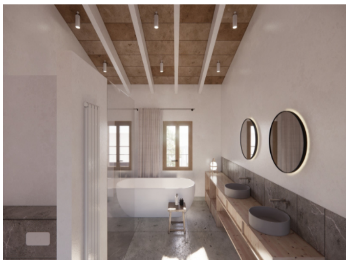
WhatsApp Image 2024-07-08 at 10.47.28-2