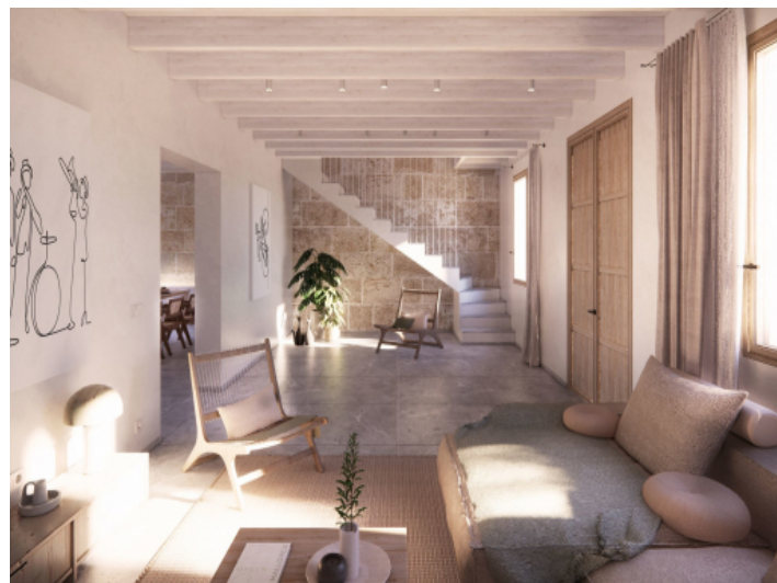
Hall with living area