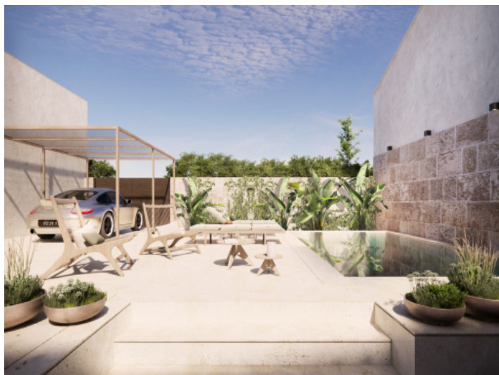
Pool area with sun terrace