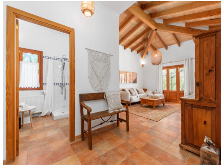
Living area and corridor