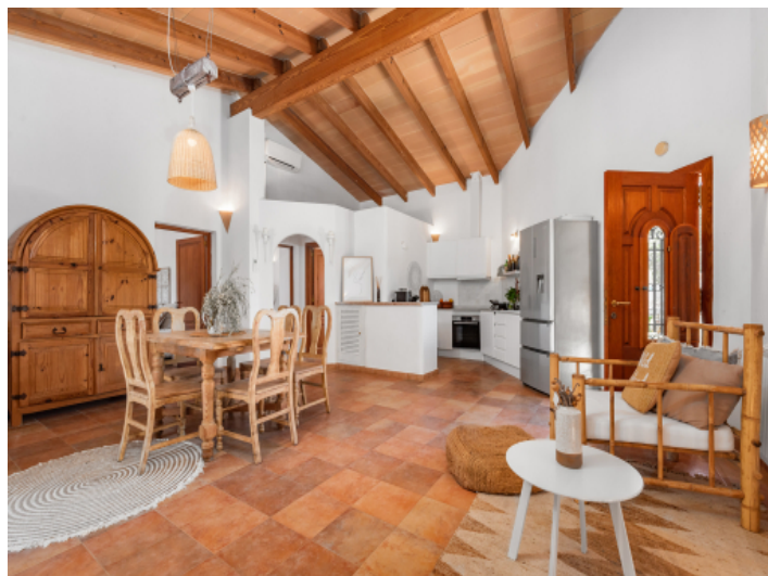
Dining and kitchen area