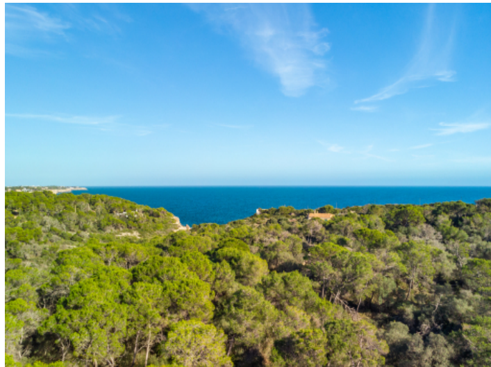
Stunning views to the sea