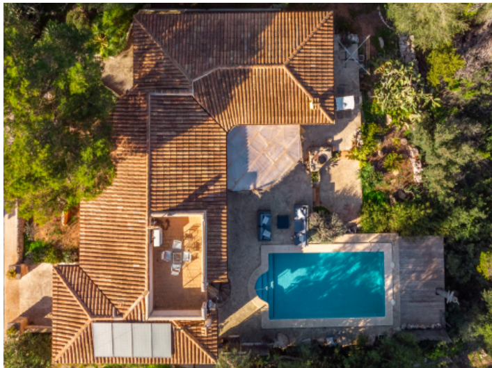
View from above