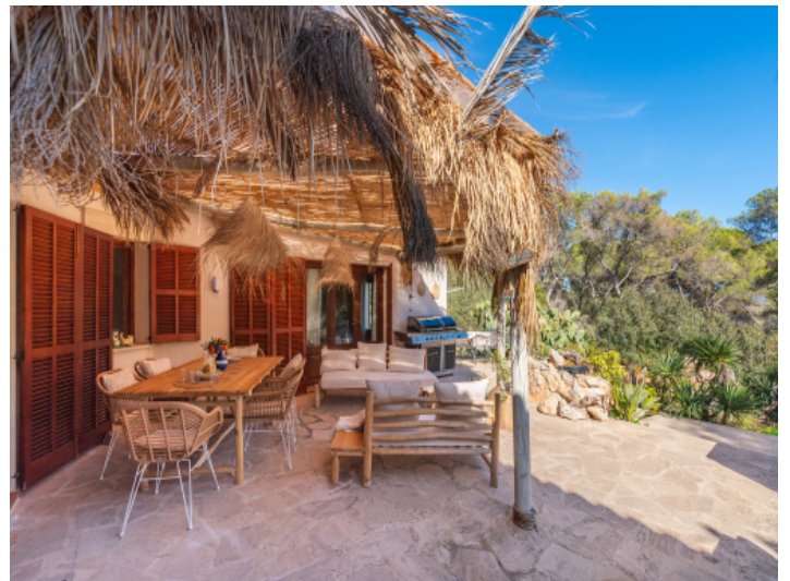
Idyllic terrace with dining and lounge area