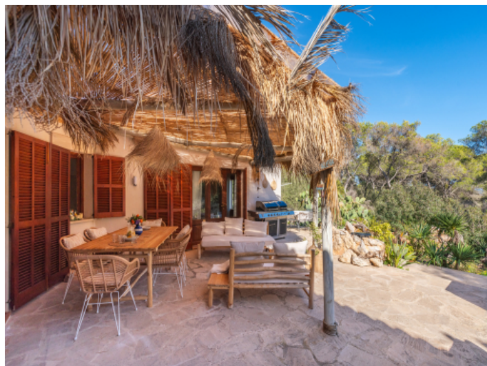
Idyllic terrace with dining and lounge area