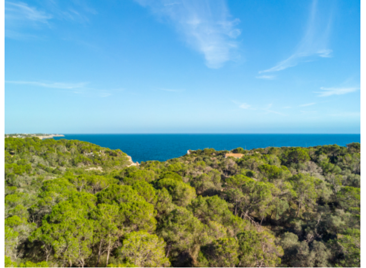
Stunning views to the sea