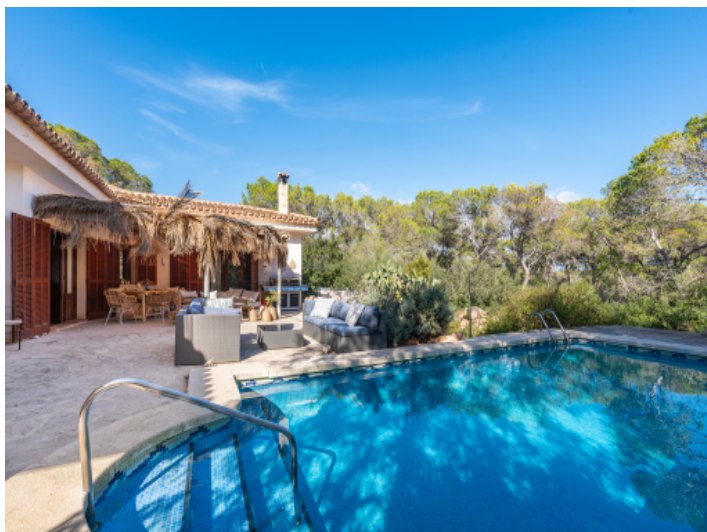
Enchanting pool area