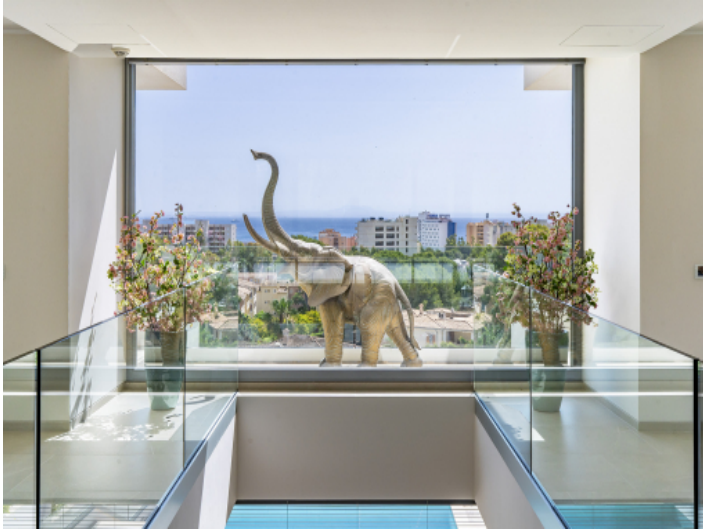
View from main floor