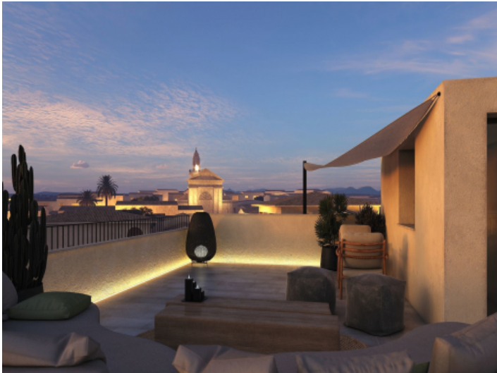
Rooftop terrace with views over the village