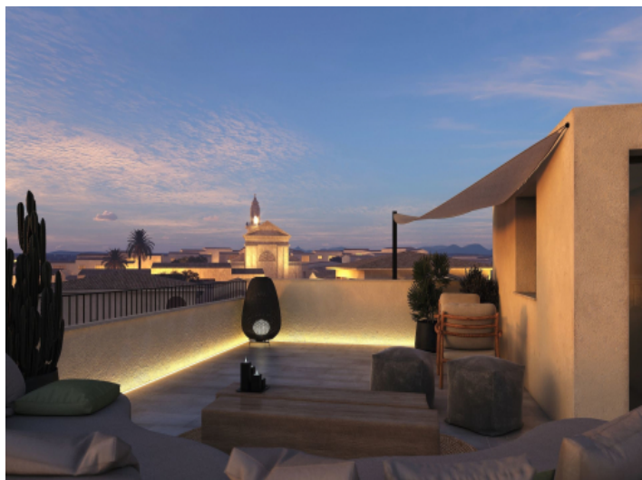
Rooftop terrace with views over the village