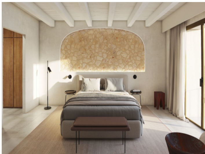
All bedrooms with bath en suite