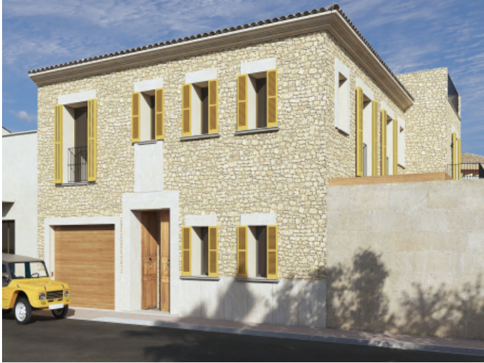
The natural stone facade