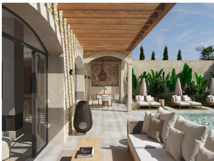
Covered terrace close to the pool