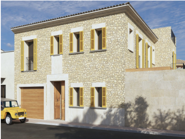
The natural stone facade