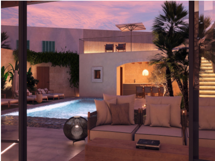
Mallorquin tradition meets modern architecture