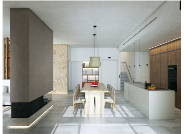
Dining area with fireplace