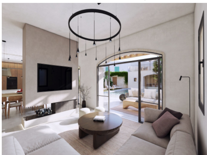
Cozy and relaxed lifestyle