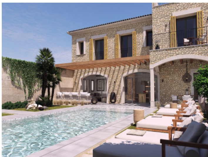
10x4m large Pool