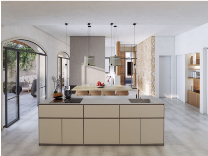
Amazing cook island