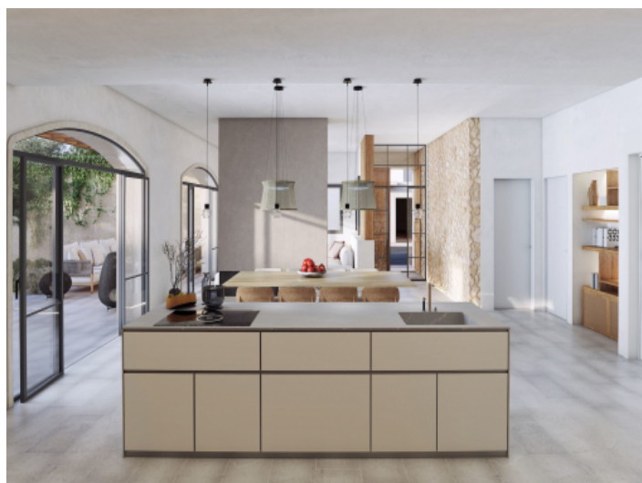
Amazing cook island