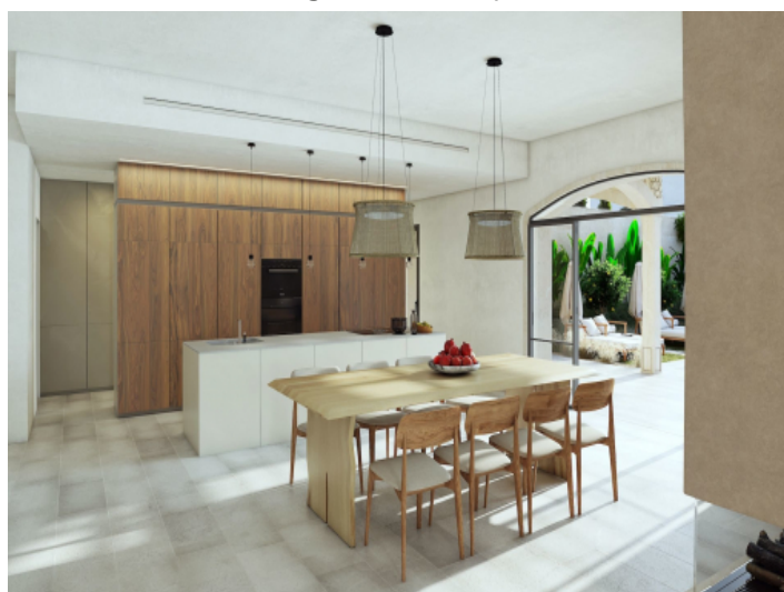
Light-flooded, spacious and open rooms