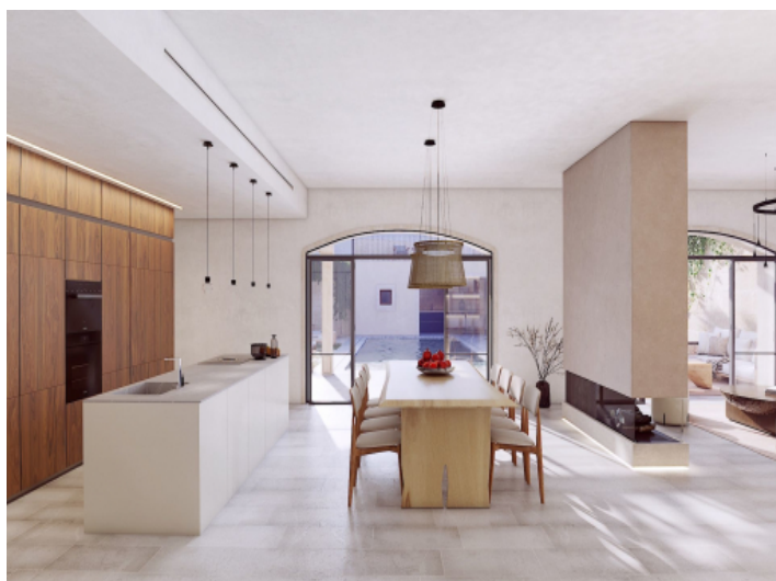
High quality kitchen