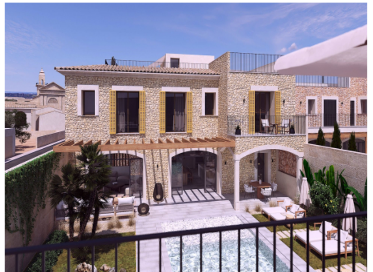
Top location in Ses Salines