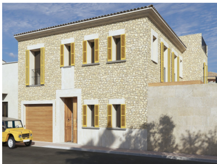
The natural stone facade