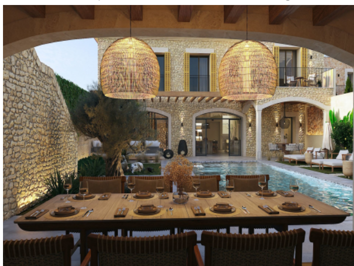
Amazing outdoor area