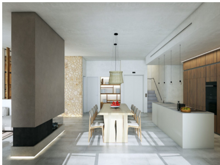
Dining area with fireplace