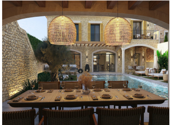
Amazing outdoor area