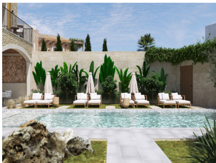
Large pool and garden