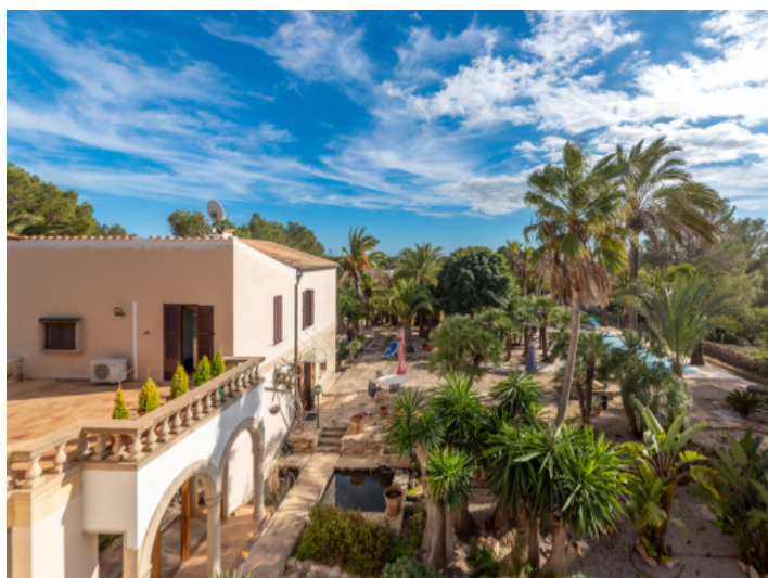
View over the garden