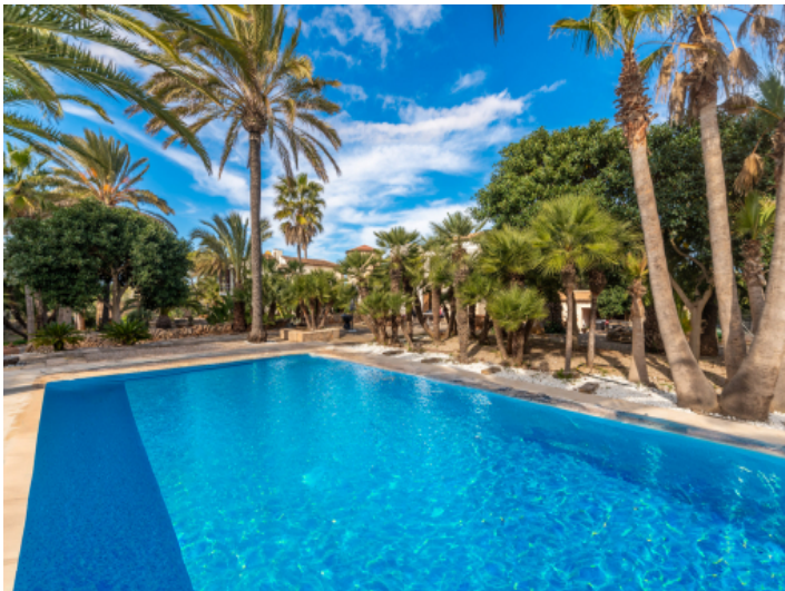
Amazing pool area