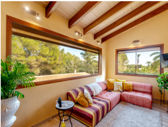
Living area 2