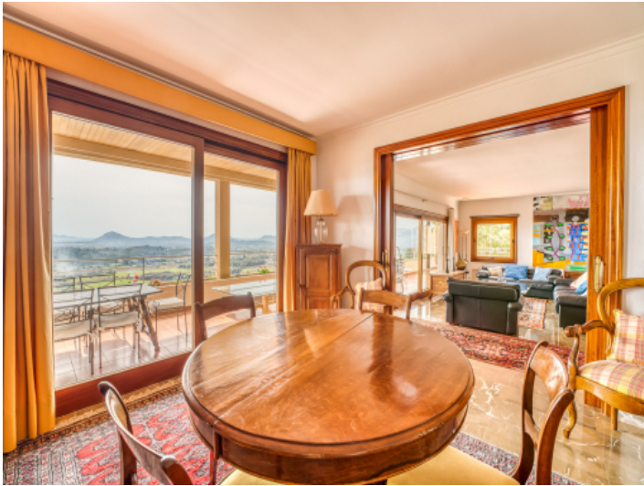
Dining area with sea views