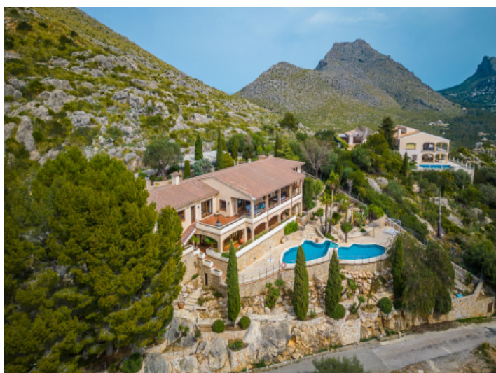
View to the villa