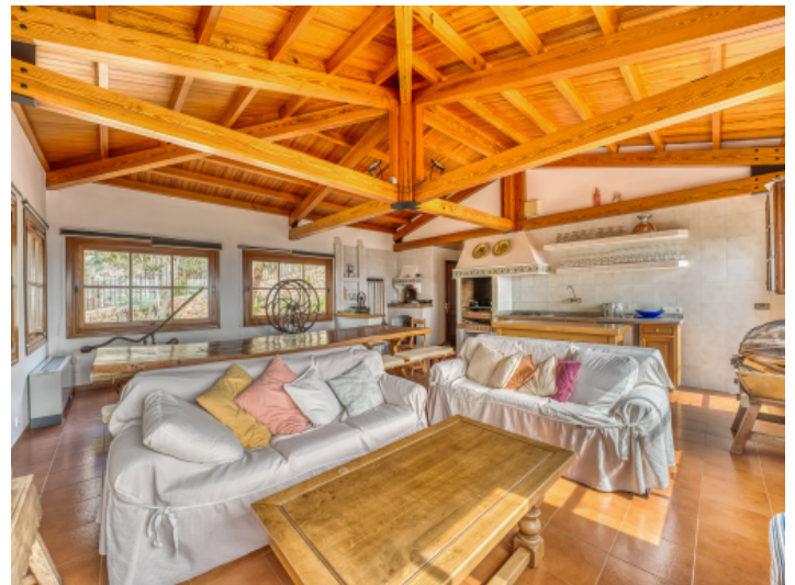
Open plan design on the rooftop floor