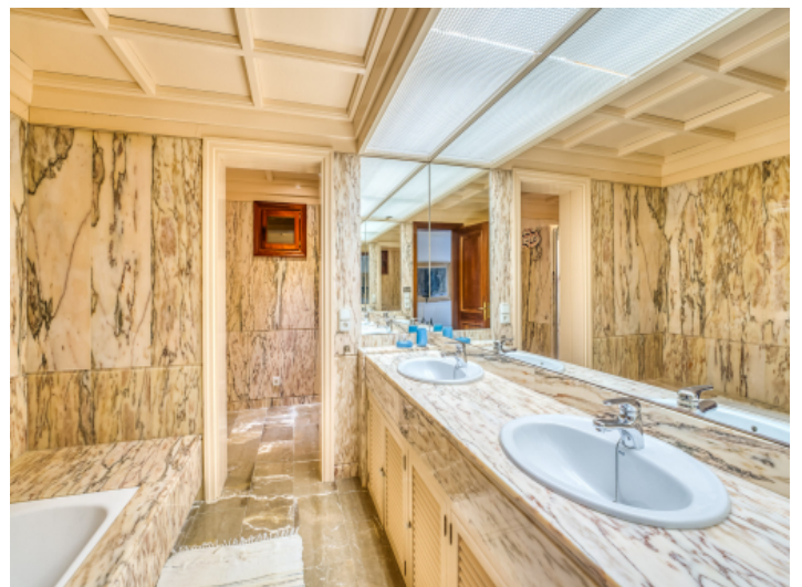
On eof 4 bathrooms