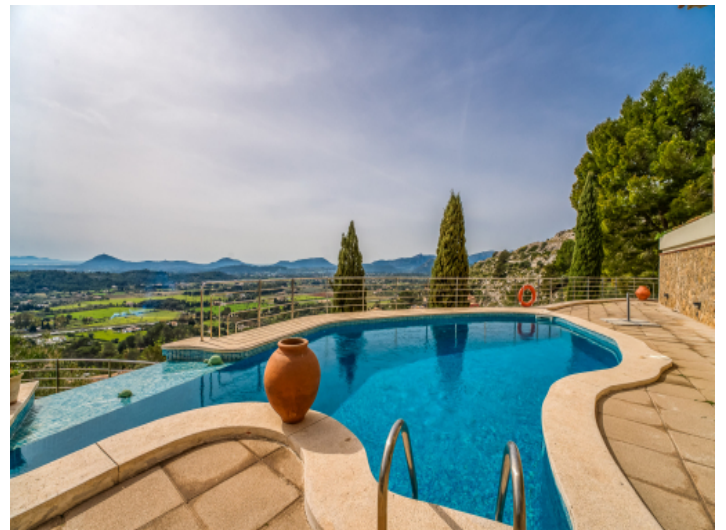
Pool with amazing views