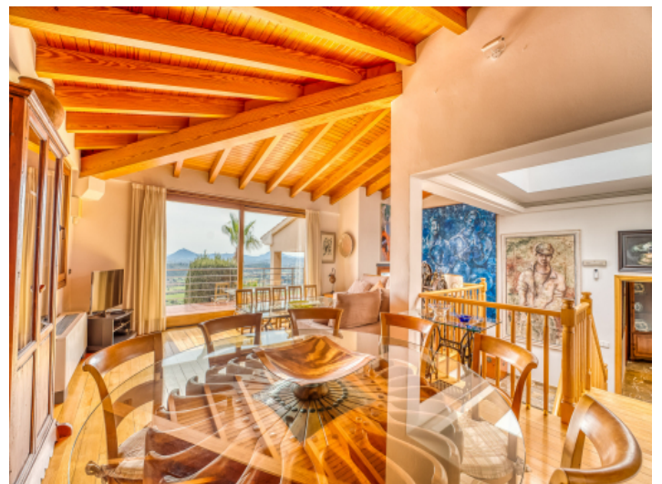
Living and dining area on the upper floor