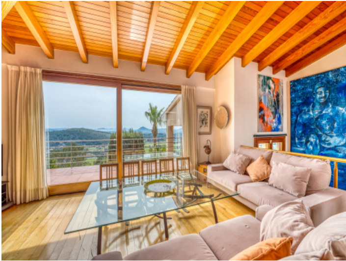
Relax with amazing views