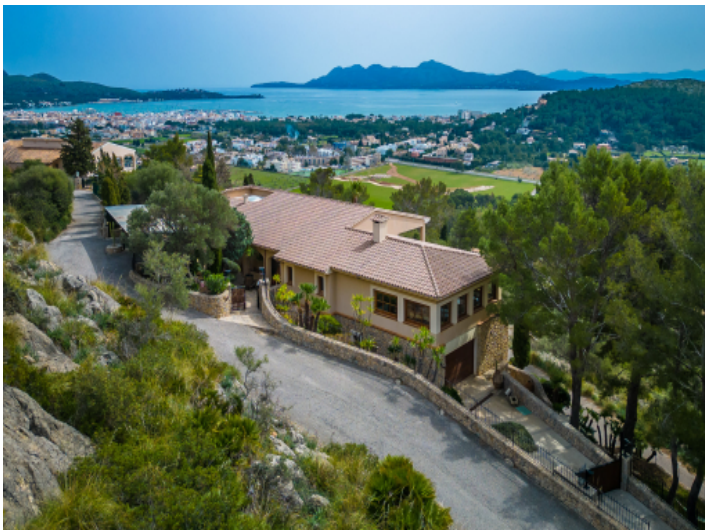
Stunning sea views