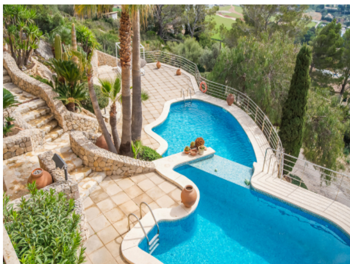
Pool on 2 levels