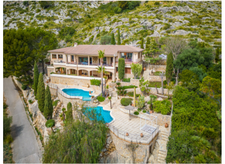
View of the villa