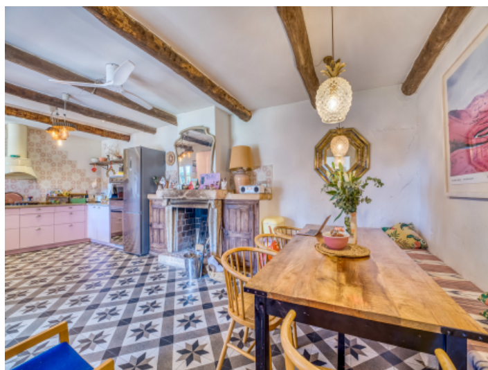
Kitchen and dining area