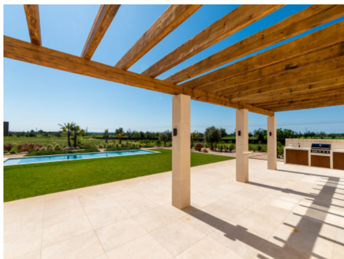
Terrace with barbecue area