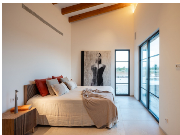
One of 3 comfortable bedrooms