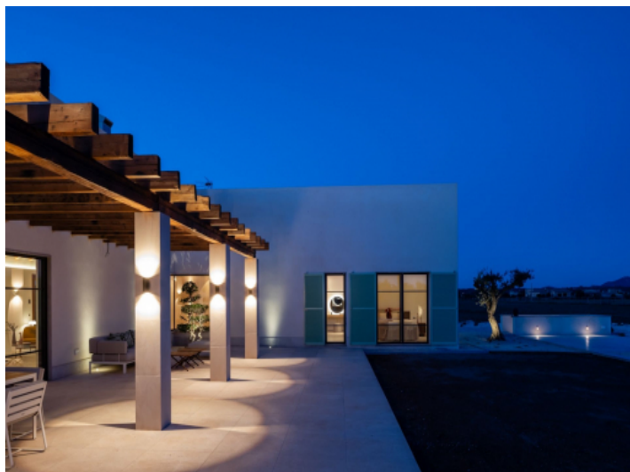
Finca in great location