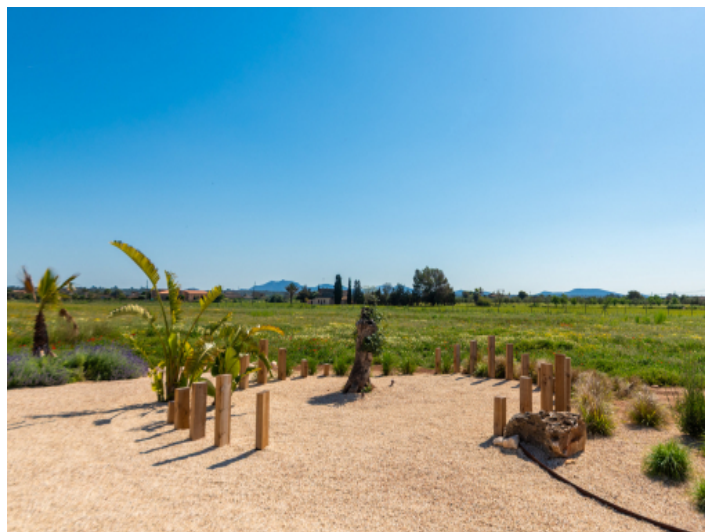
Lovingly landscaped garden