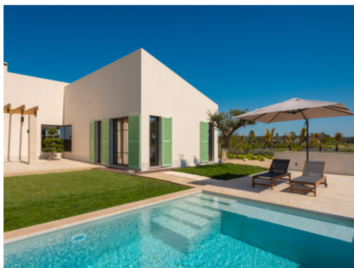
Pool with sun terrace