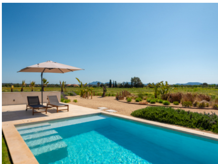
Finca with far-reaching views