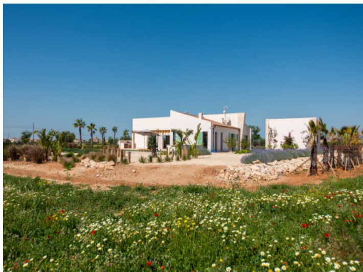
Newly-built finca with Pool