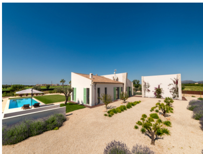
Outdoor view of the finca