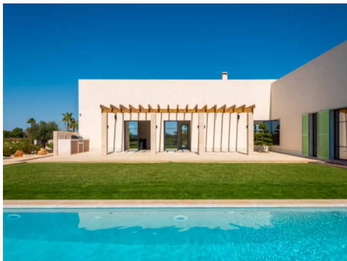
Finca with pool