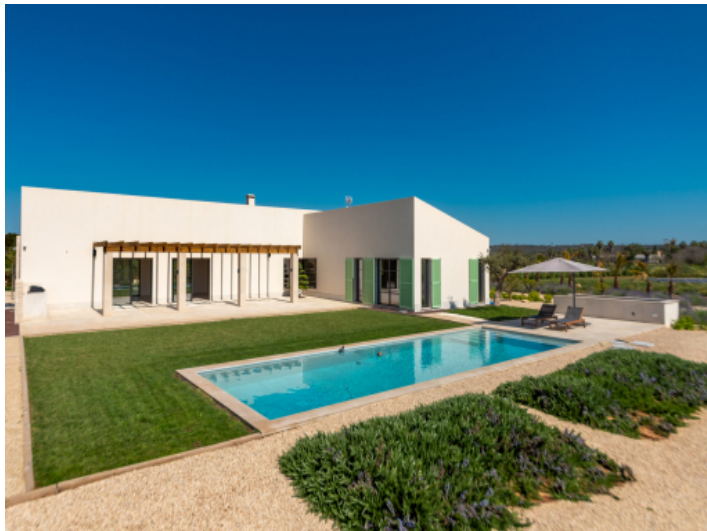
Finca with pool