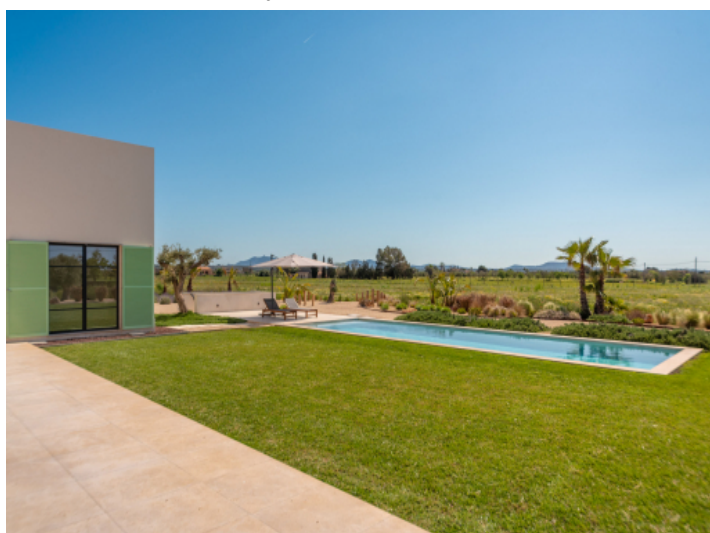
Finca with pool