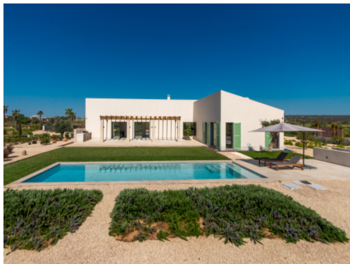
Front view of the finca