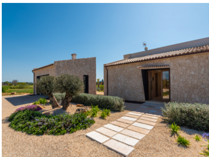
Exterior view of the garden