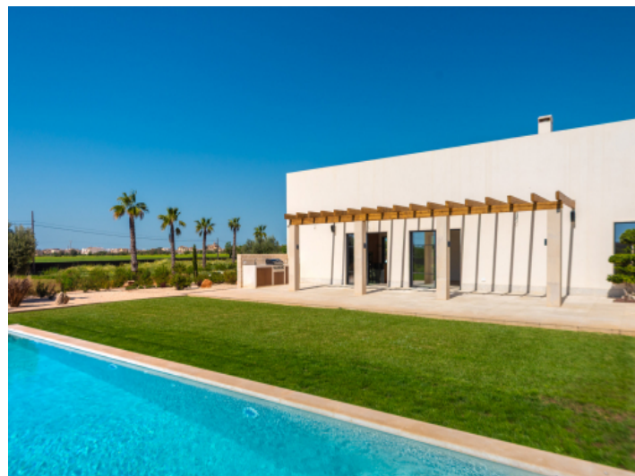
Finca with pool