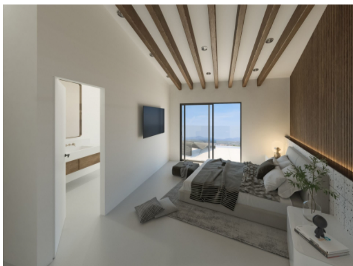
Bedroom with upper terrace