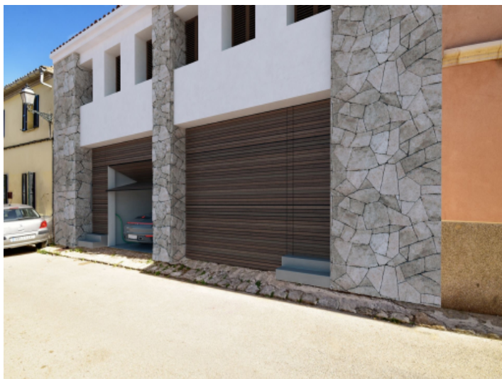
Front view and garage