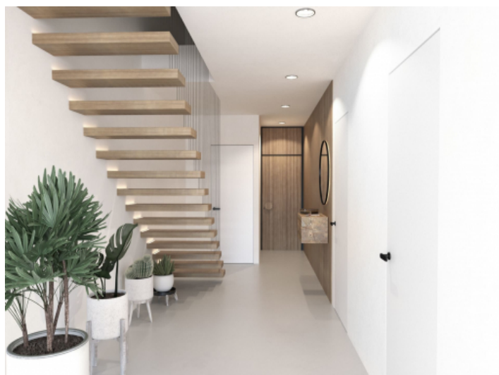
Corridor and staircase