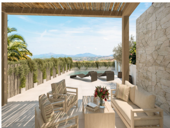
Terrace and pool area