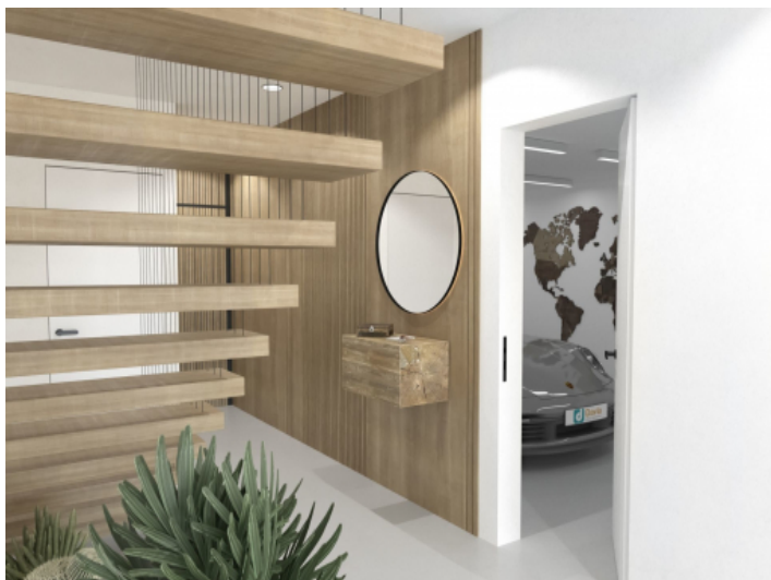
Direct garage access