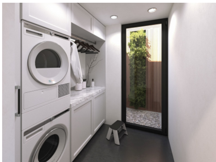
Separate laundry room