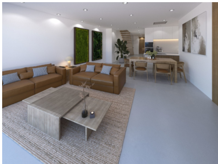
Open plan living area