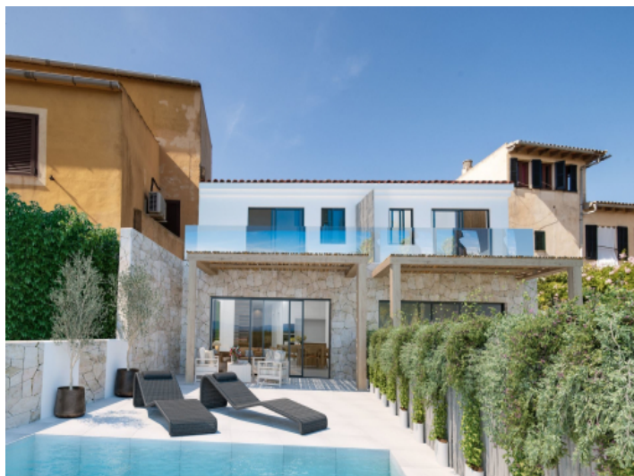
house, Maria de la Salut