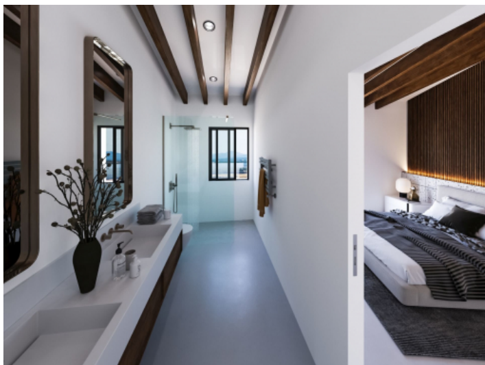
Modern en suite bathroom