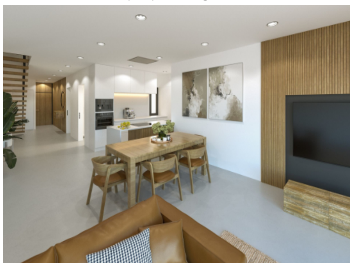
Modern living concept