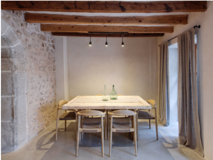
Dining area from the townhouse