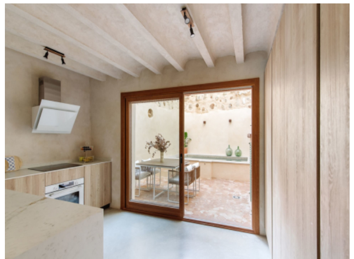
Kitchen with direct terrace access