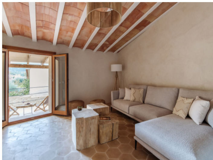
Beautifully renovated village house in the center of Alaró