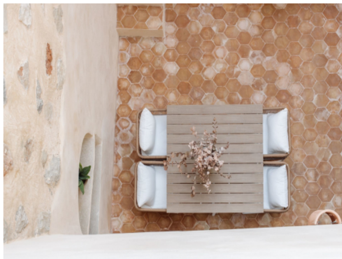
Tranquil area on the terrace