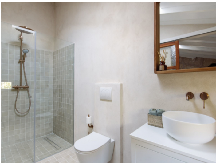
Bathroom with shower