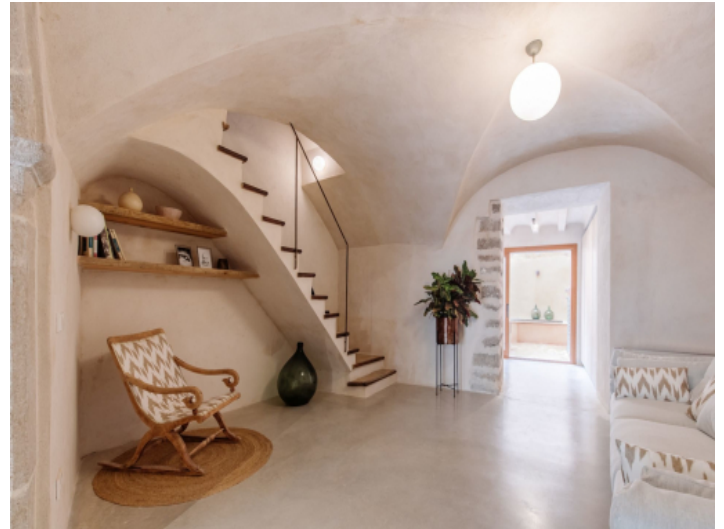
Entrance from the townhouse