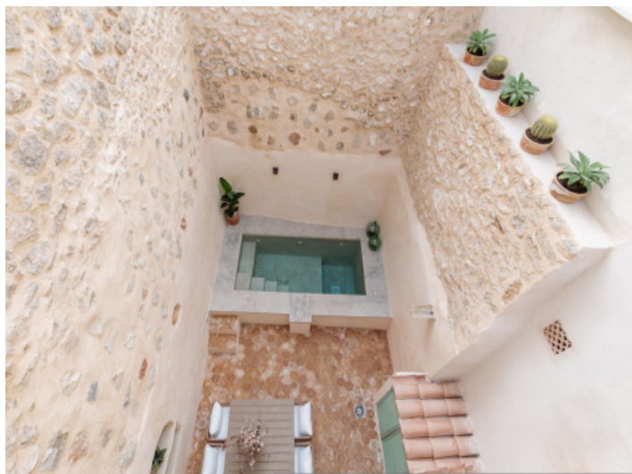
Patio with pool