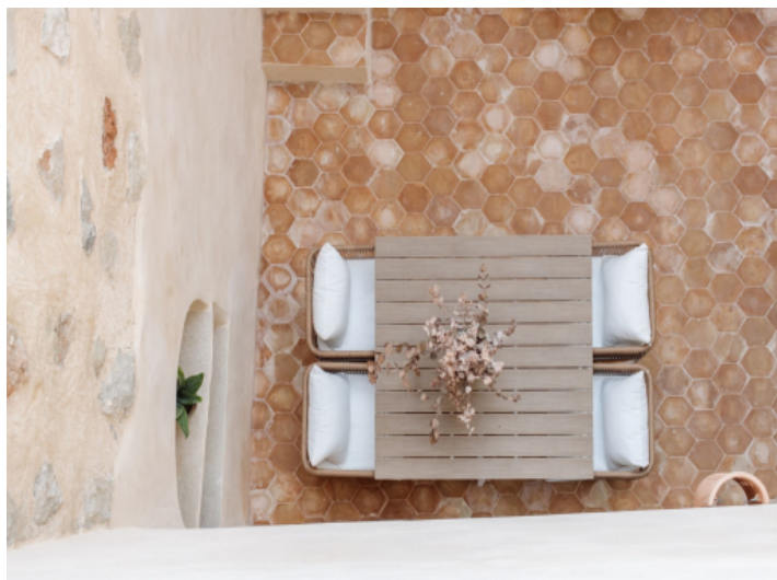
Tranquil area on the terrace