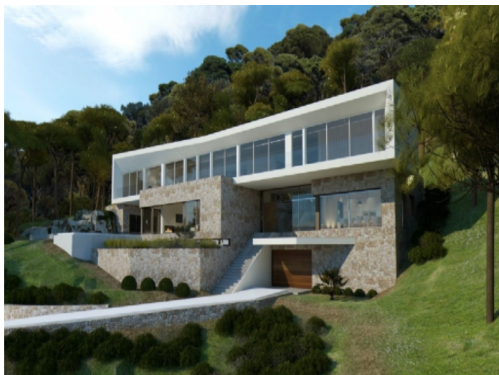
Exterior view of the villa in Sol de Mallorca