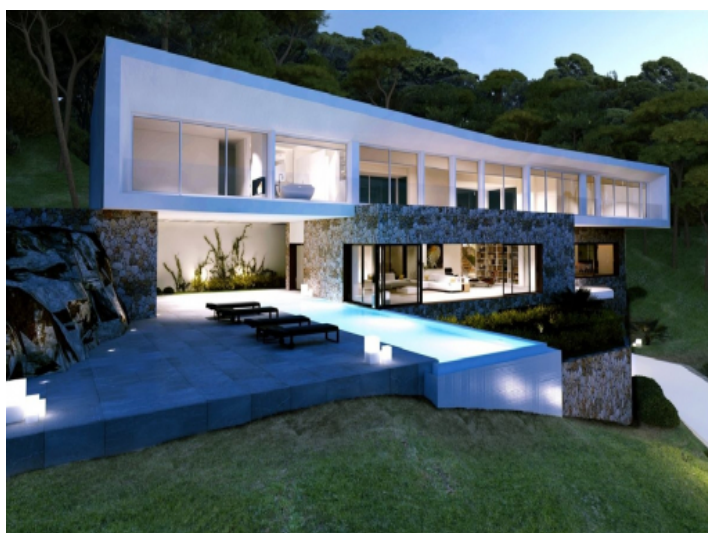
Exterior view by night