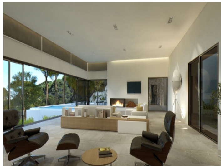
Living area with large window facade