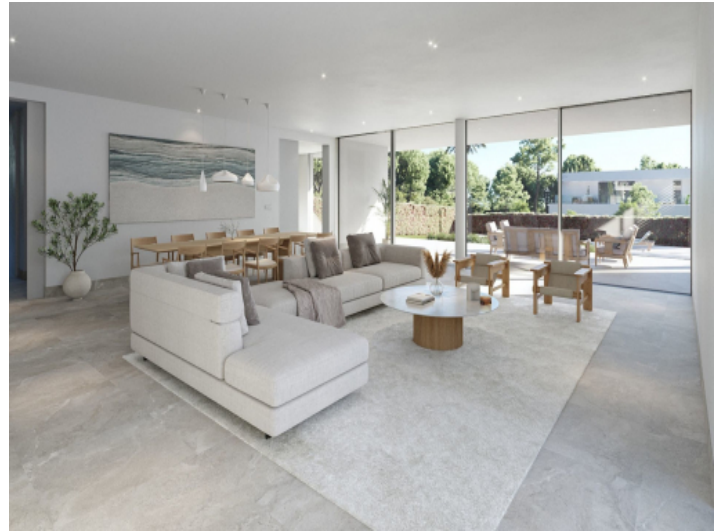
Modern living area