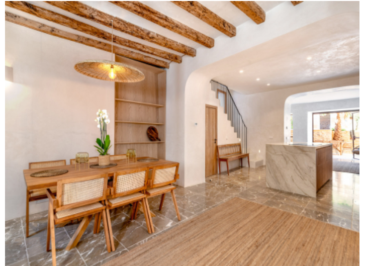
Open kitchen and dining area