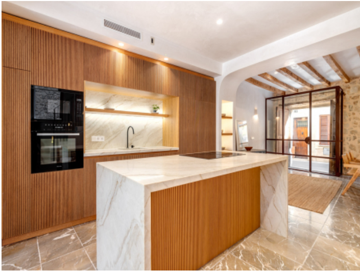
Kitchen with cooking island