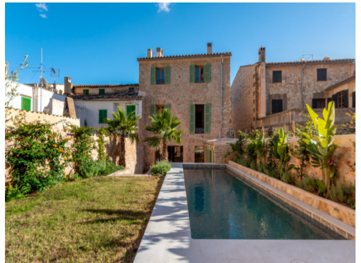
Well-tendet garden with pool