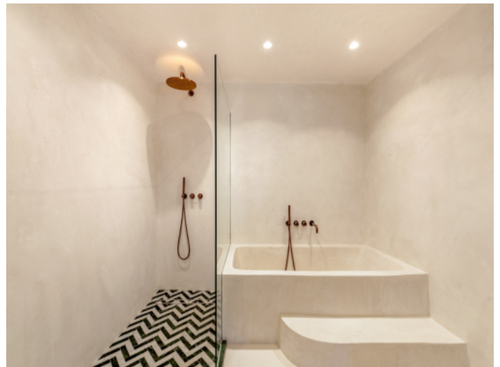
Bathroom with shower and bathtub