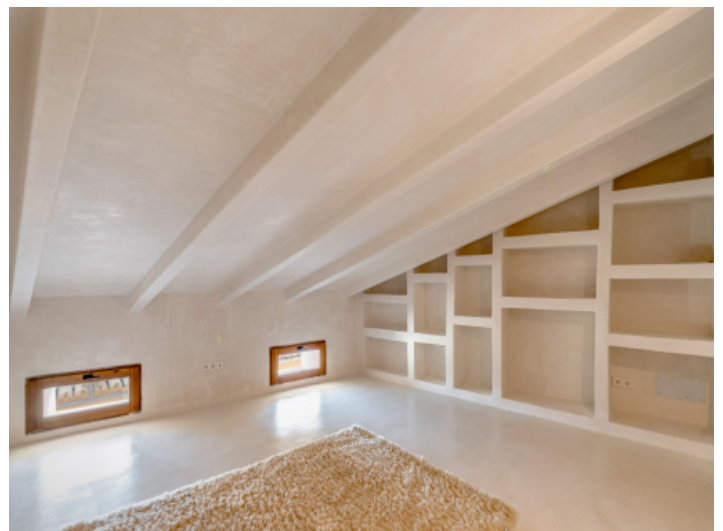
Room with a lot of possibilities