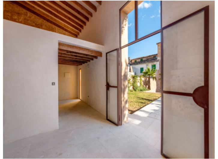
Garden access from the house