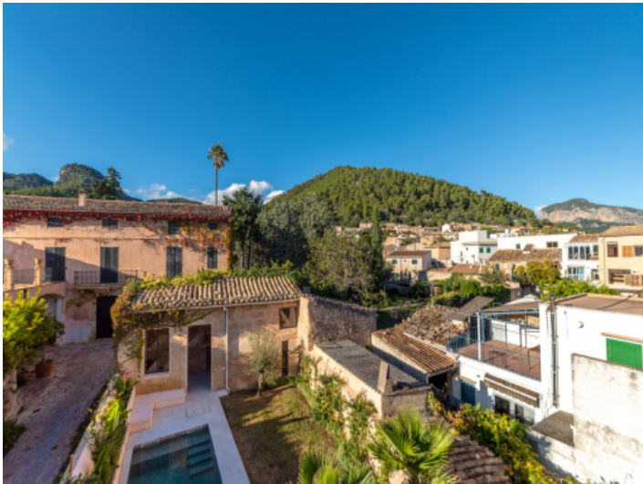
Unique landscape views from the upper floor