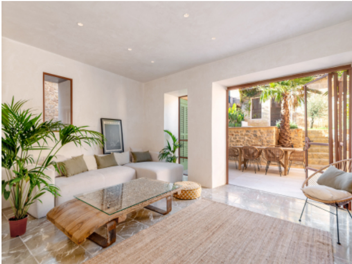
Modern living area with terrace views