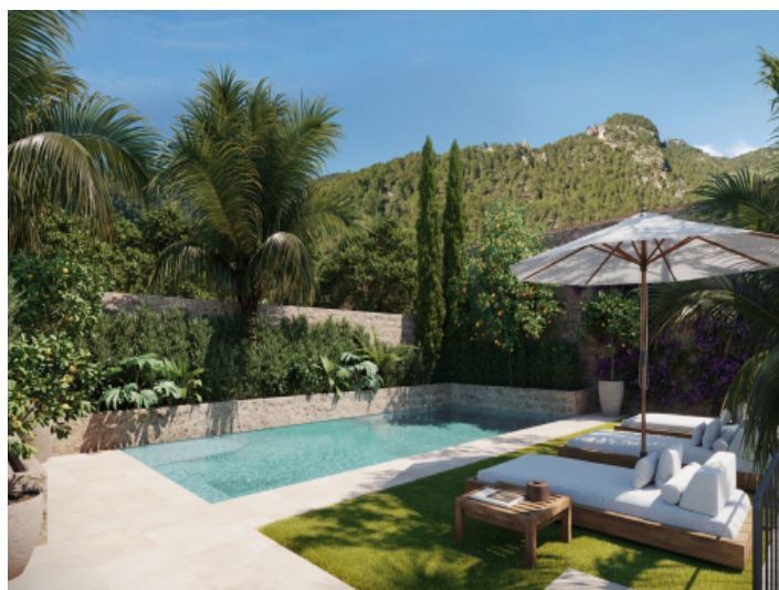
Wonderful pool area