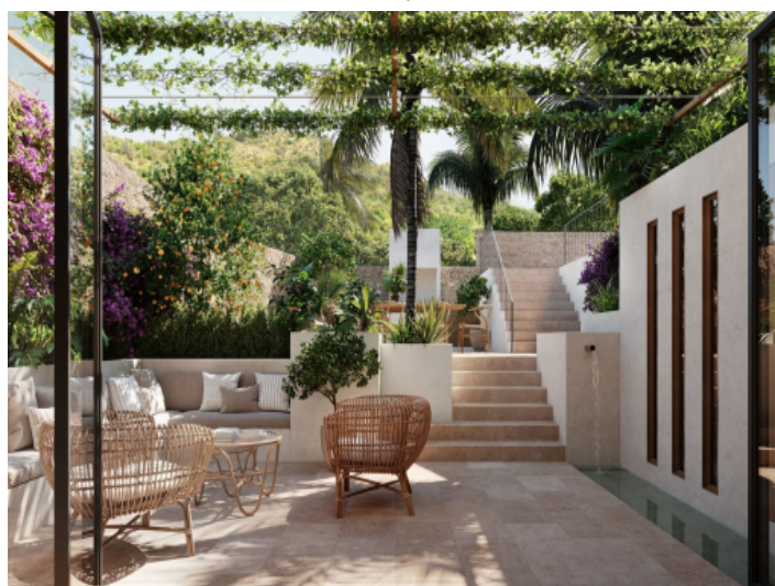
Beautifully laid-out terrace