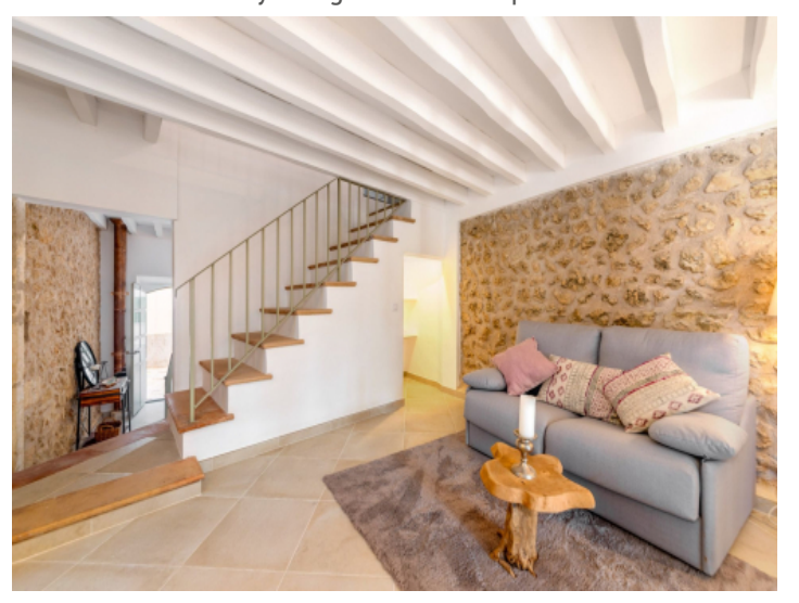
Living area with staircase