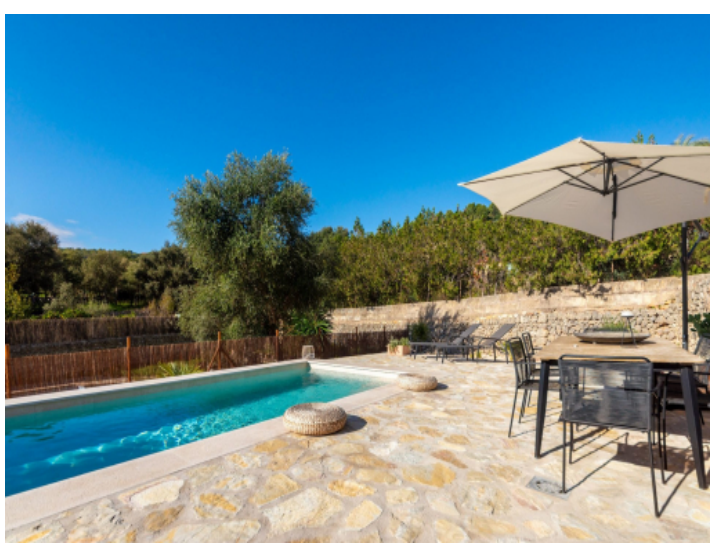
Ample terrace with pool