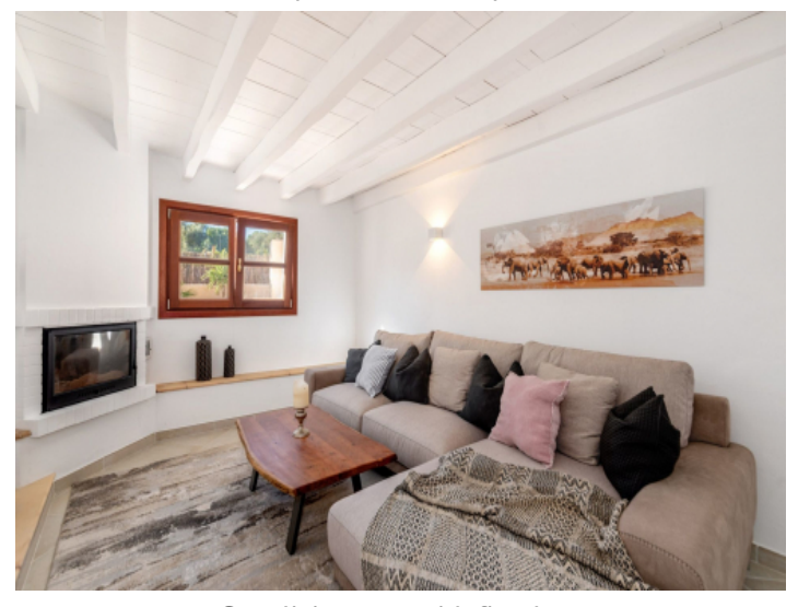
Cosy living area with fireplace