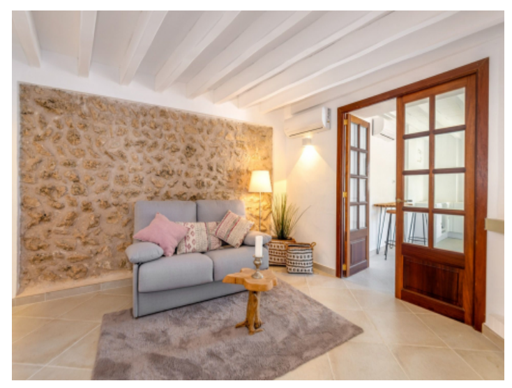
Additional living room