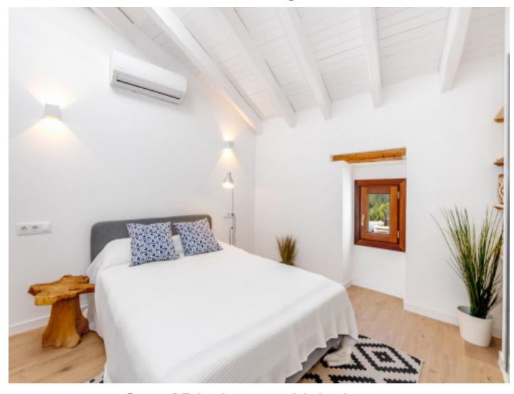
One of 3 bedrooms with bathroom