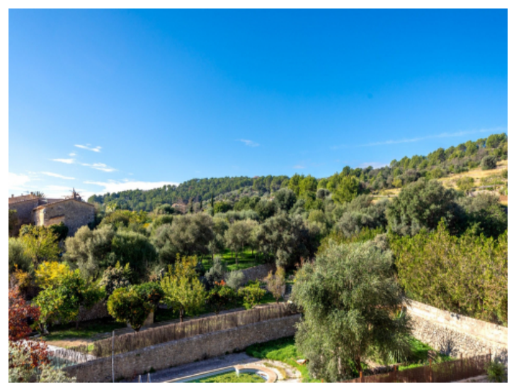
Exterior view from the upper terrace