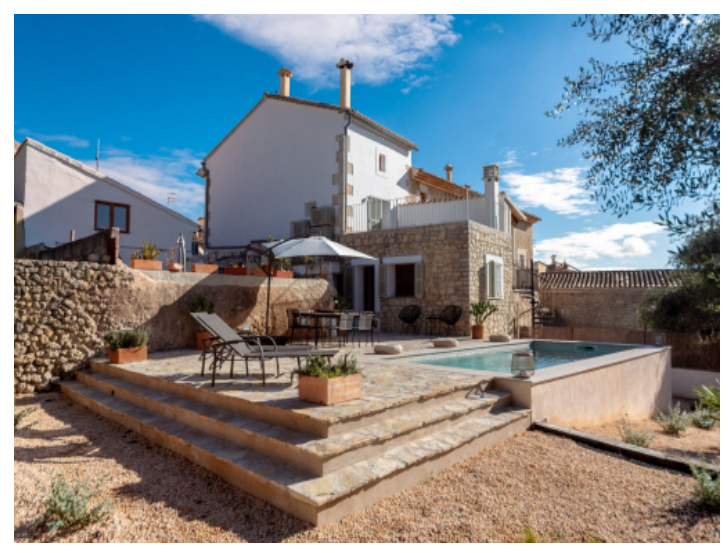
Exterior view of the house with garden and pool