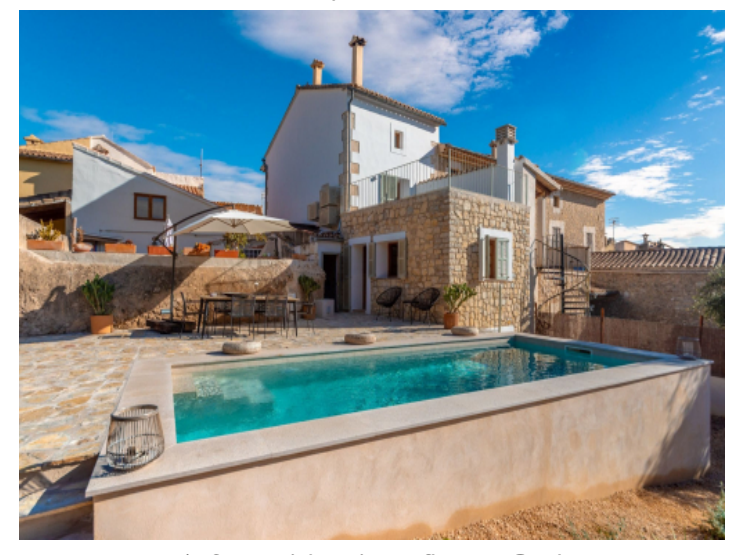
Außenansicht mit gepflegtem Pool