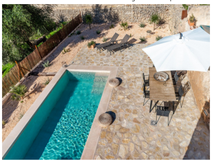
Exterior view from above