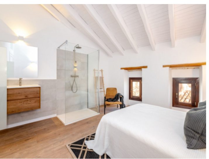
One of 3 bedrooms with bathroom