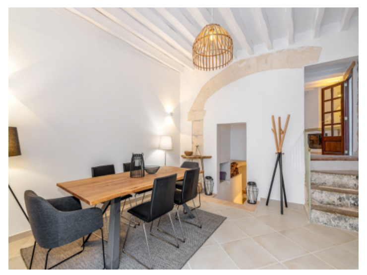
Modern dining area