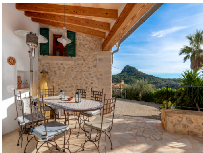
Cozy outdoor dining area