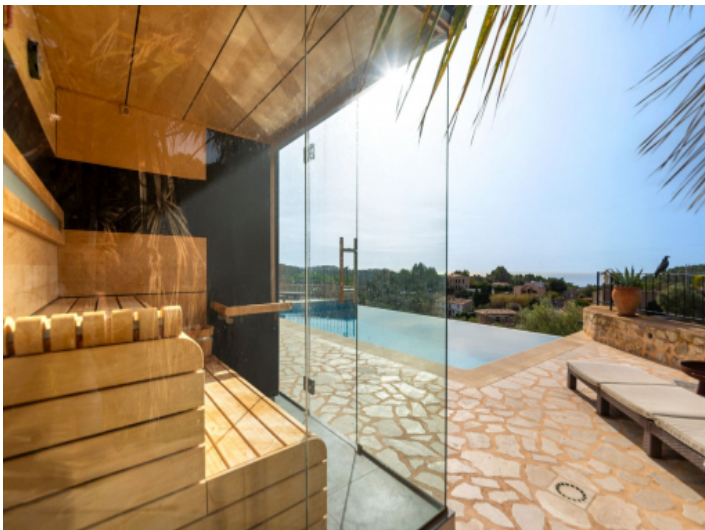
Sauna close to the pool