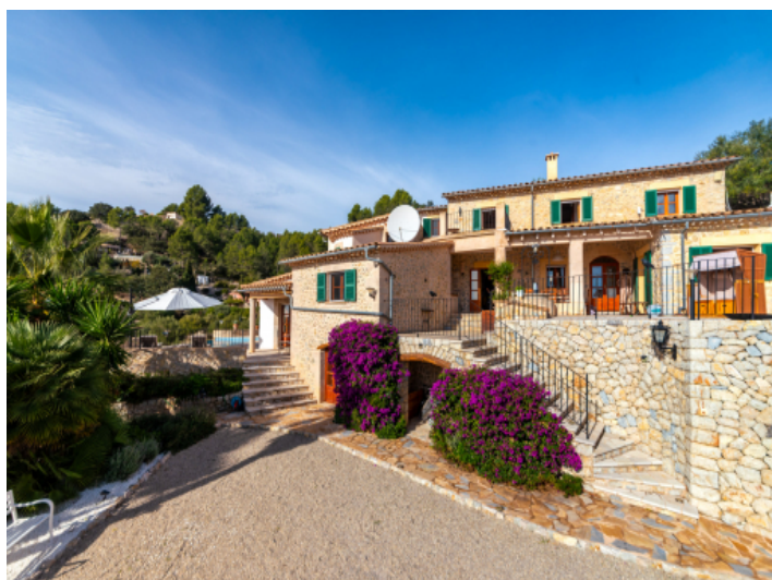
Charming village house with pool and amazing views in