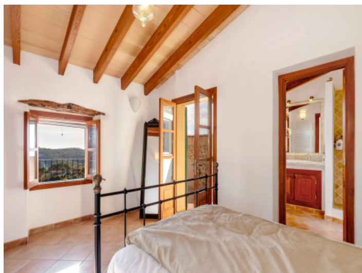
Wooden ceiling bedroom