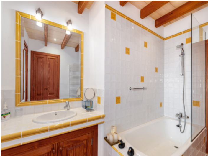
Rustic styled bathroom