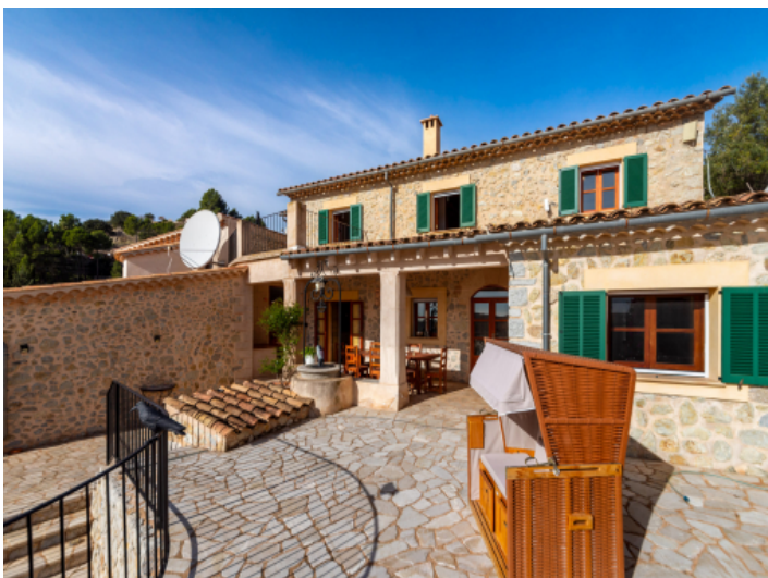
Mallorcan architecture embedded in the landscape