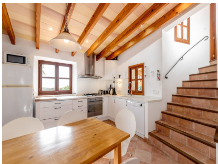
Bright and modern second kitchen