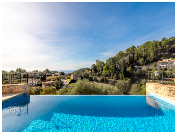
Charming infinity pool