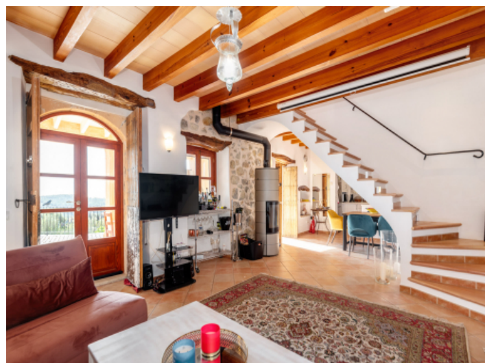
Living room with fireplace