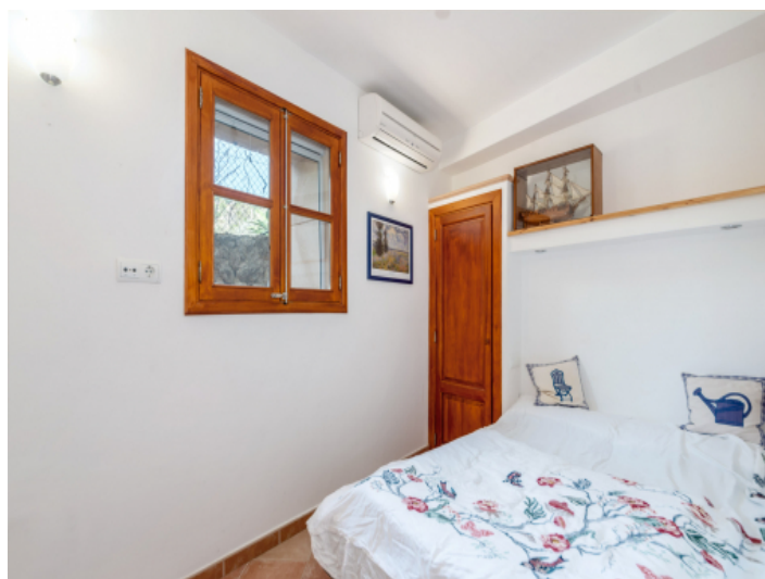
Bedroom with A/C