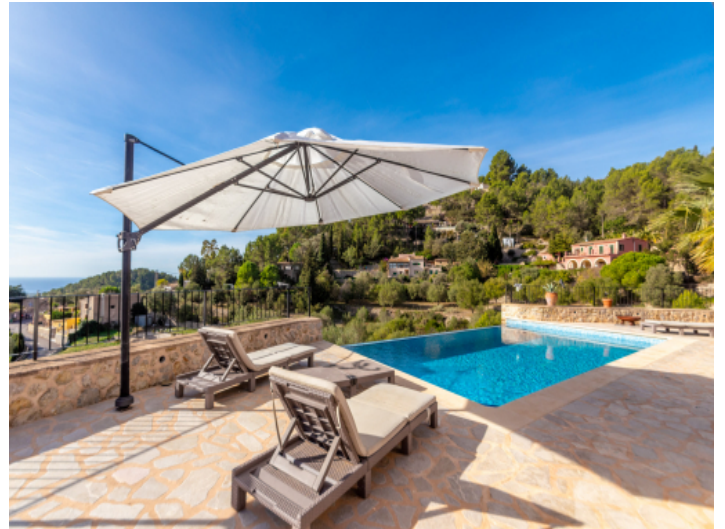
Large natural stone terrace