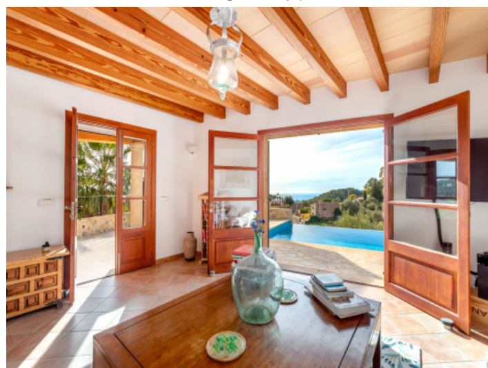
Bright living with beautiful views