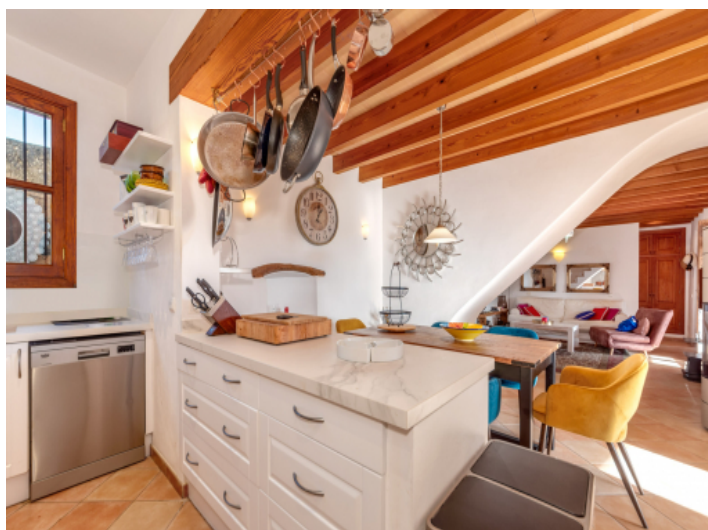
Modern open kitchen