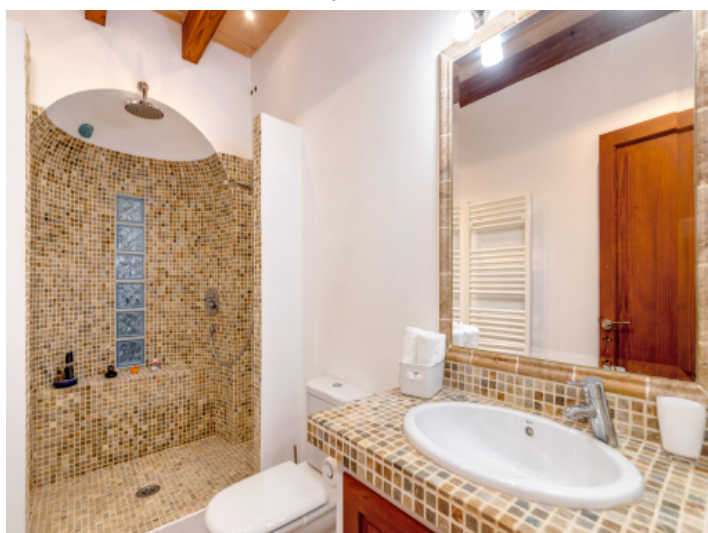
Rustic shower bath