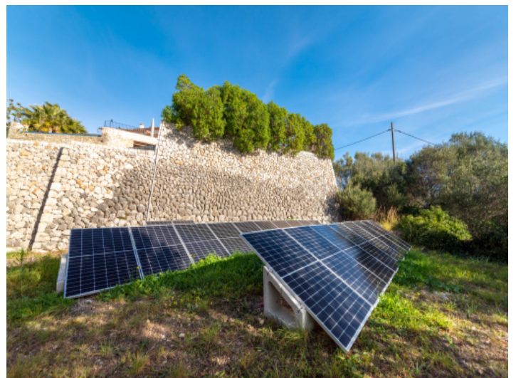
Solar energy on the plot