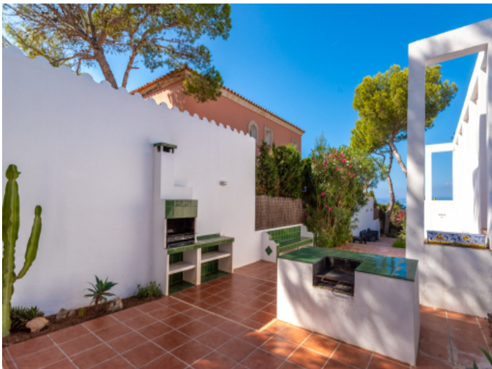
Patio with barbecue area