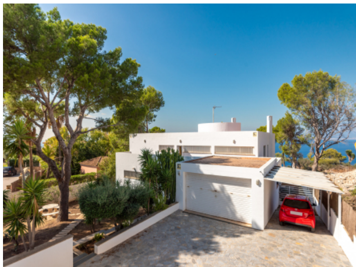
Garage and covered parking space