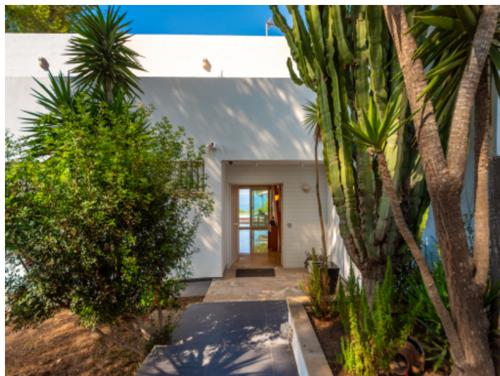
Entrance to the villa