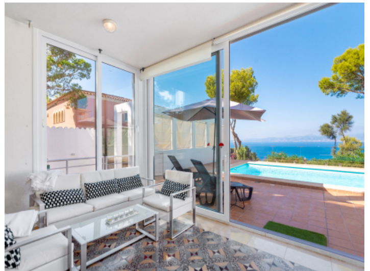
Wintergarden with pool views

PORTA MALLORQUINA • C./ COLOM 20 2º, 07001 PALMA, SPAIN