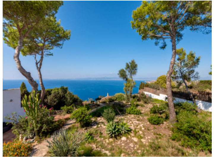
First sea line villa