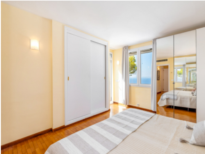
Bedroom with built-in wardrobe