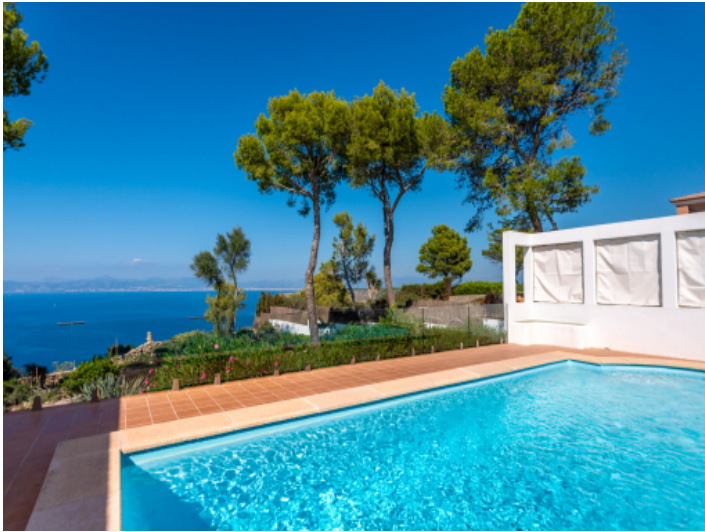
Pool and sea views