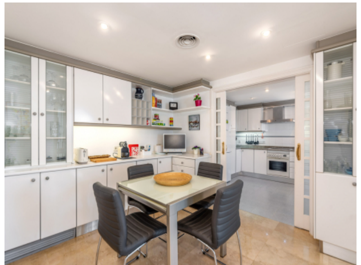
Kitchen is separated in two rooms