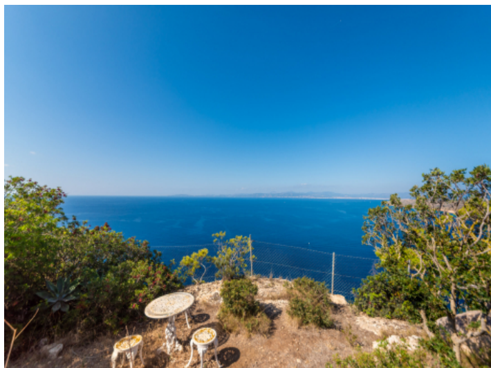
Terrace with views to the bay of Palma