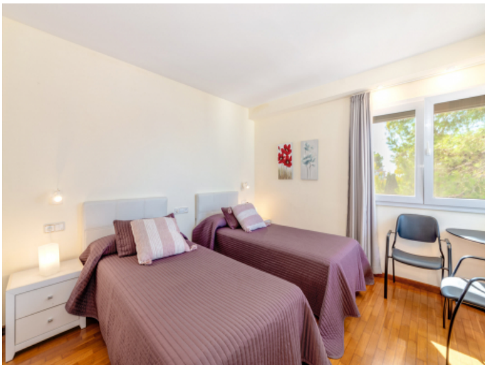
Bedroom with two single beds