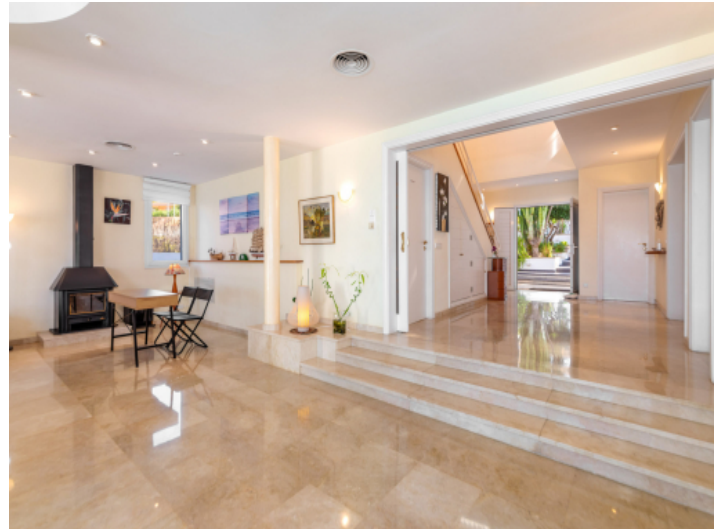
Living area with views to the entrance