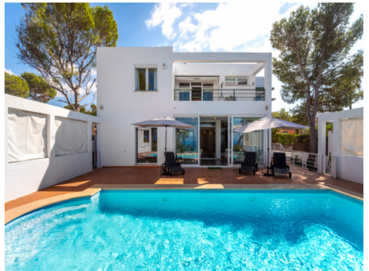
Villa with two levels and pool