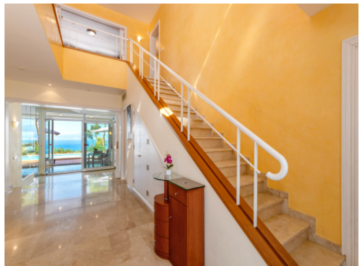
Corridor with staircase