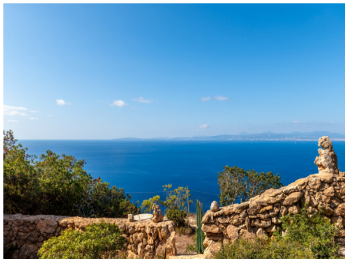
Gorgeous sea views