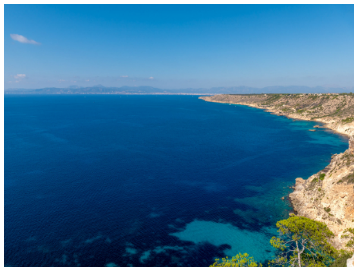
Sea views over the mediterranean sea