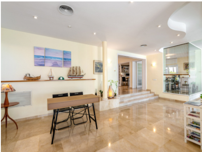
Living area with views to the dining area