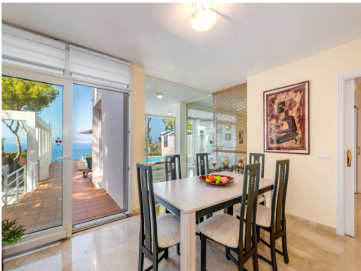
Elegant dining area