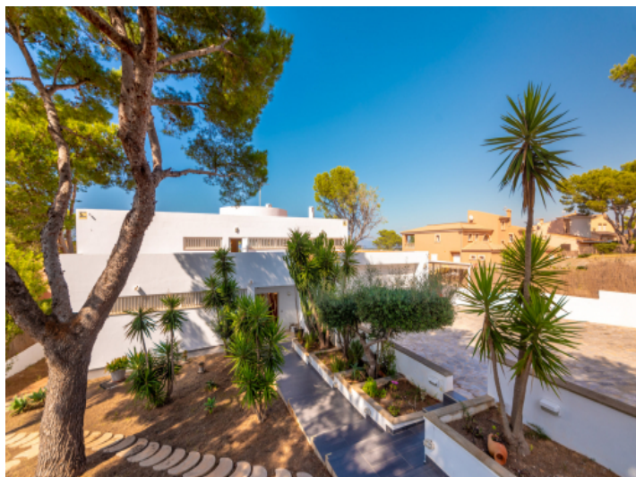
Front views from the villa