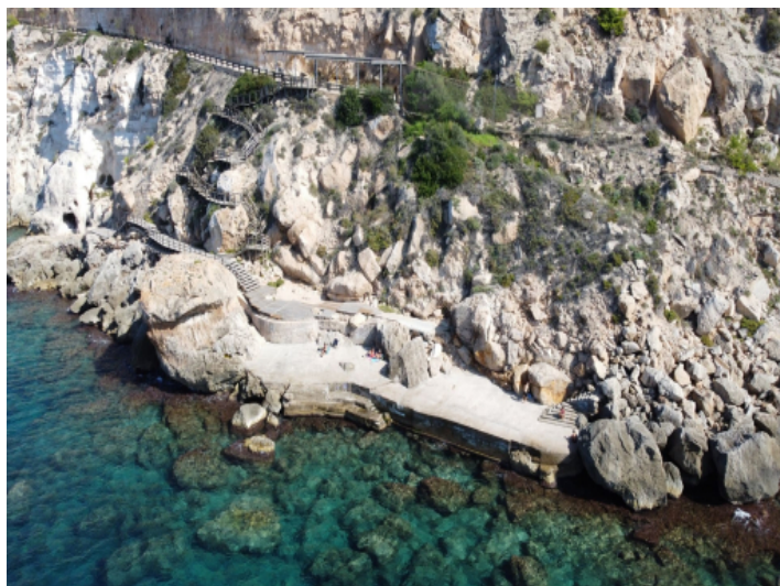
Sea access close to the villa