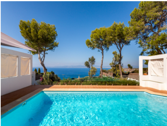
Pool area is surrounded by a terrace