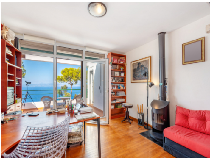
Office with fireplace