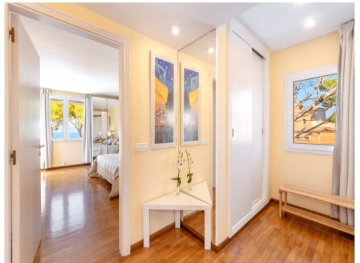
Bedroom with mediterranean sea views