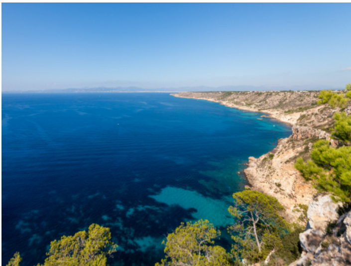
Unique sea views