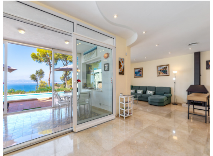
Terrace access from the living area