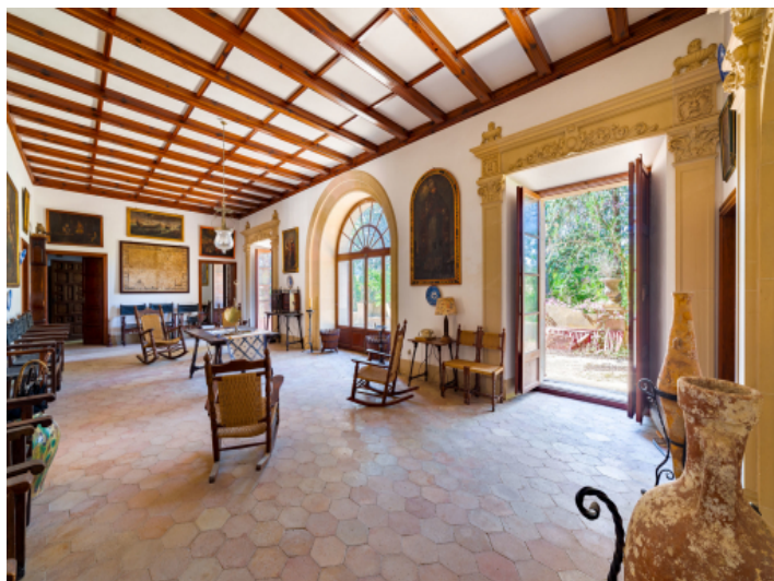
Large property in Establiments