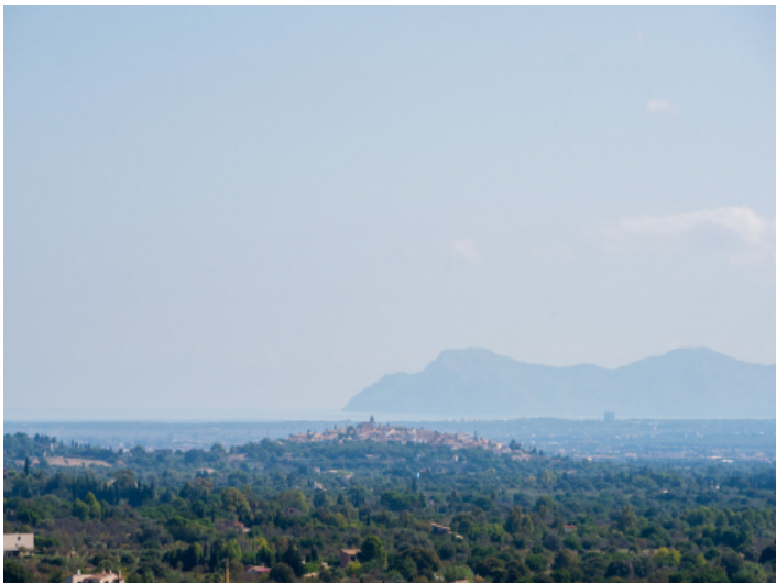
Views to the mountains from Artà