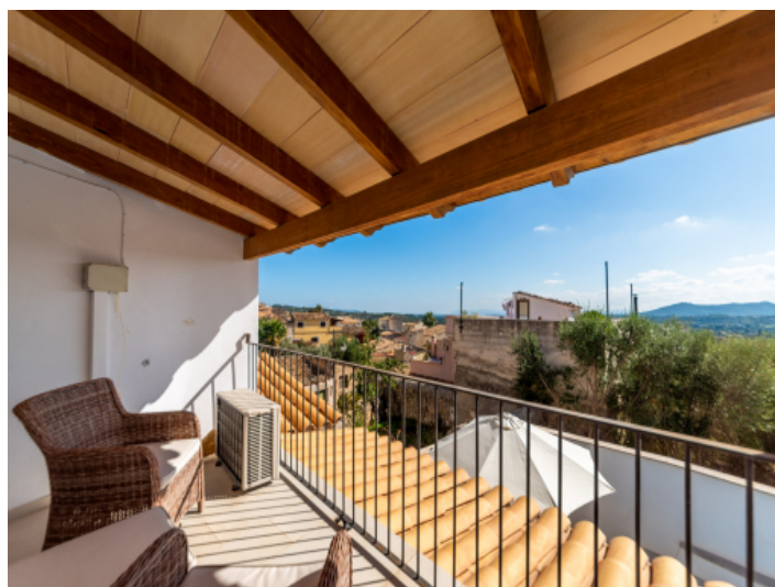
Balcony with landscape views