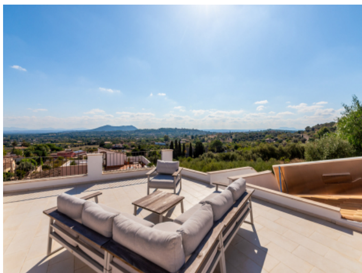
Sunny roof terrace