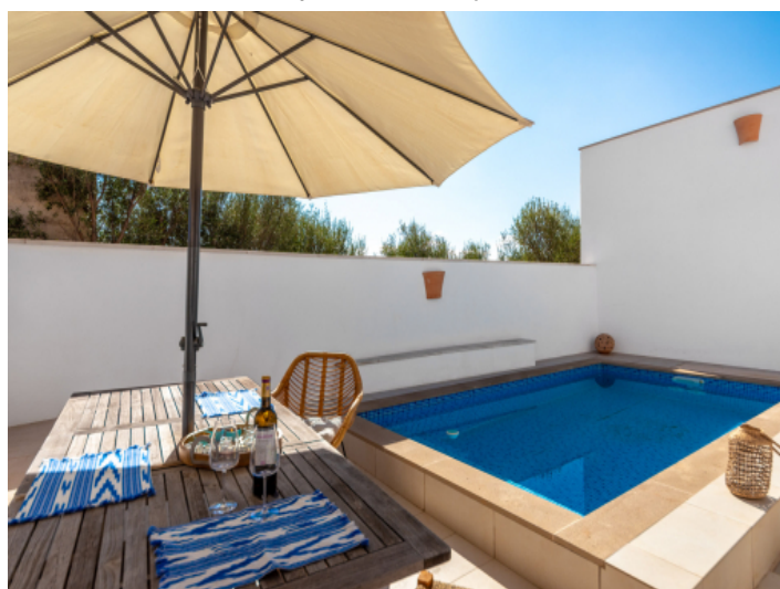
Pool and terrace area invites you to celebrate parties