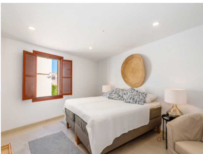
Light flooded bedroom