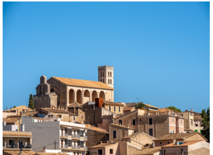
Views to the church from Selva