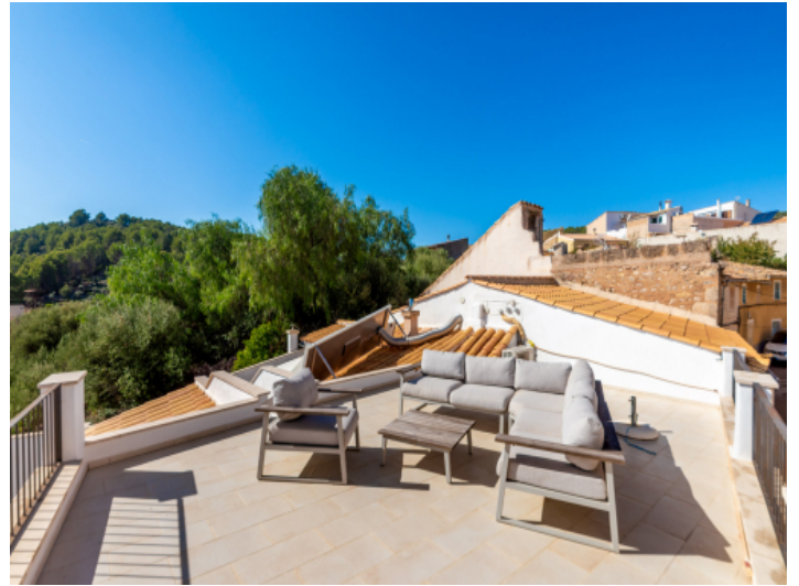
Elegant lounge area