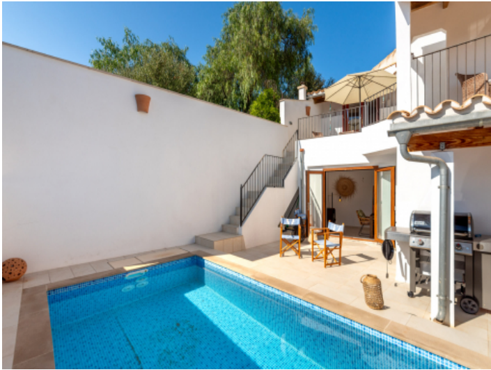
A staircase leads from the terrace area to the balcony area