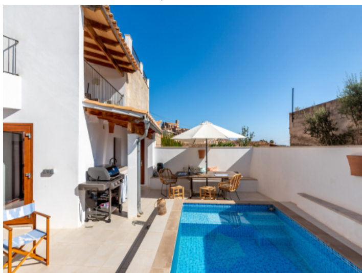
Barbecue area close to the pool