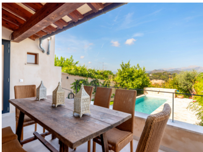
Spacious balcony with garden views