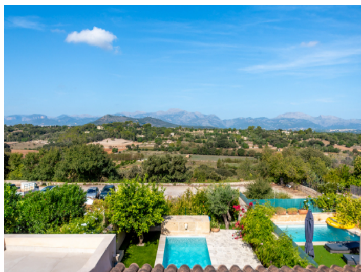
Unique landscape views