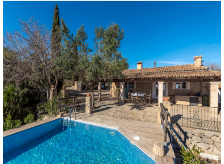
Pool area next to the terrace