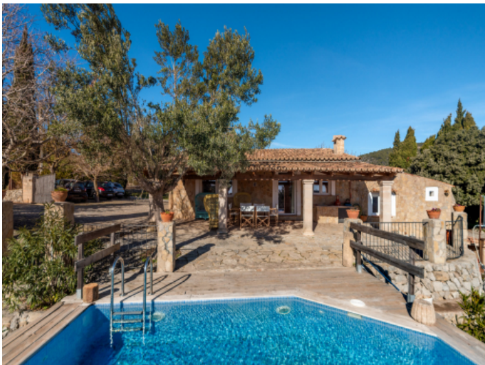
Pool and terrace