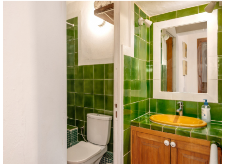
The 2. bathroom