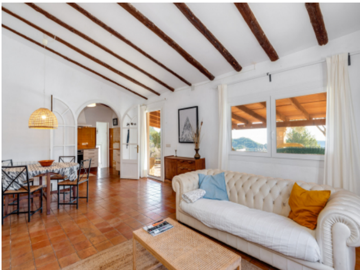
Cozy living area