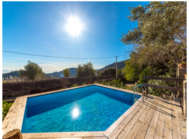
Sunny pool area