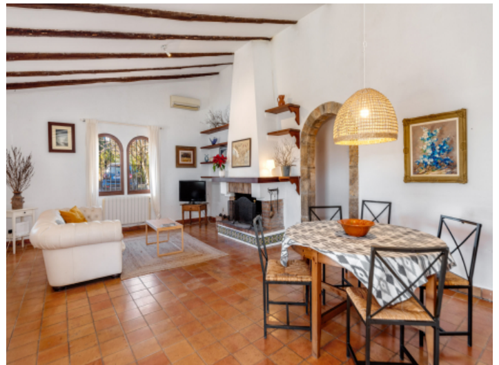
Dining and living area with wooden ceiling beams