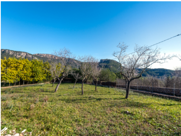
Garden with fruit trees