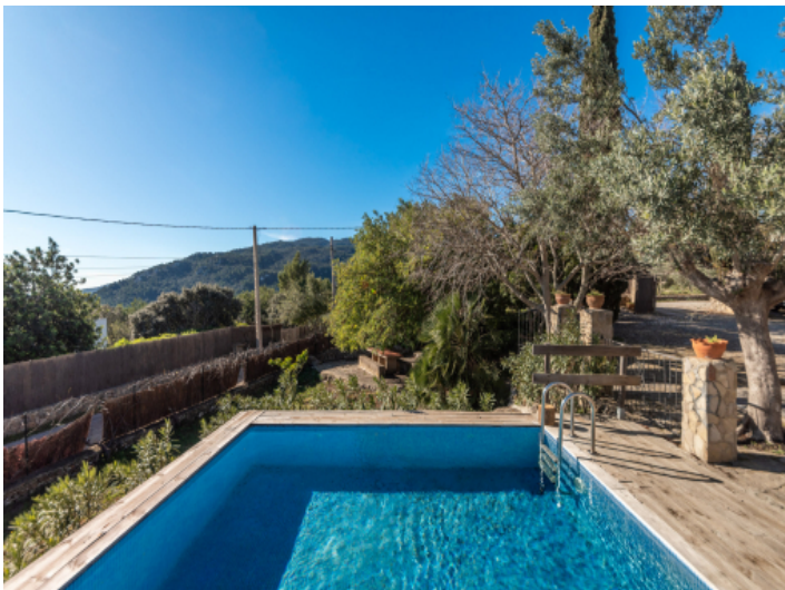
Pool for hot summer days