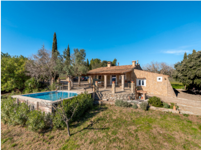
Exterior view of the finca with pool