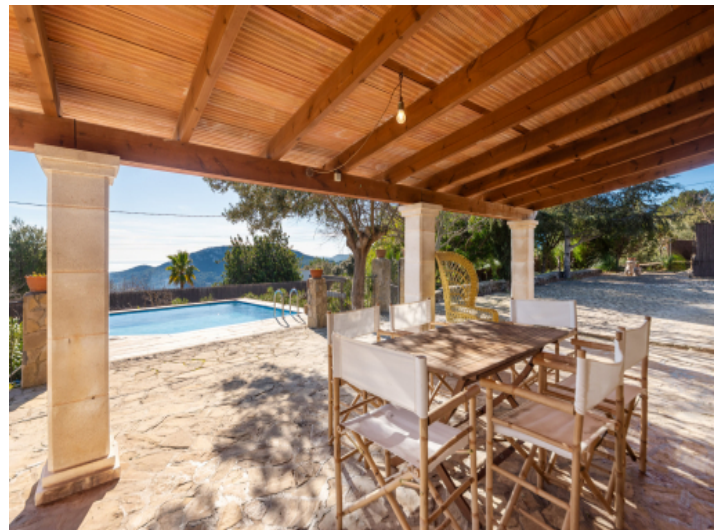
Porch with seating area