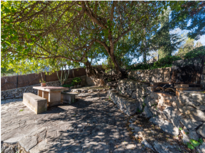
Terrace with natural stone tiles