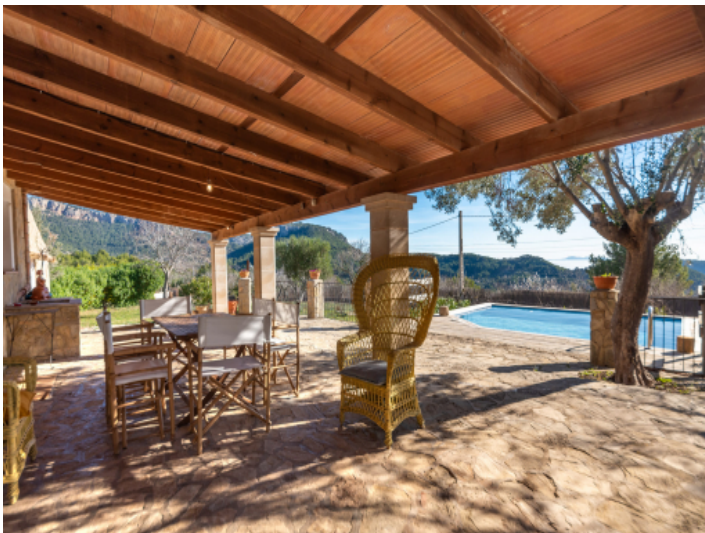
Large covered terrace