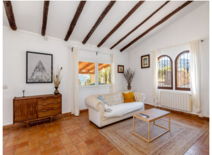
Original wooden beams