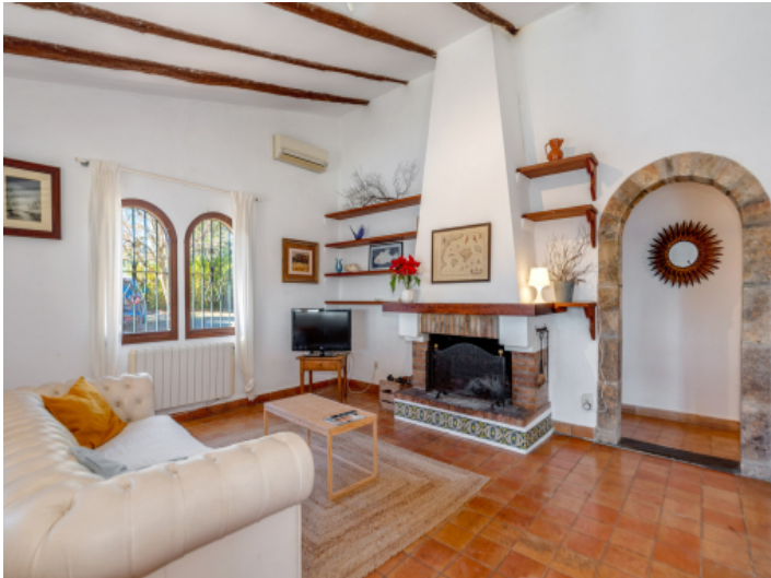
Living area with fireplace