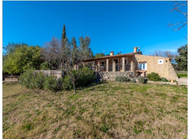
Garden and view to the house