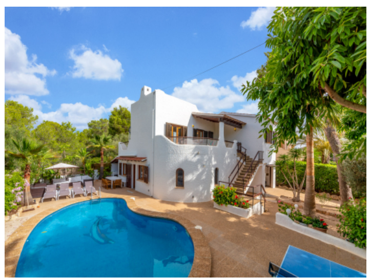
View over the well-tended outdoor area