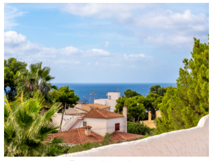
Terrace with sea views