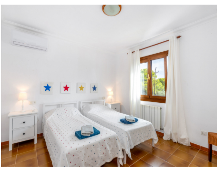
One of 3 bedrooms