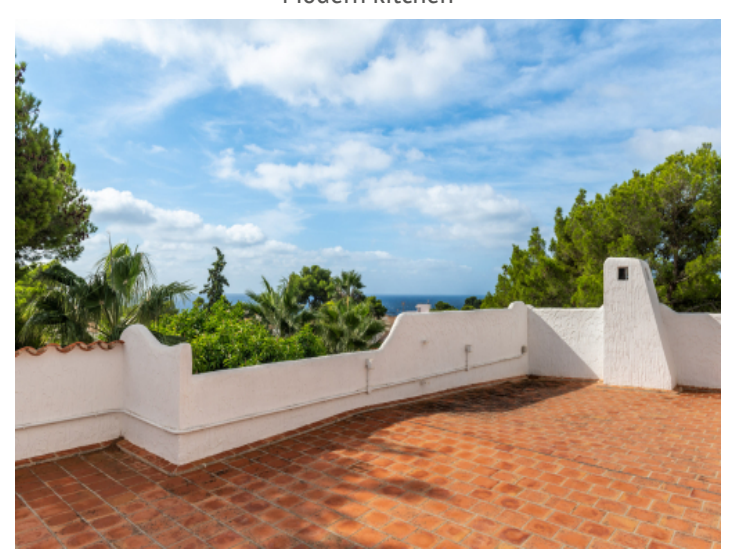
Large roof terrace