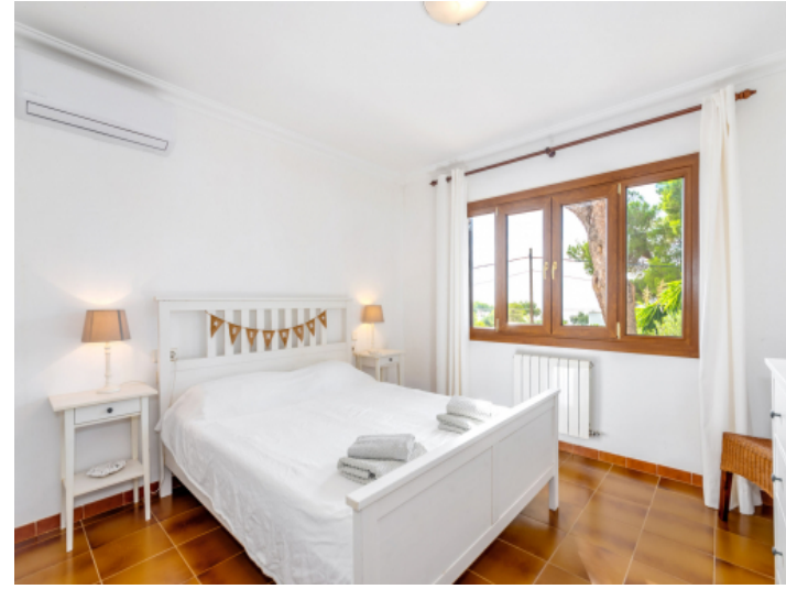
One of 3 bedrooms