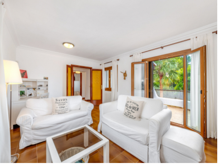
Living area with terrace access