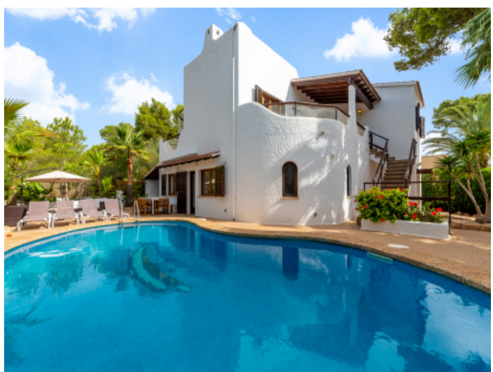
Large pool area