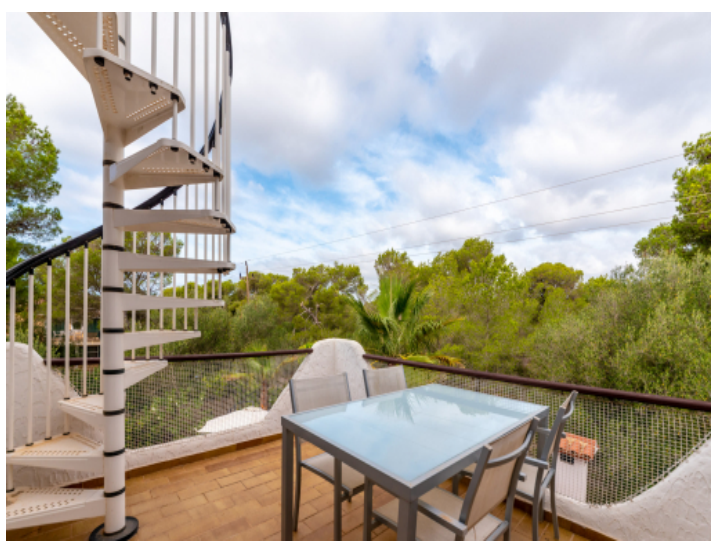
Terrace of the kitchen