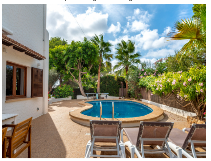
Pool with palm-tree garden