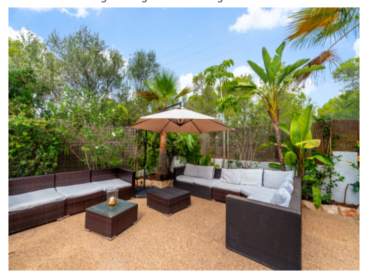
Lovely chill-out area