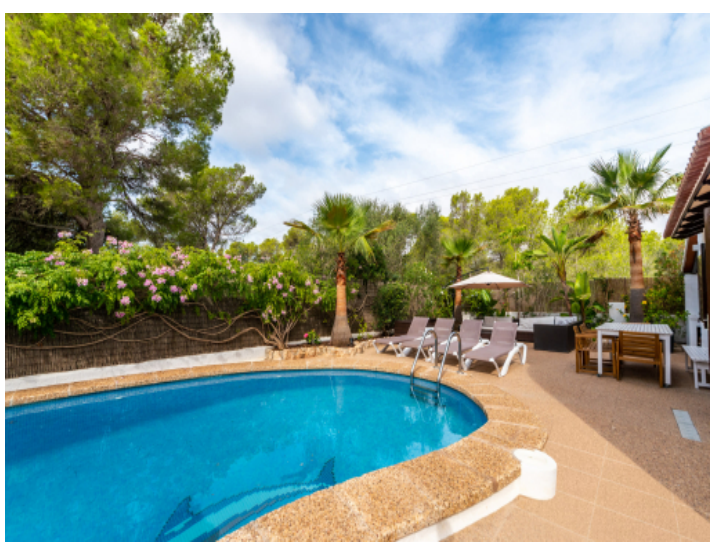
Pool area with privacy