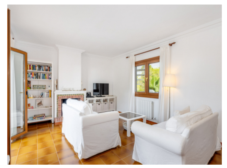
Cosy living area on the upper floor