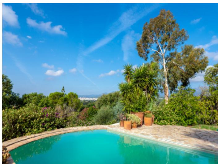
Pool oasis in a lush garden