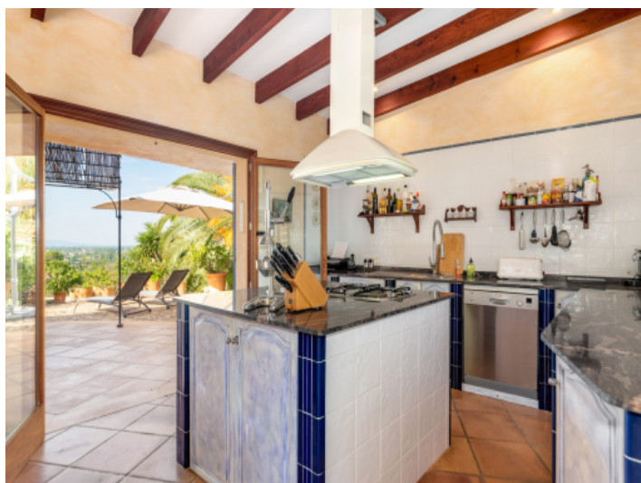
Kitchen with terrace access