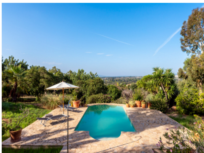
Beautifgful pool area