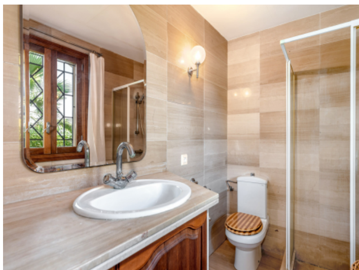
One of in total 3 bathrooms