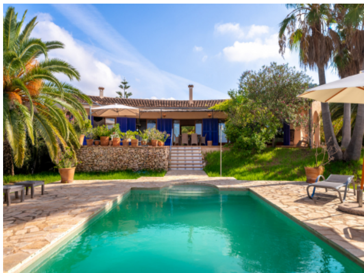
Pool and view to the finca