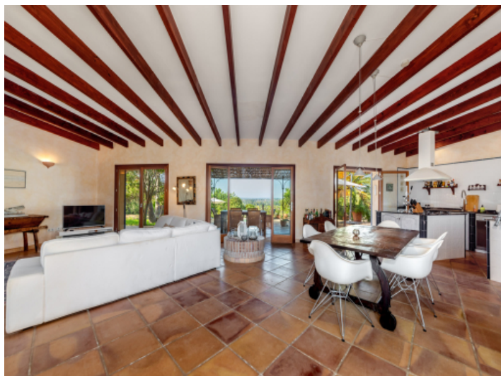
Generous living and dining area