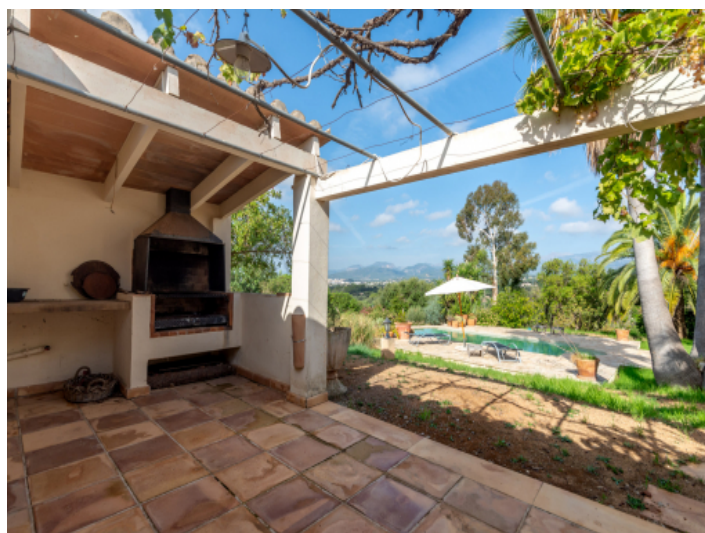
Bbq terrace next to the pool