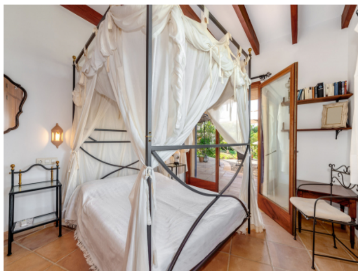
Bedroom with terrace access