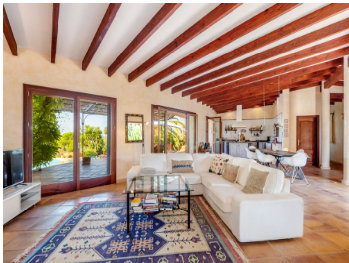
Open living area with wooden ceiling beams