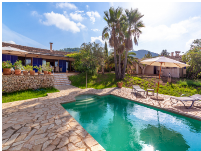
View of the finca, guest house and pool