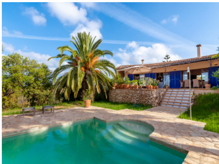
Pool area and finca