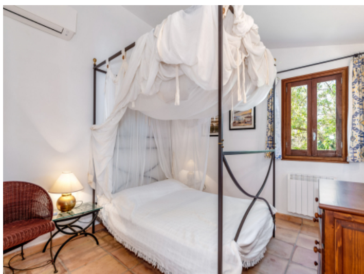
One of in total 4 bedrooms