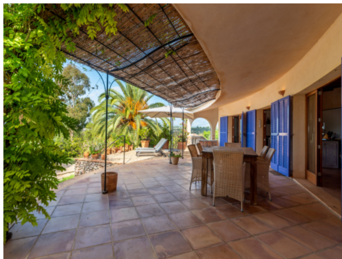
Large covered terrace