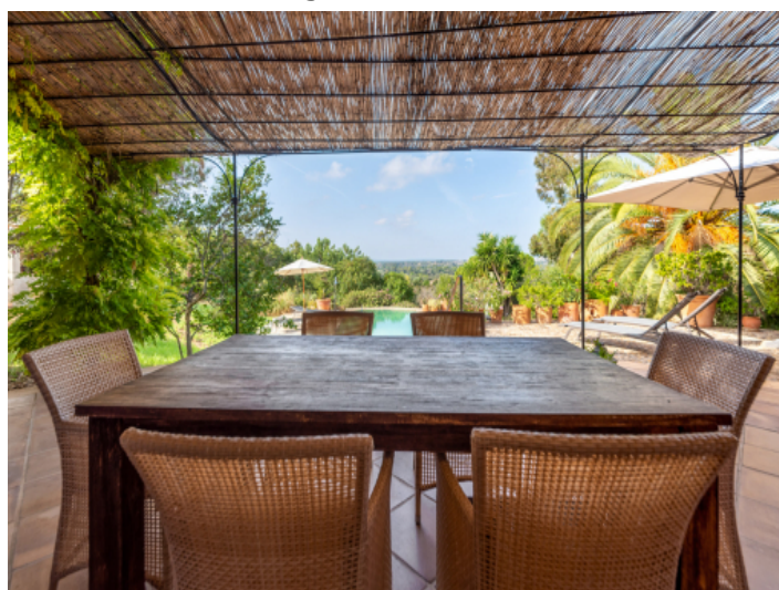
Outdoor dining area with sweeping views