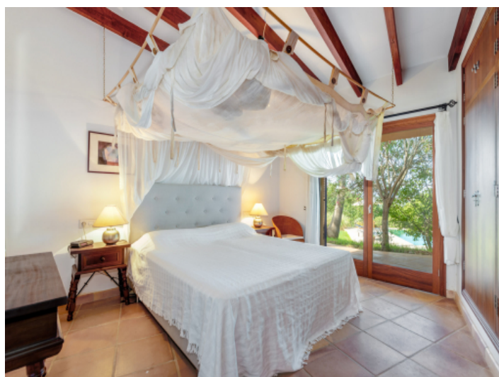
Bedroom in the guesthouse