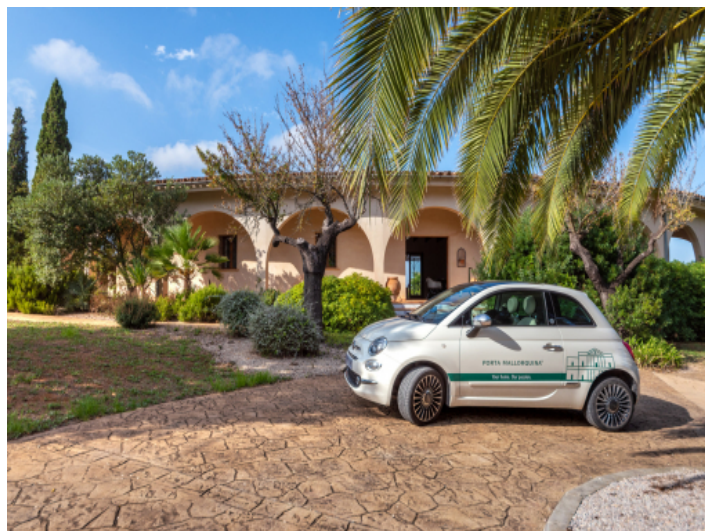
Front view and driveway