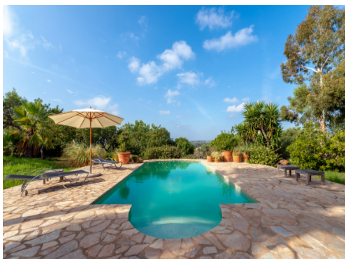
Beautiful pool wie sweeping views