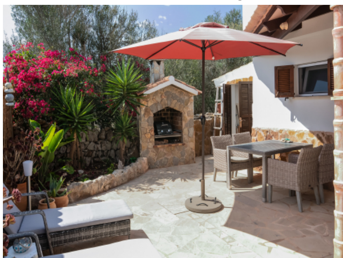
Outdoor dining area with barbecue