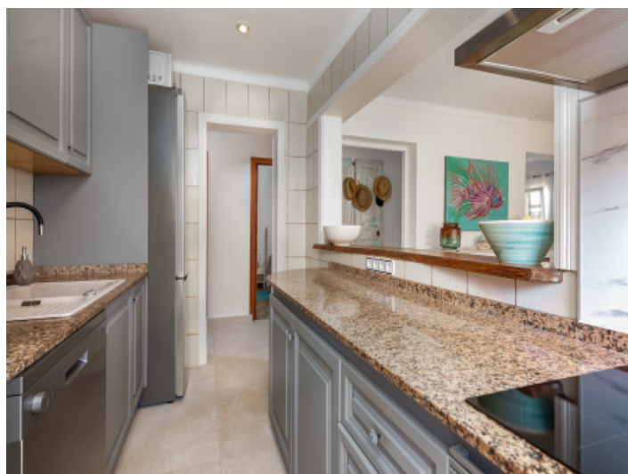
Fully equipped kitchen