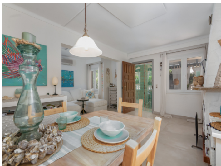
Dining area with fireplace