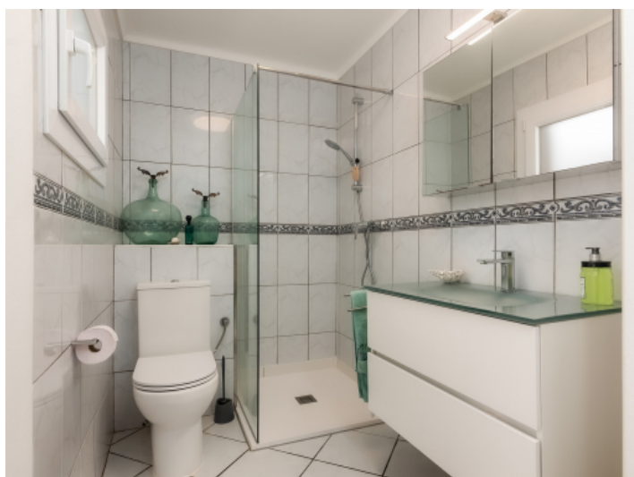
One of 2 bathrooms