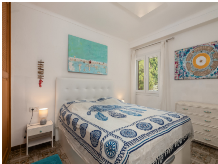
One of 2 bedrooms