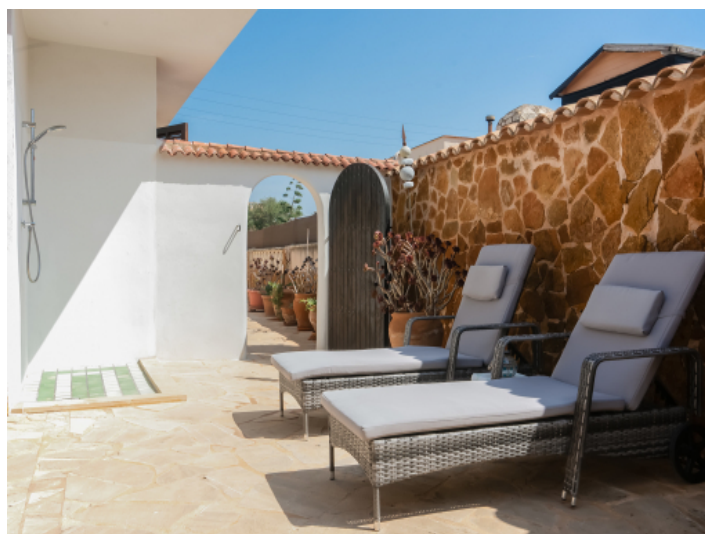
Sunny terrace with exterior shower