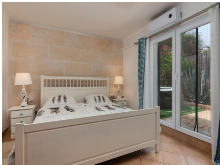
One of 2 bedrooms