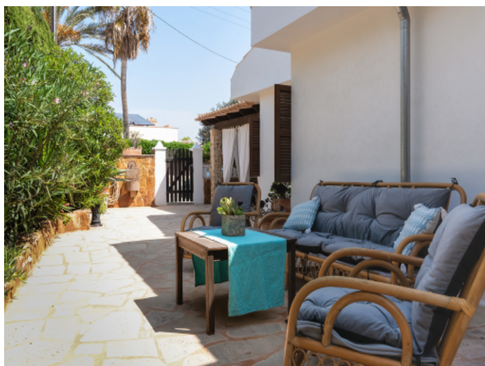
Terrace with outdoor lounge