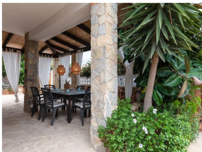
Covered terrace with dining table