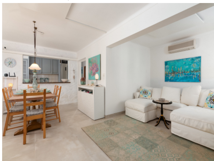
Open living and dining area