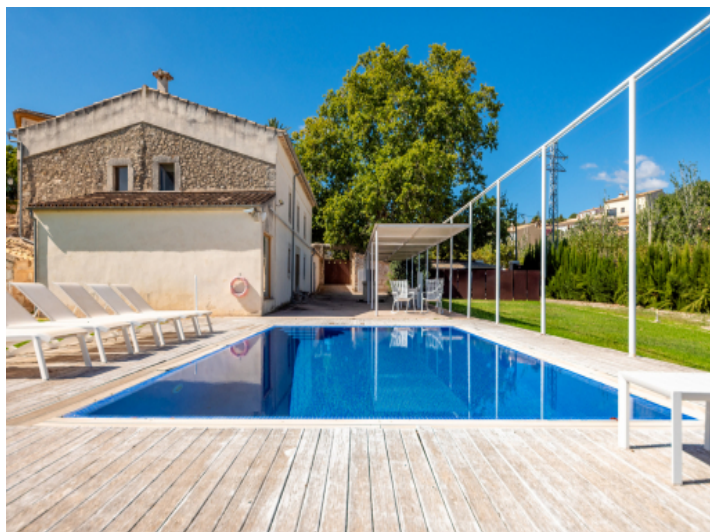
Pool is surrounded by a terrace