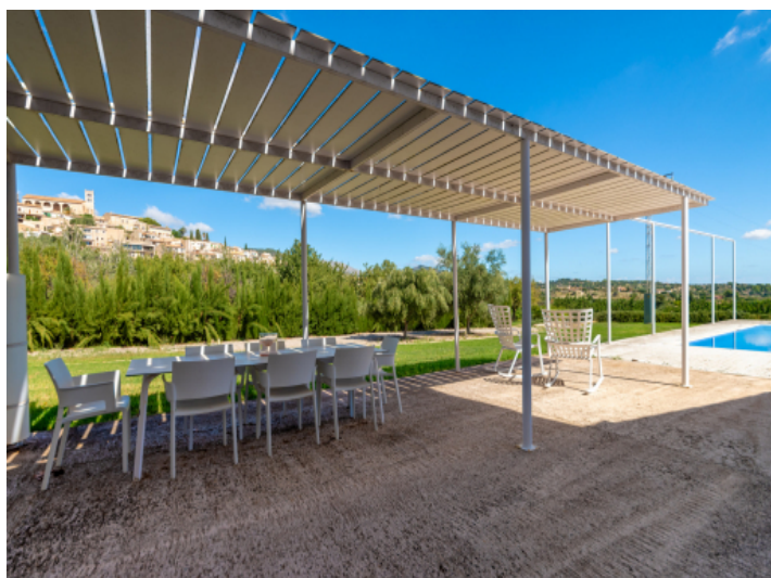
The spacious terrace invites for big events