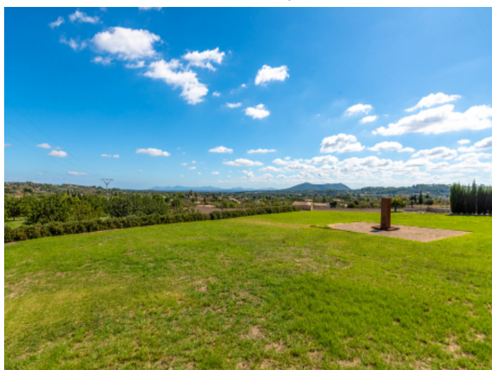
Garden with panorama views