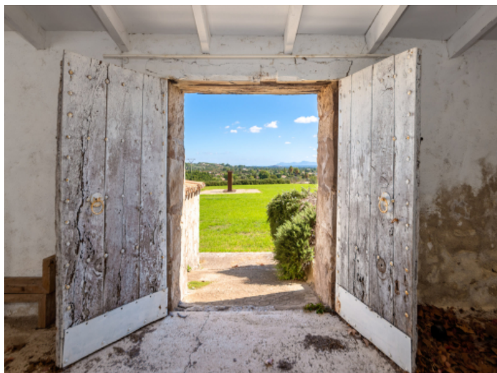
Views from the house to the garden