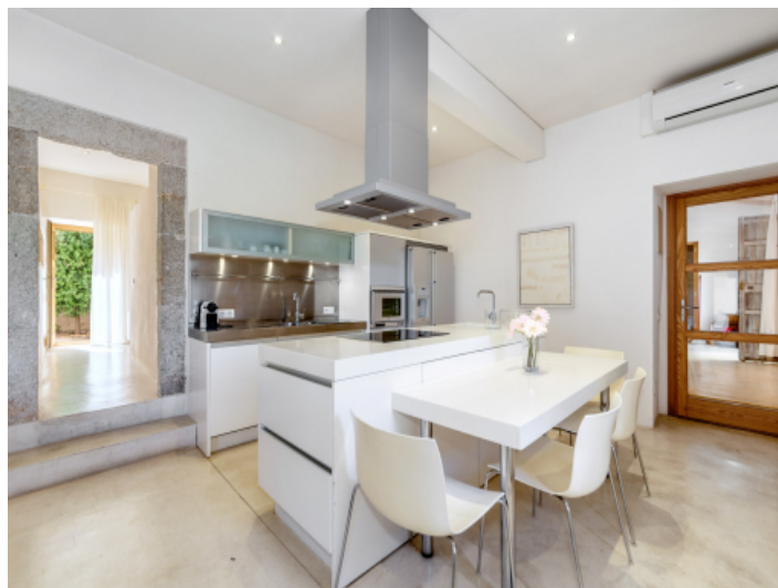
Kitchen with cook island