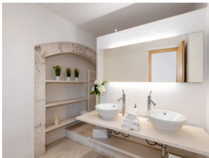
Bathroom with two washbasins