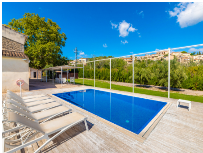
Pool with mountain views