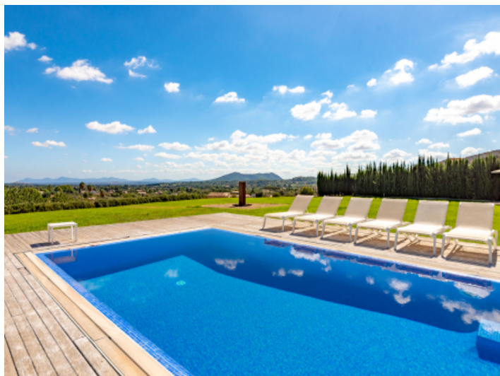
Dreamlike pool area