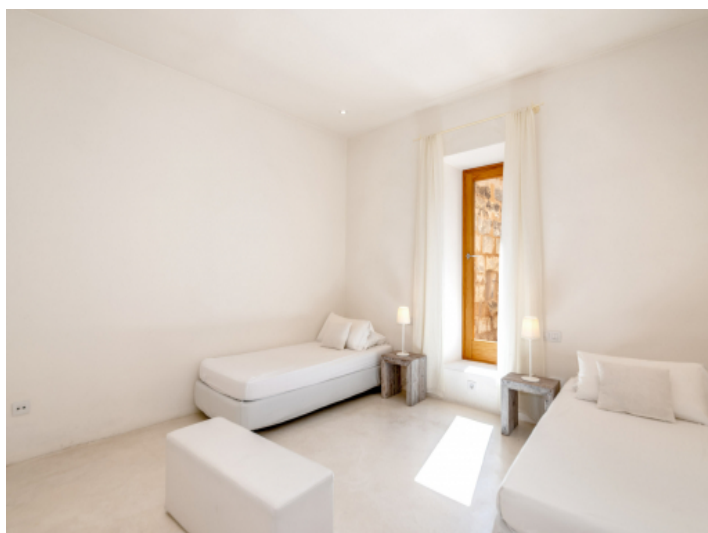
Bedroom with two single beds