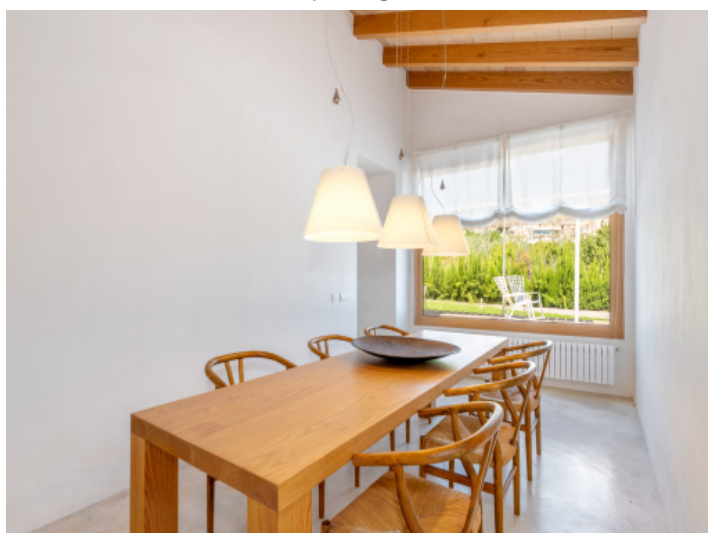
Dining area with garden views