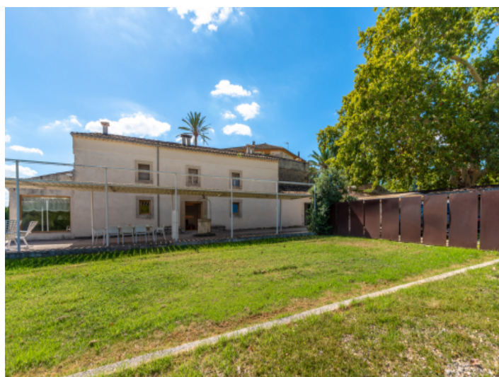
Views from the garden to the finca