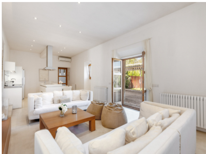
Cosy living area