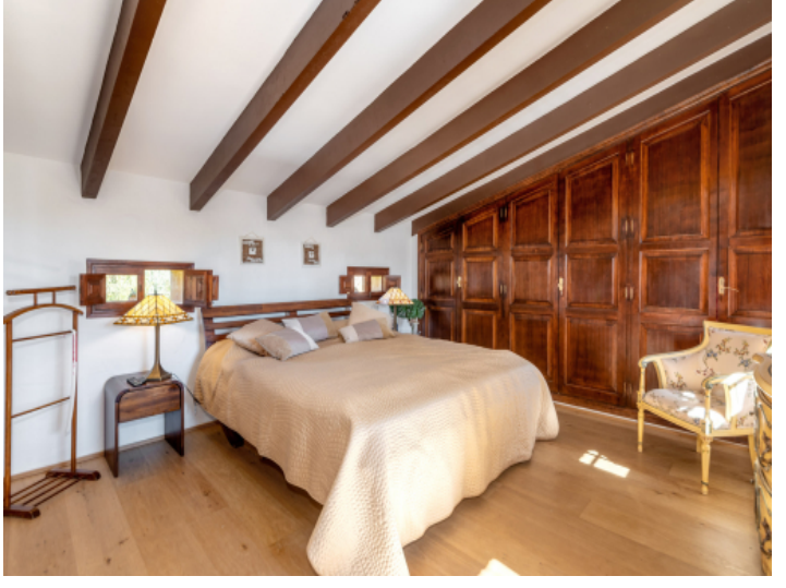
Bedroom with built-in wardrobe