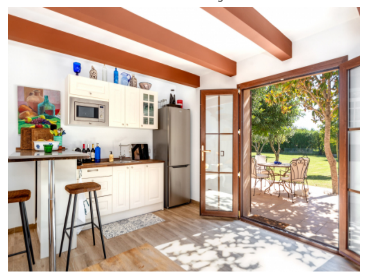
Kitchen with bar