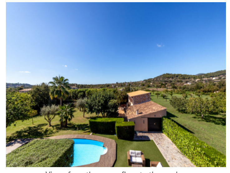
Views from the upper floor to the garden