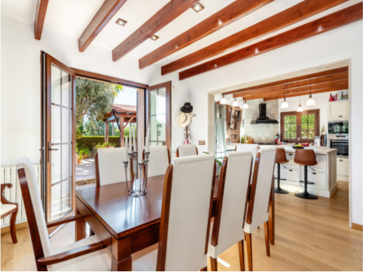
Light flooded dining area