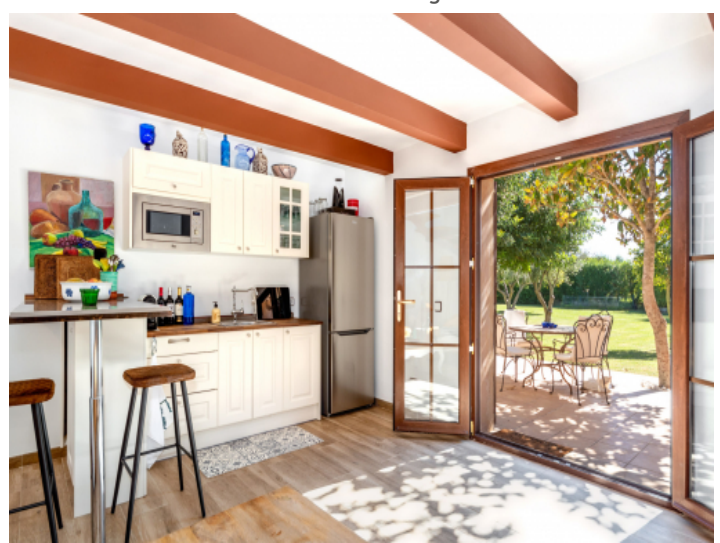
Kitchen with bar