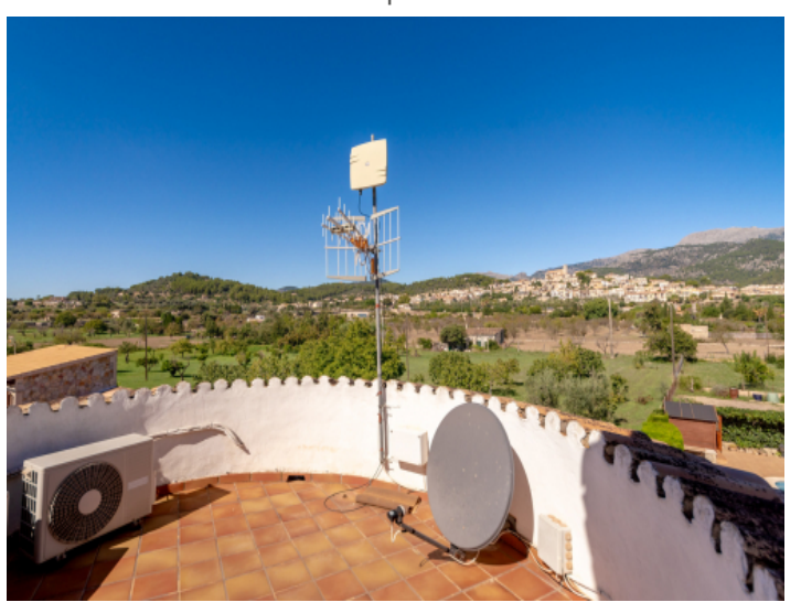
Roof terrace with landscape views