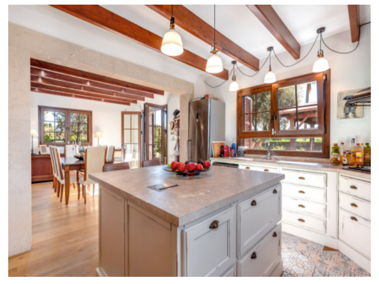
Kitchen with cooking island