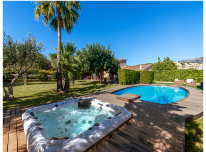
Garden with pool and jacuzzi