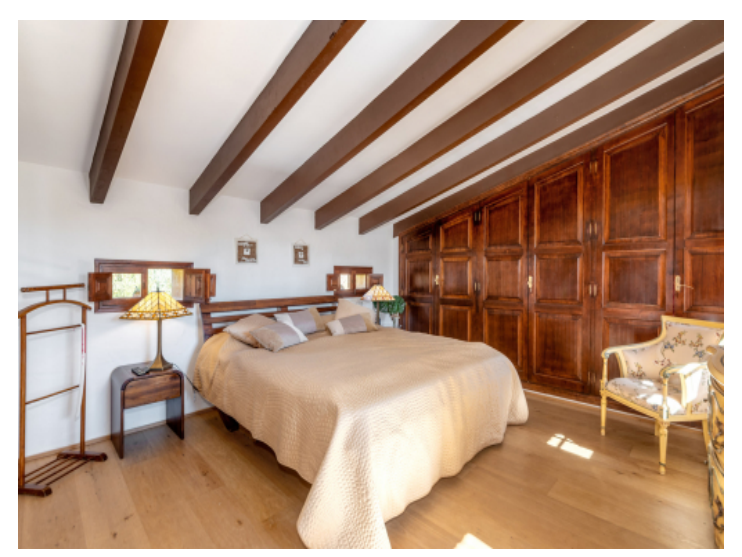
Bedroom with built-in wardrobe