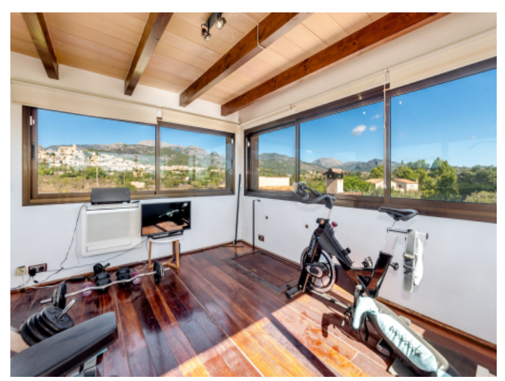
Gym with unique landscape views