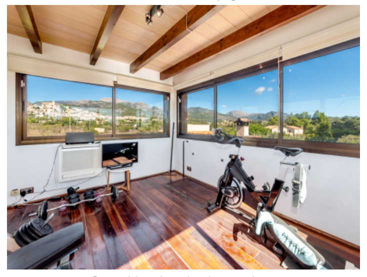
Gym with unique landscape views