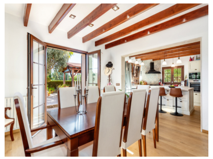
Light flooded dining area