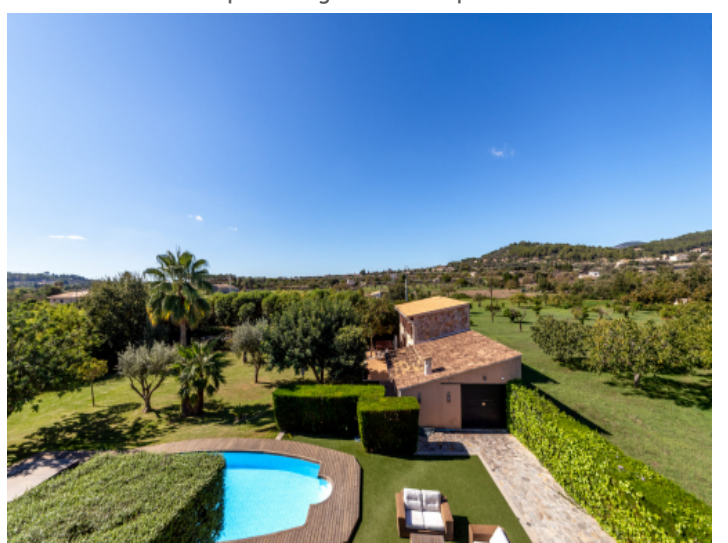
Views from the upper floor to the garden