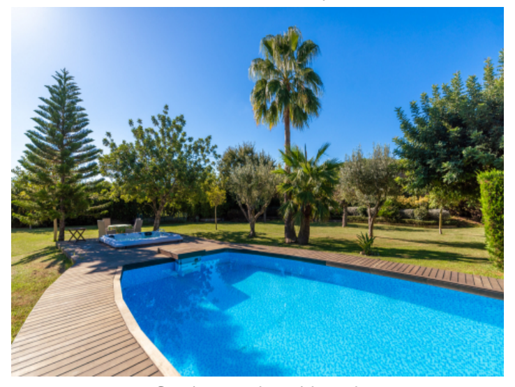
Spacious garden with pool