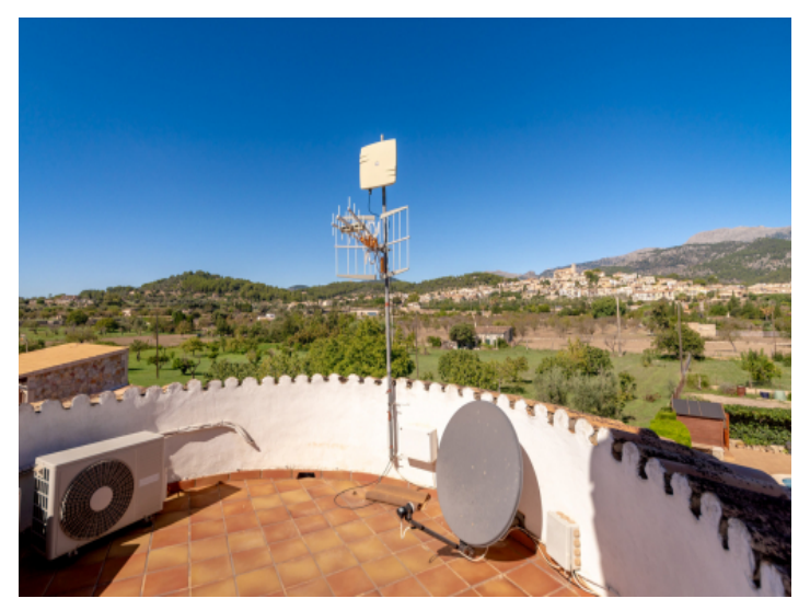
Roof terrace with landscape views