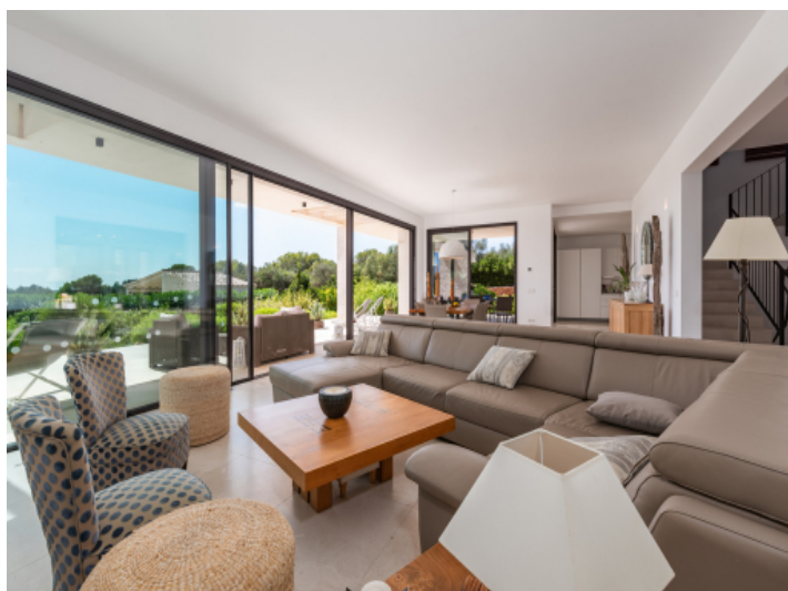
Modern living area