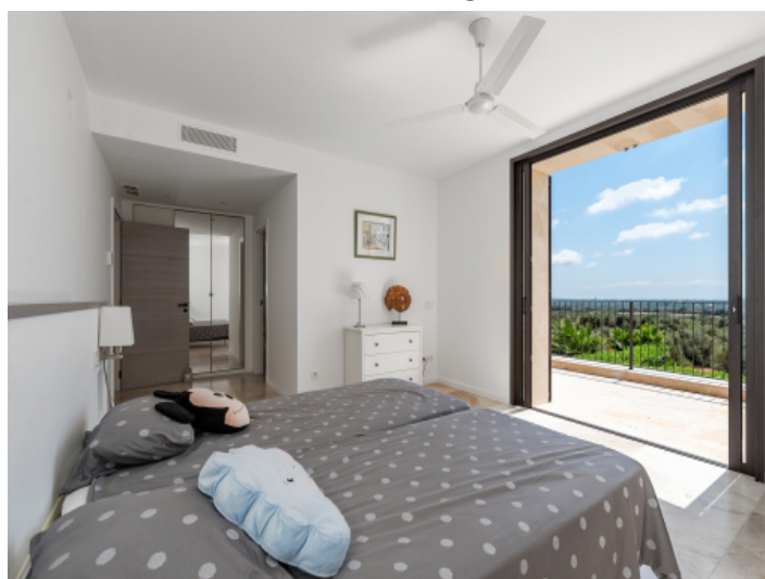
Bedroom with fan