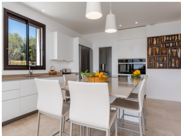
Kitchen with dining area