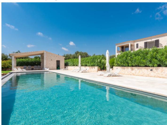
Gorgeous pool area