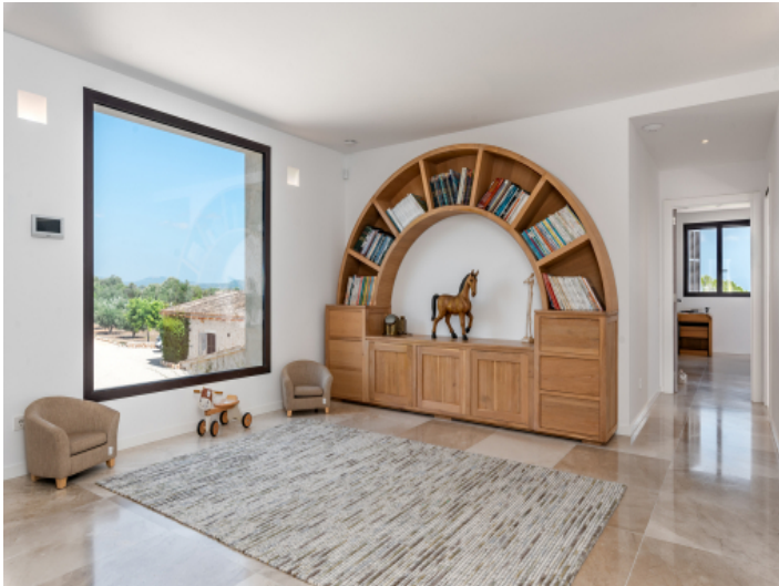
Library with garden views