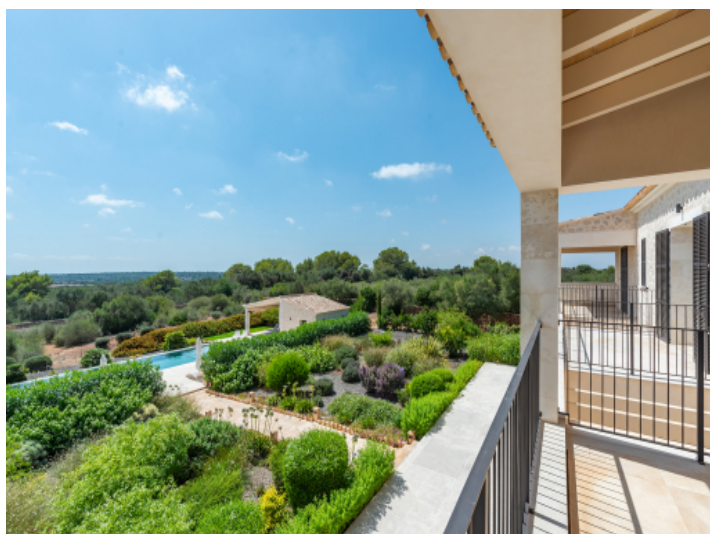
Unique garden views from the balcony