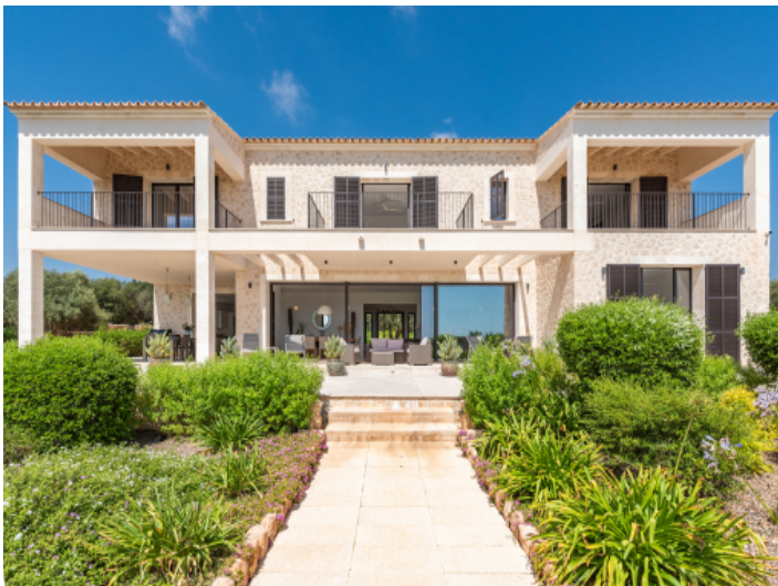
Views from the garden to the finca