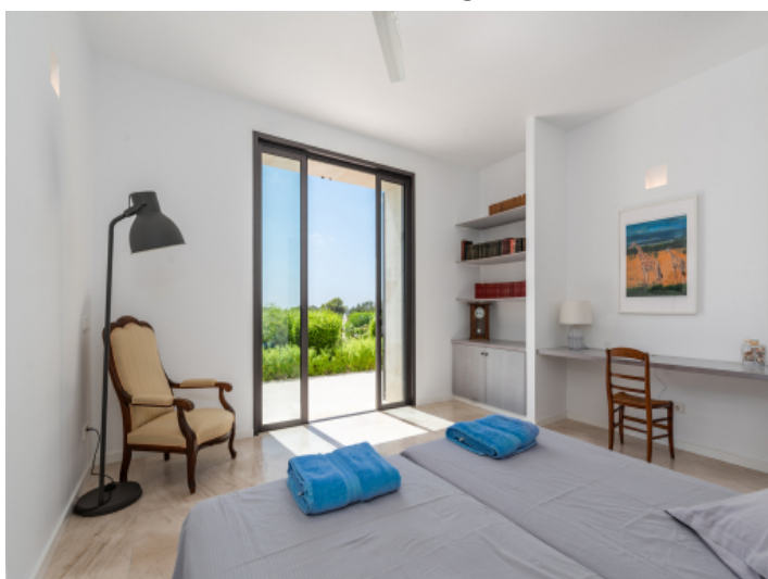
Bedroom with balcony access