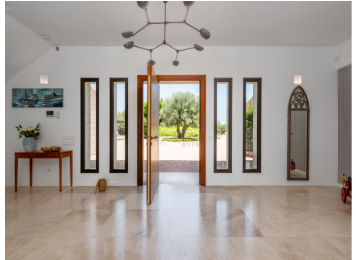
Entrance to the finca