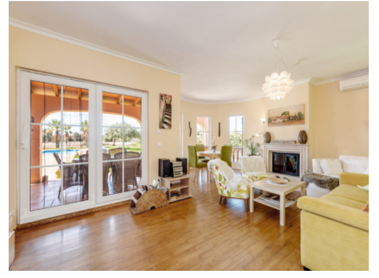
Living area with fireplace