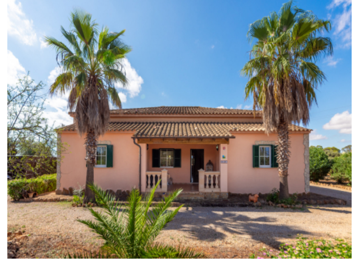
Mediterranean style finca

PORTA MALLORQUINA • C./ COLOM 20 2°, 07001 PALMA, SPAIN TEL.: +34 971 698 242 • INFO@PORTAMALLORQUINA.COM • WWW.PORTAMALLORQUINA.COM