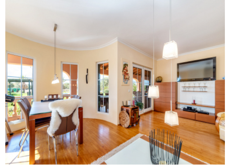
Bright dining area