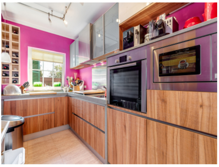
Fully equipped kitchen