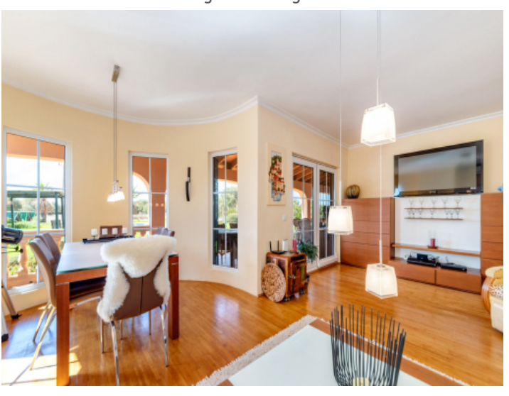
Bright dining area