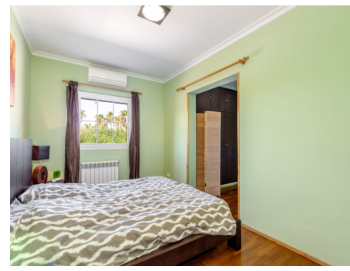
One of 2 bedrooms