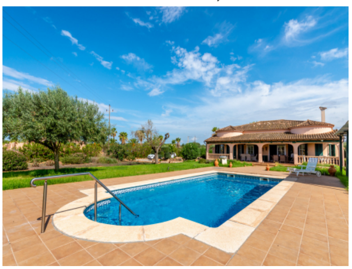
Country house with pool