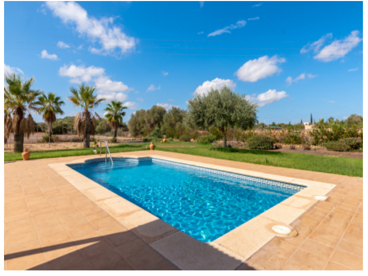
Pool area surrounded by nature