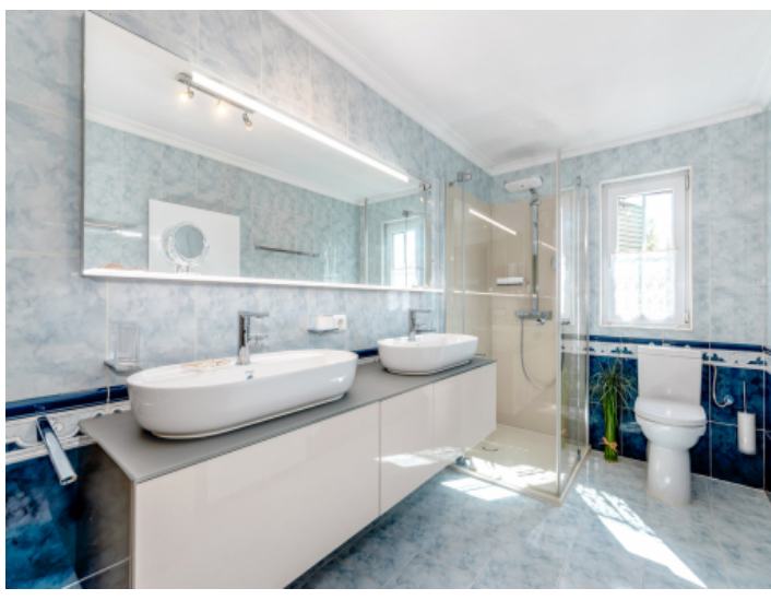
One of 2 bathrooms