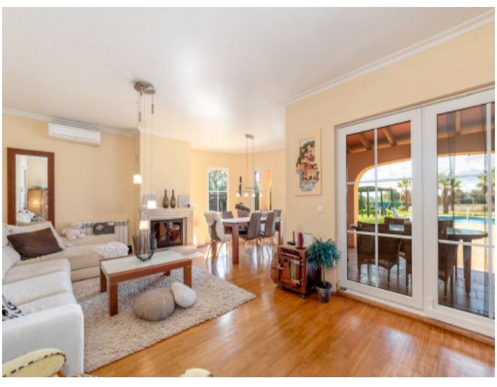
Living and dining area

PORTA MALLORQUINA • C./ COLOM 20 2°, 07001 PALMA, SPAIN TEL.: +34 971 698 242 • INFO@PORTAMALLORQUINA.COM • WWW.PORTAMALLORQUINA.COM