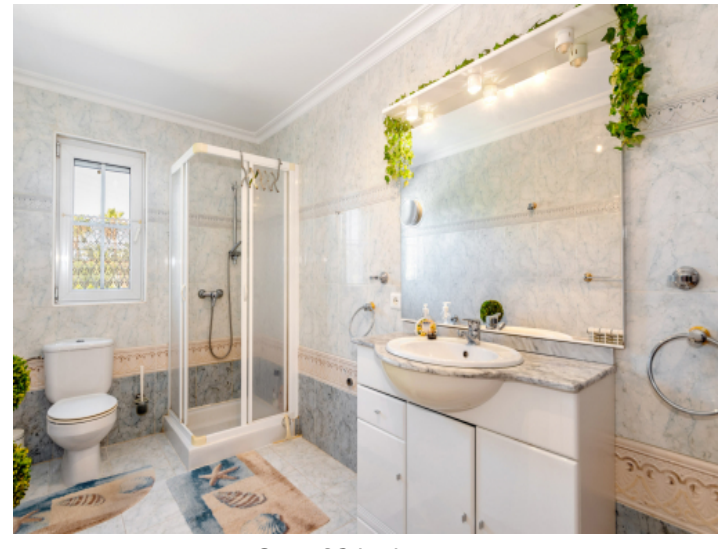
One of 2 bathrooms