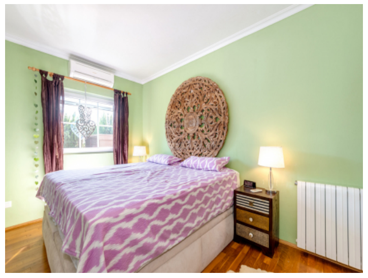
One of 2 bedrooms