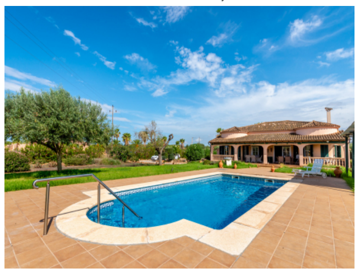
Country house with pool