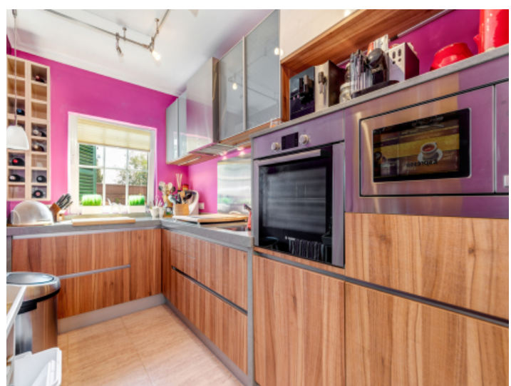
Fully equipped kitchen