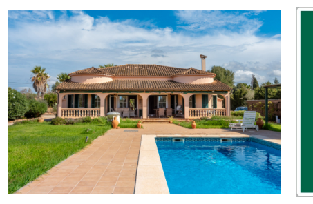
Llucmajor search for property MAL-120697