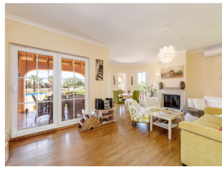
Living area with fireplace