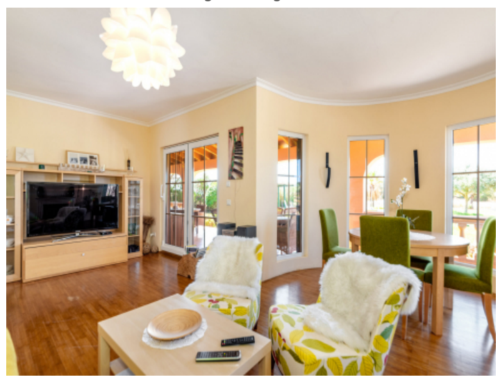
Additional living and dining area