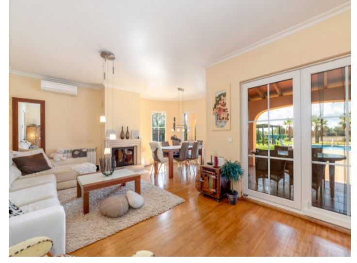
Living and dining area