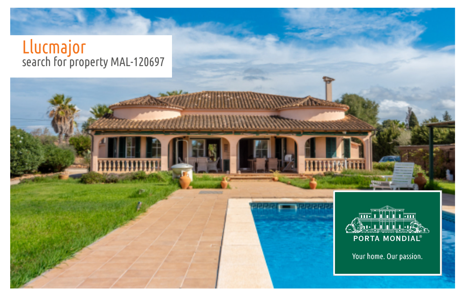
Outstanding finca in Llucmajor, ideal for 2 families