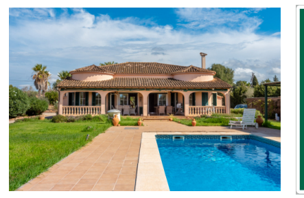
Llucmajor search for property MAL-120697