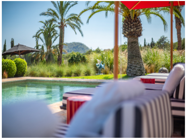
Idyllic pool area