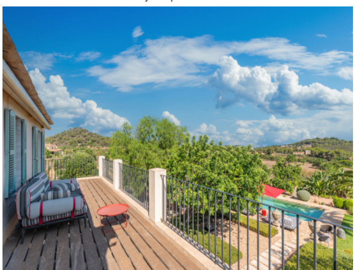
Balcony with pool views