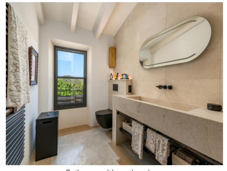
Bathroom with garden views