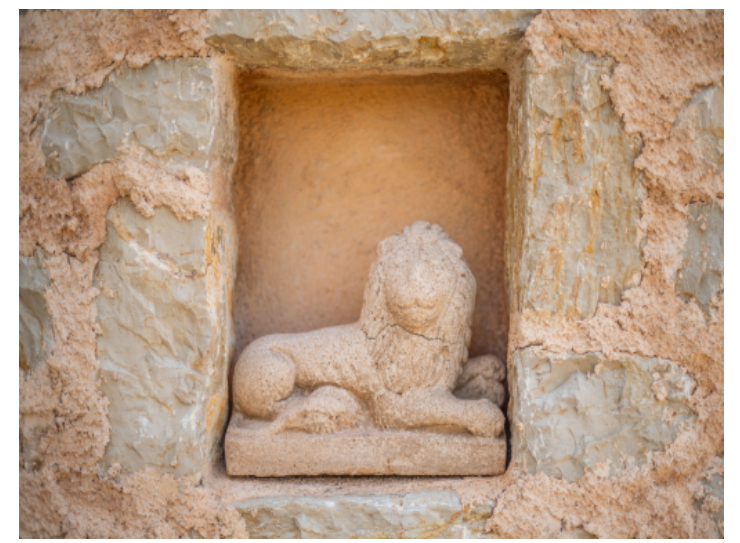
Garden Wall with details