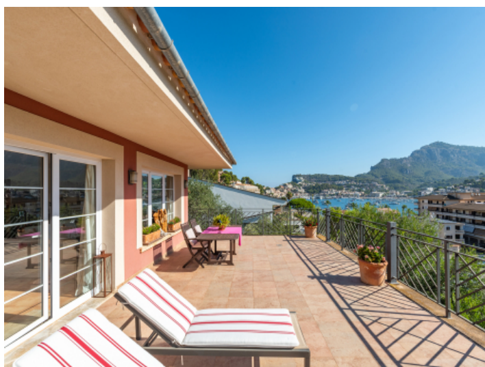
Sunny terrace with panoramic views