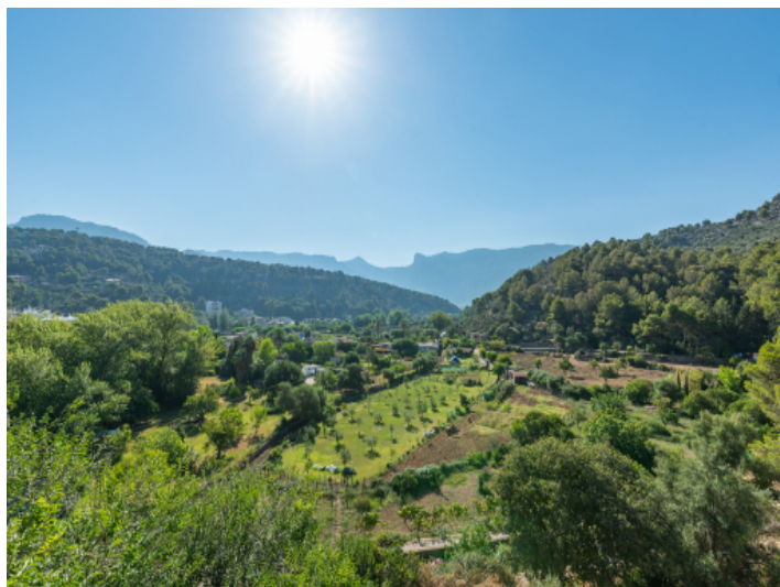
Lovely mountain views