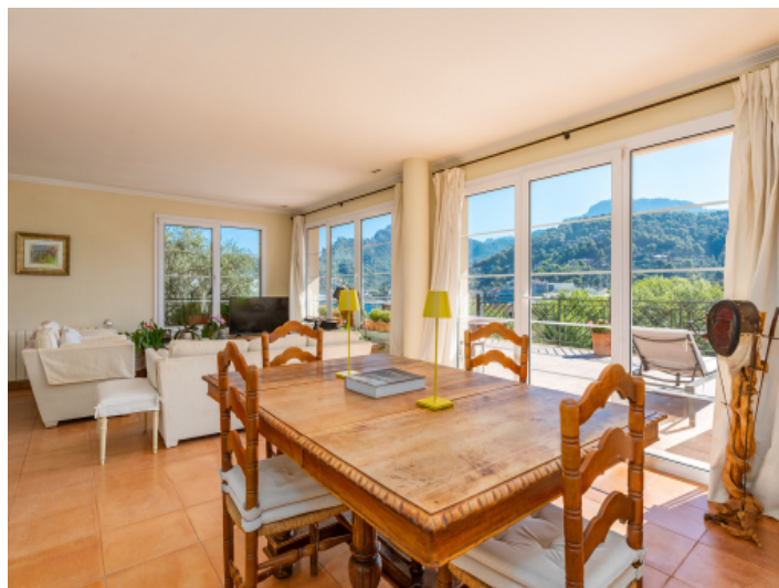
Living and dining area with magnificent views