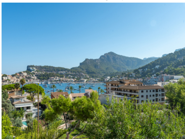
Great sea views