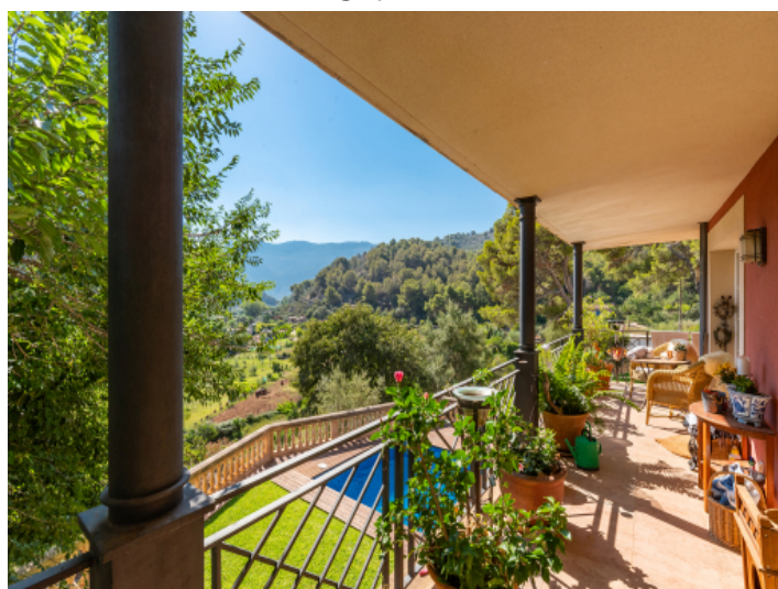
Covered terrace with mountain views