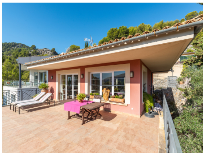
Terrace with outdoor furniture