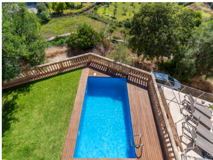
Large private pool