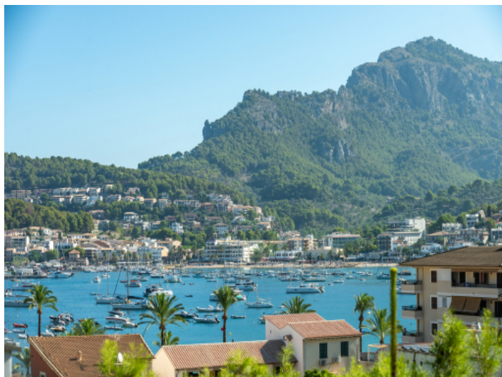
Fantastic sea views