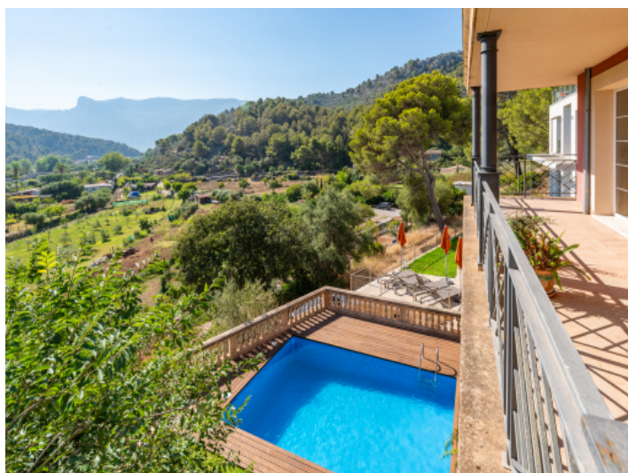
Terrace overlooking the pool