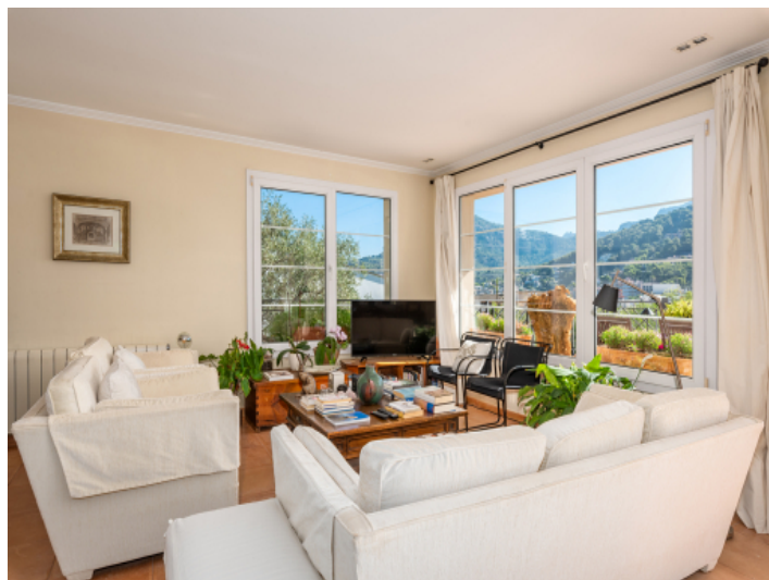
Comfortable living area