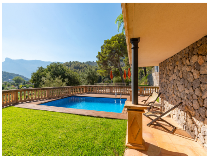
Beautiful pool area with lawn