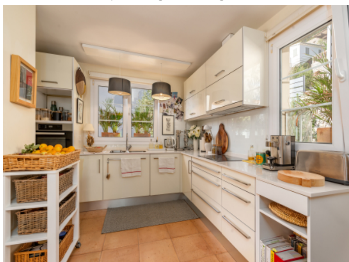
Modern, fully equipped kitchen