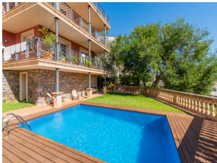
Large pool area