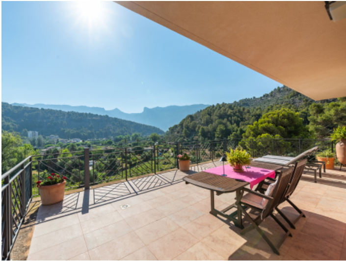
Large sunny terrace