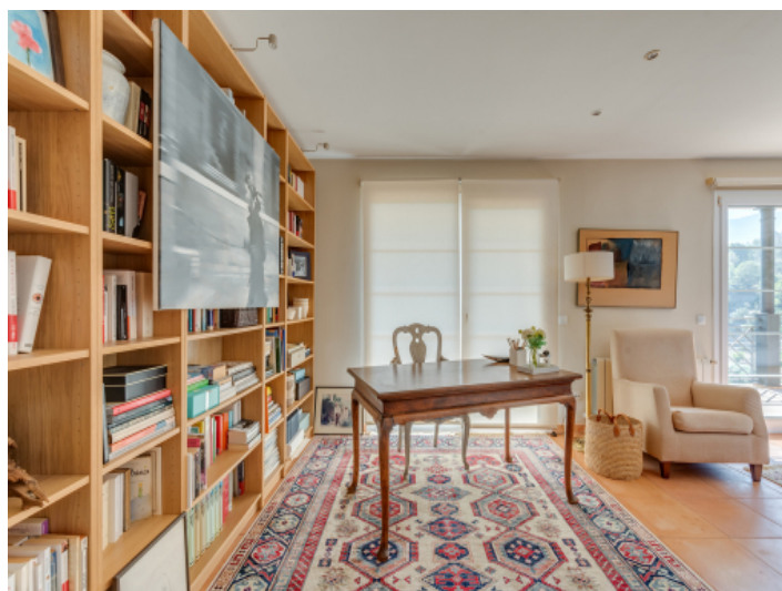
Study in master bedroom