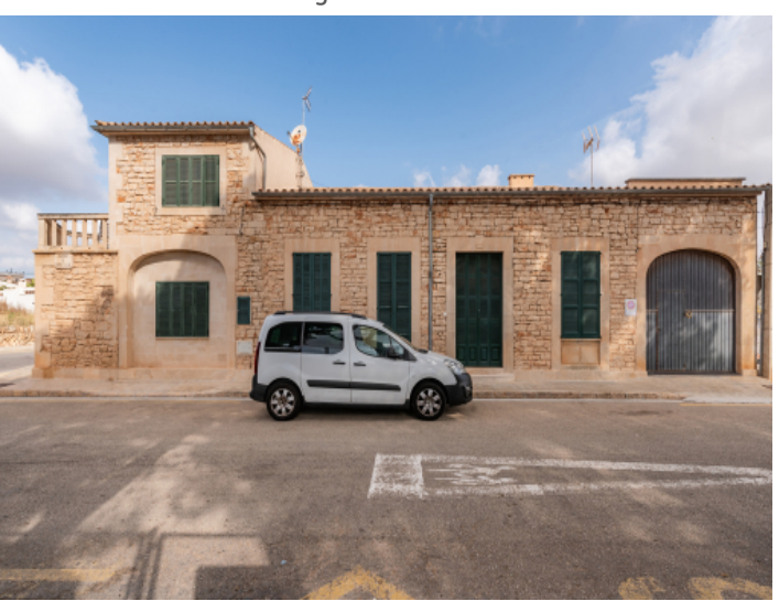
Exterior view of the townhouse