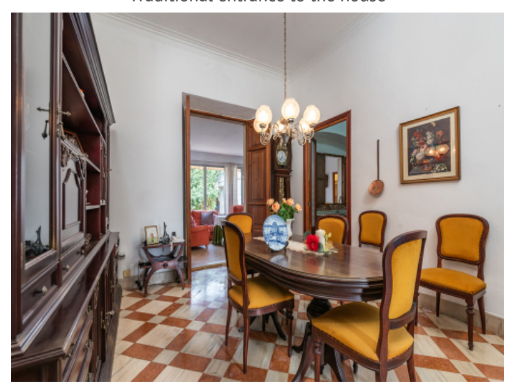
Access to the dining area