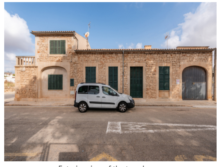
Exterior view of the townhouse