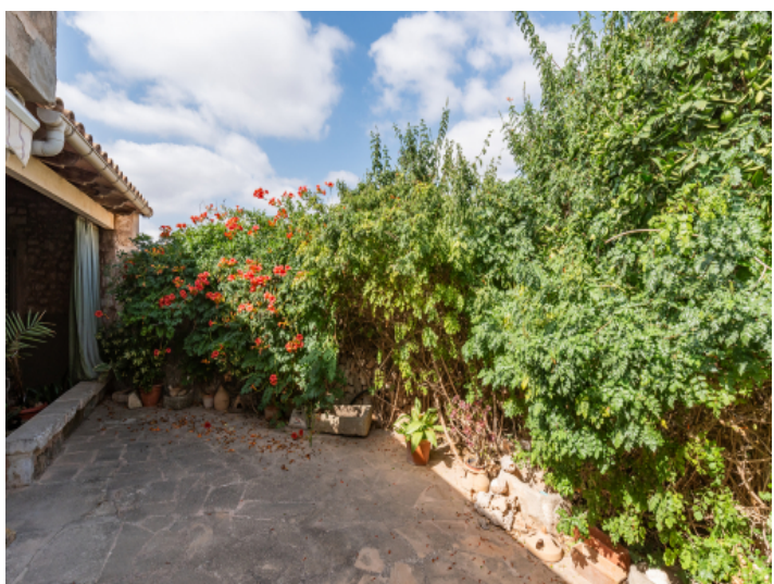
Adjoining outdoor terrace