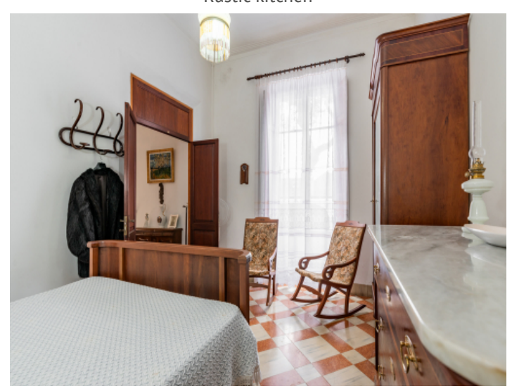
Bedroom on the ground floor