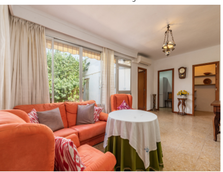
Bright living area with patio access