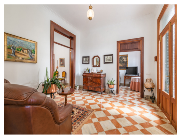
Traditional entrance to the house