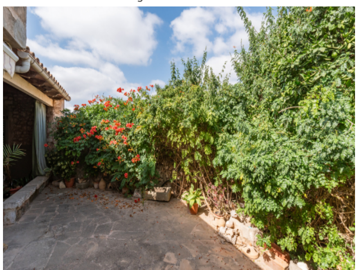
Adjoining outdoor terrace