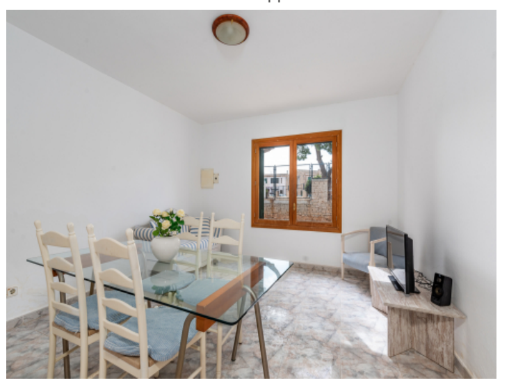
Living area on the upper floor