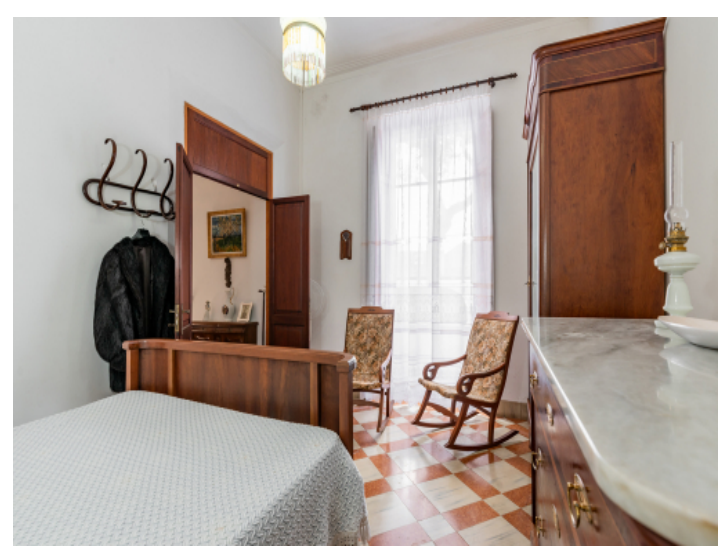
Bedroom on the ground floor