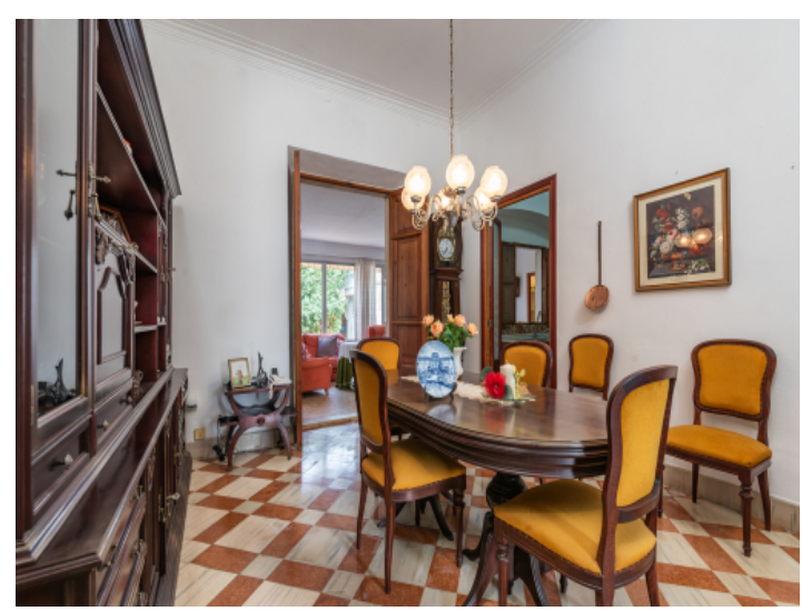
Access to the dining area