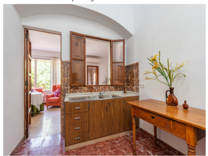
Access to a small kitchen