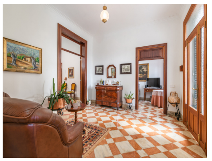
Traditional entrance to the house