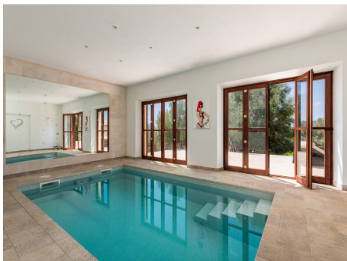
Luxurious indoor pool