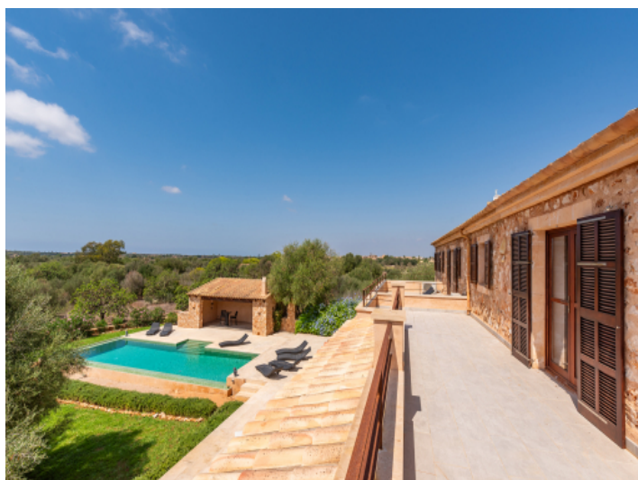
Terrace with sweeping views