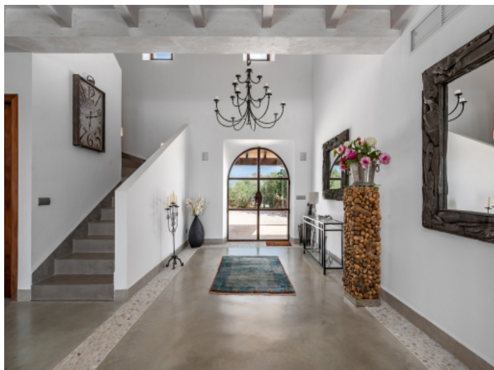
Elegant entrance area