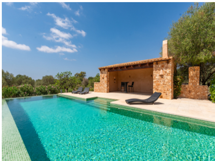
Practical pool house