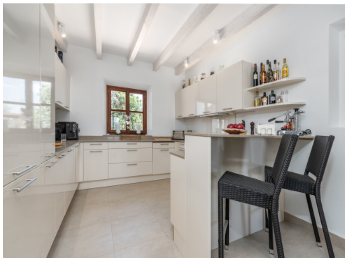
Fully equipped modern kitchen