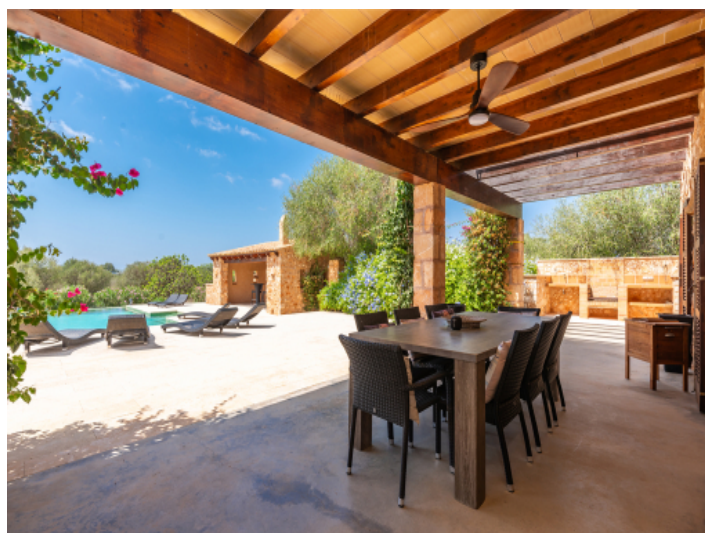
Covered outdoor dining area