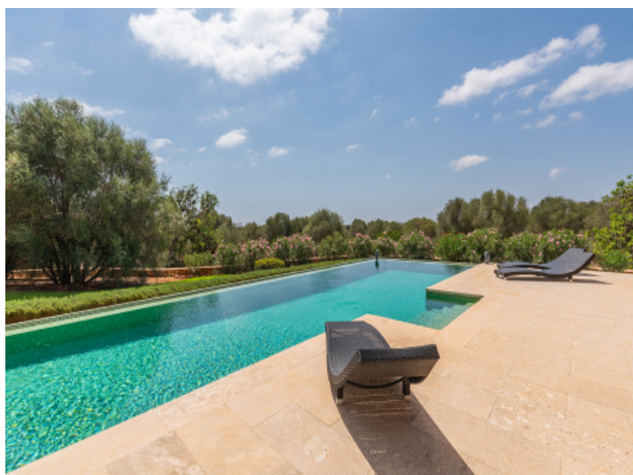
Large pool surrounded by nature