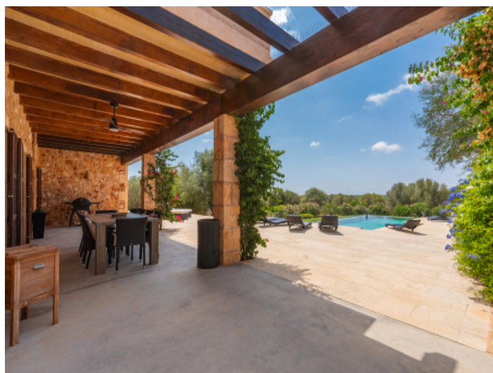
Spacious covered terrace