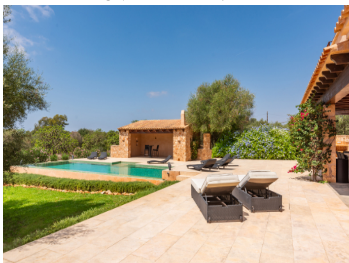
Splendid pool area