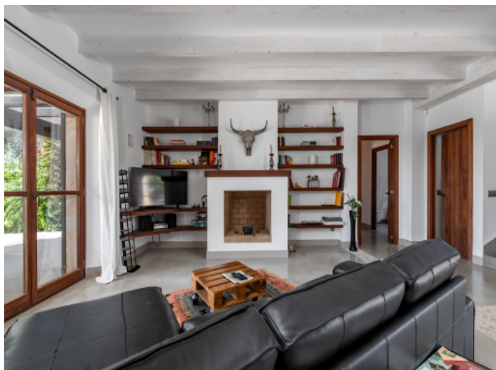
Living area with access to a terrace