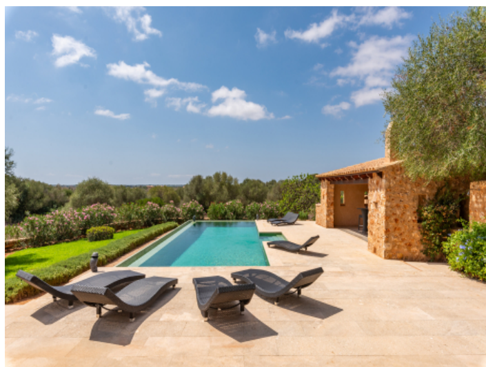
Inviting pool area