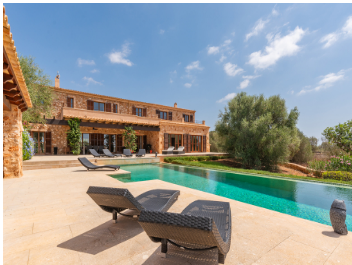
Exterior view and pool