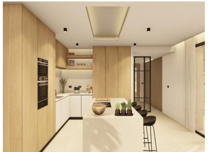
Modern kitchen with cooking island