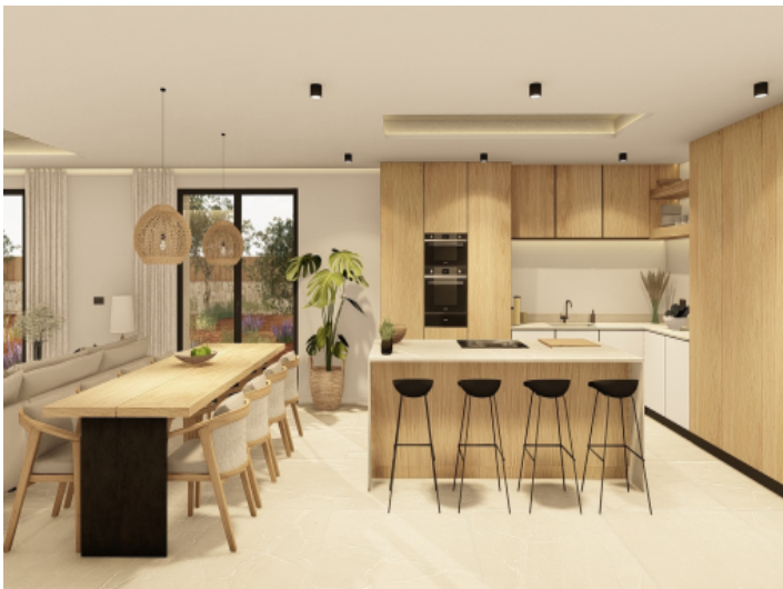
Modern kitchen with cooking island