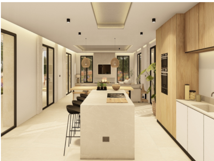
Alternative view of the kitchen