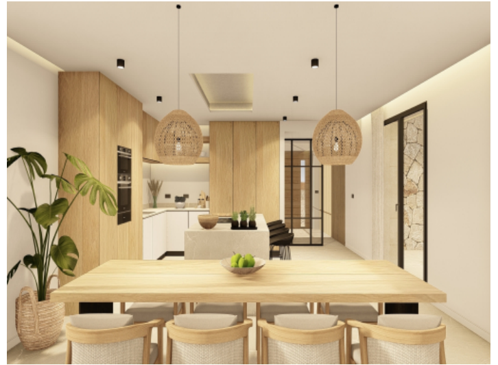
Dining area and kitchen