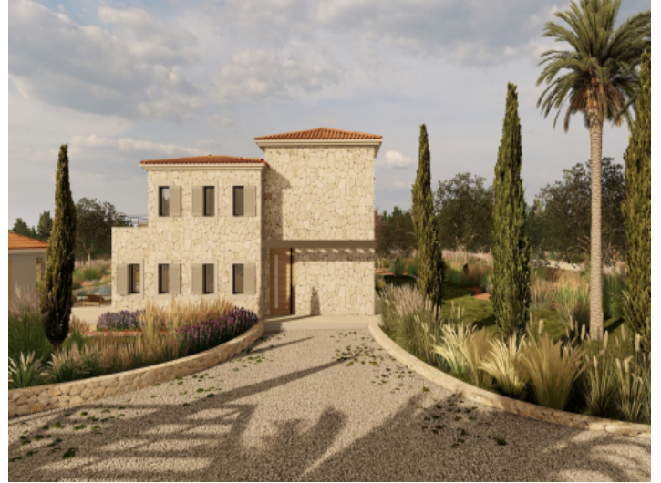
Drive way to the finca