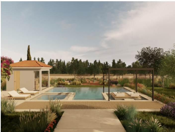
Inviting pool area