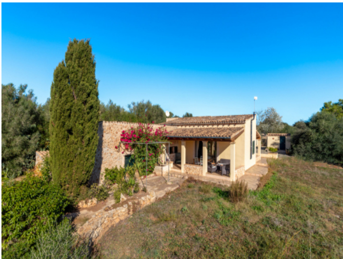
Views from the garden to the finca