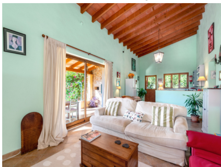
Cosy living area