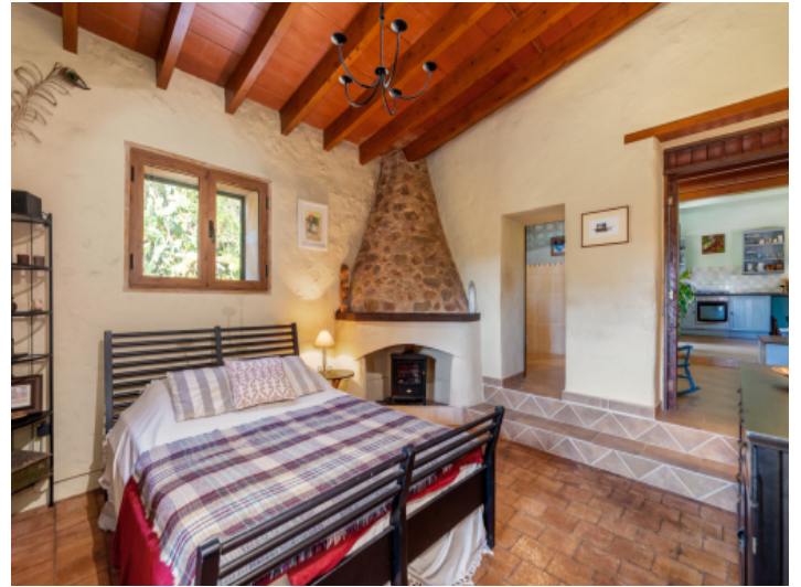
Bedroom with fireplace