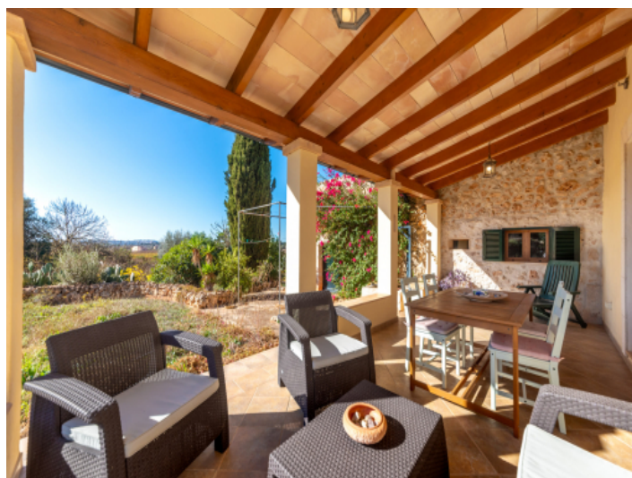
Covered terrace with lounge area