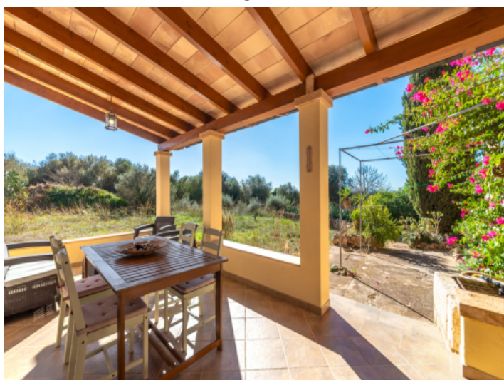
Views to the garden from the covered terrace