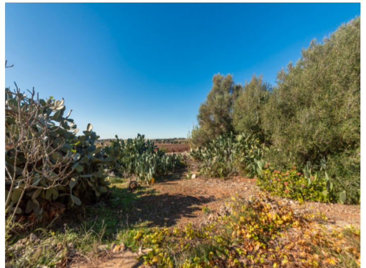
Finca in Santa Margalida