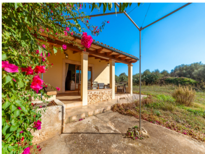
Views from the garden to the finca