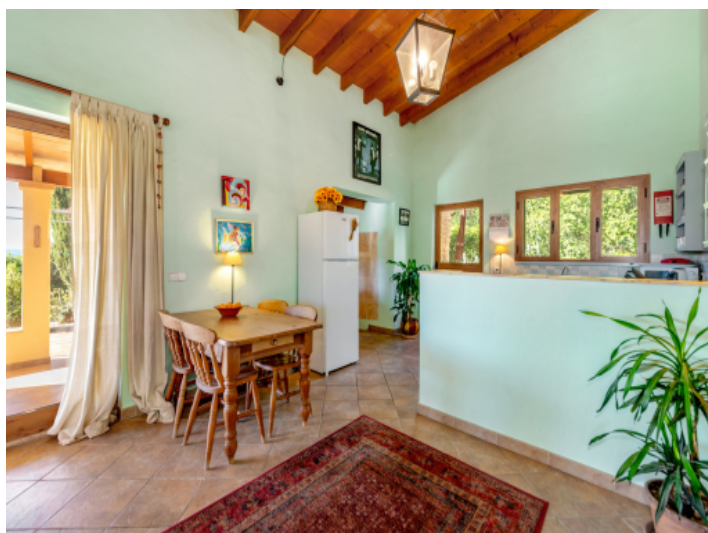
Open kitchen and dining area