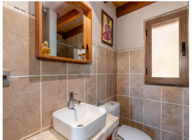
Bathroom with daylight