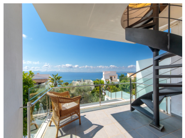
Superb sea views