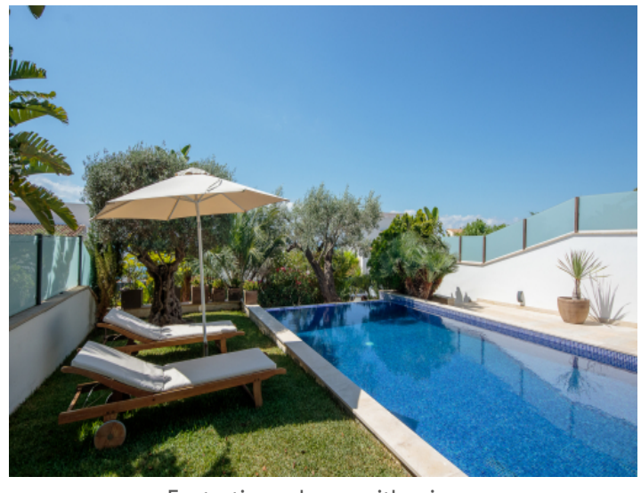
Fantastic pool area with privacy