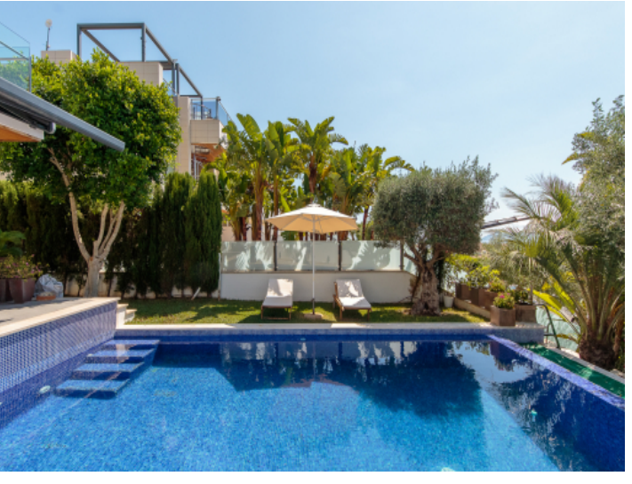
Large swimming pool