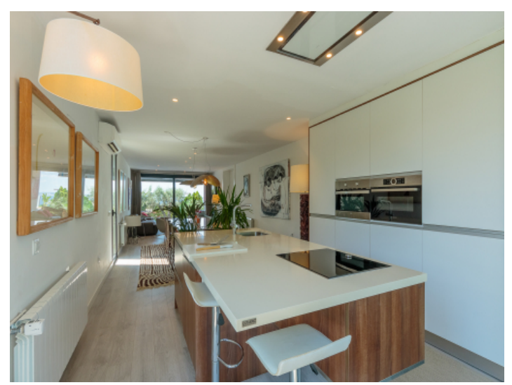
Modern, fully equipped kitchen