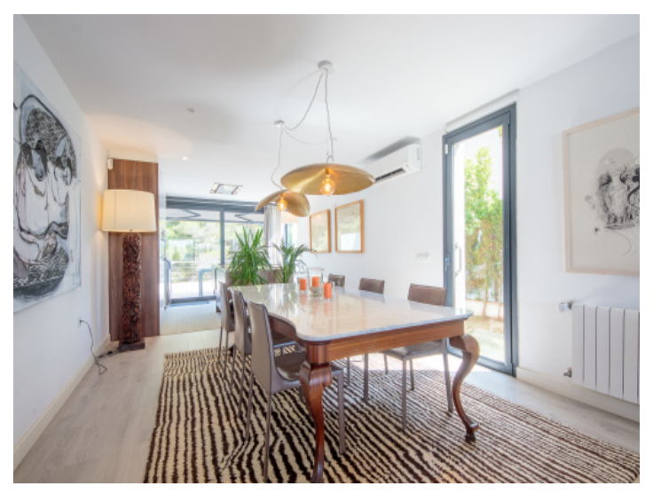
Luxurious dining area