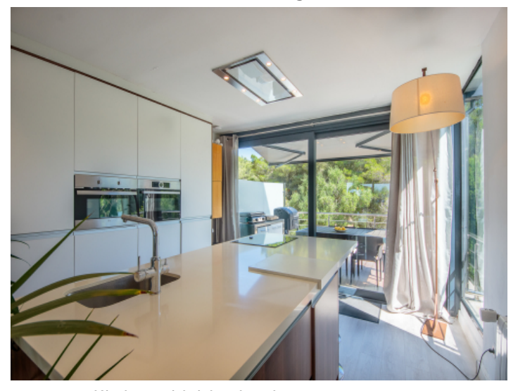
Kitchen with island and access to a terrace