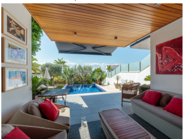
Covered terrace overlooking the pool