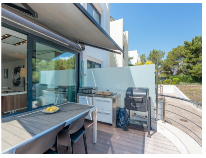
Terrace with barbecue area and awning