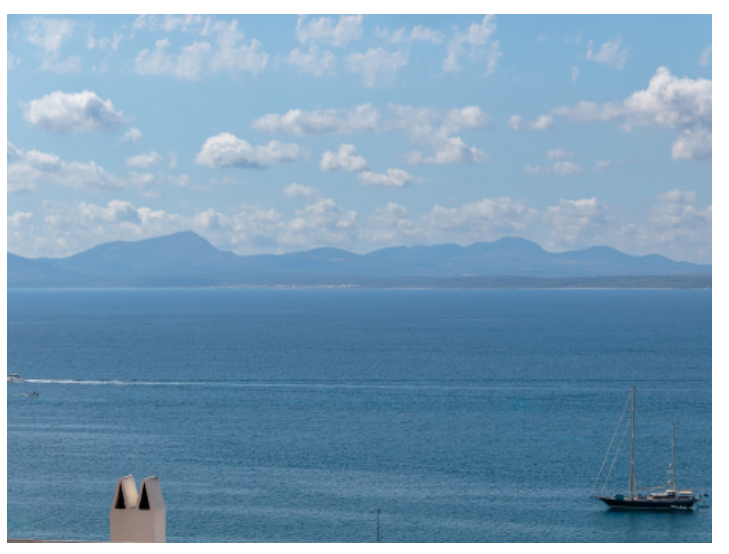
Breathtaking sea and mountain views