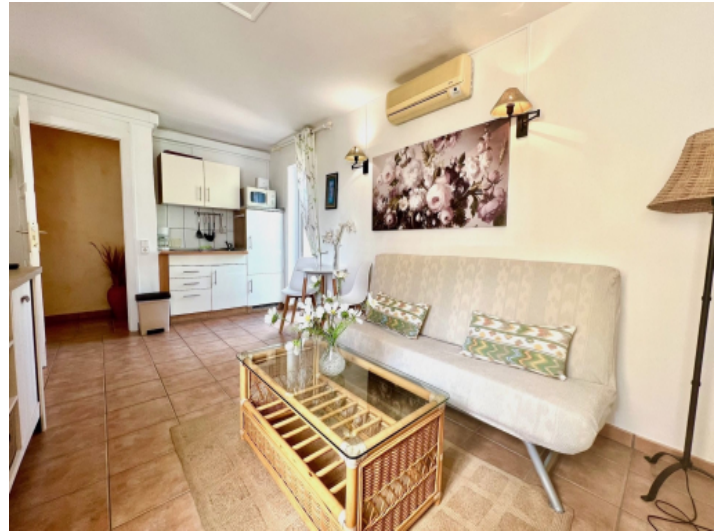
One of 6 apartments