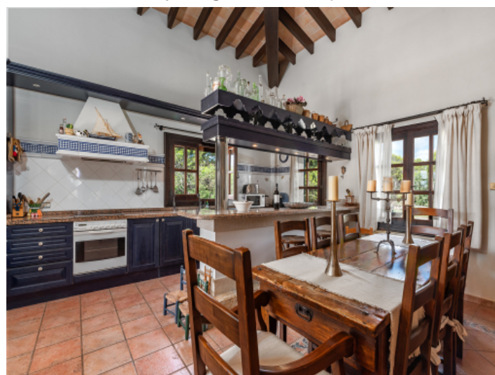
American kitchen and dining area