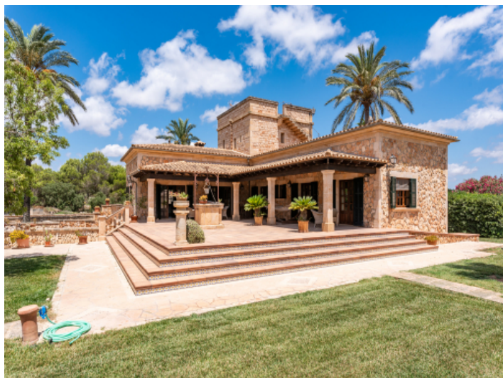
View to the terrace