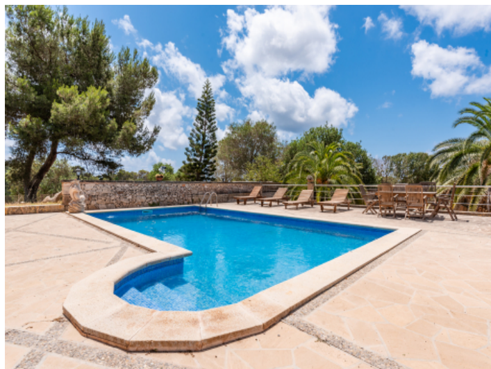
Large pool area