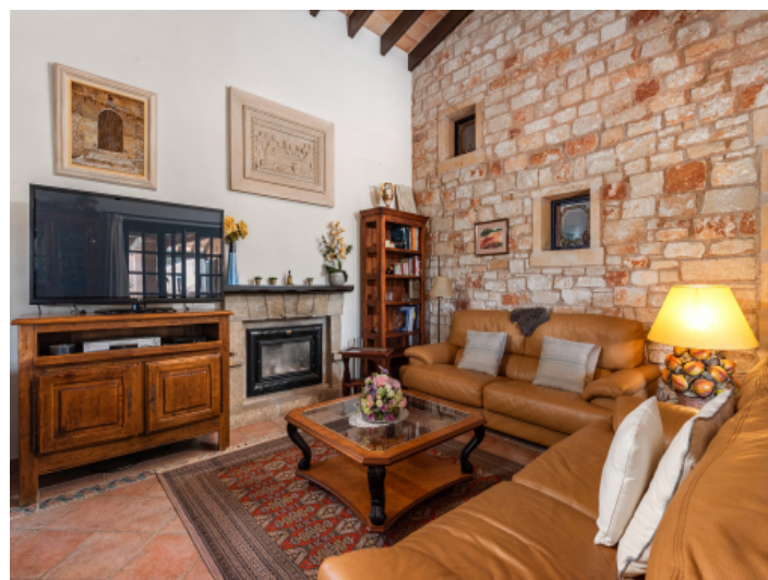
Cosy living area with fireplace