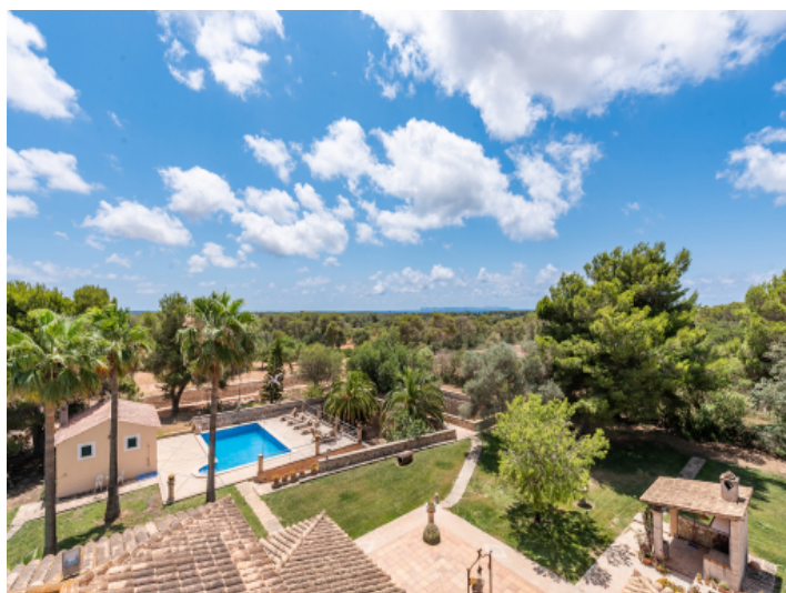
Fantastic views over the plot