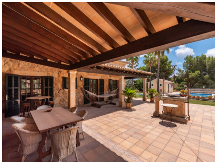
Partially covered terrace