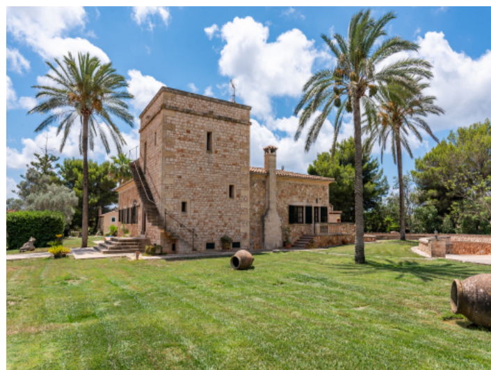
Natural stone façade