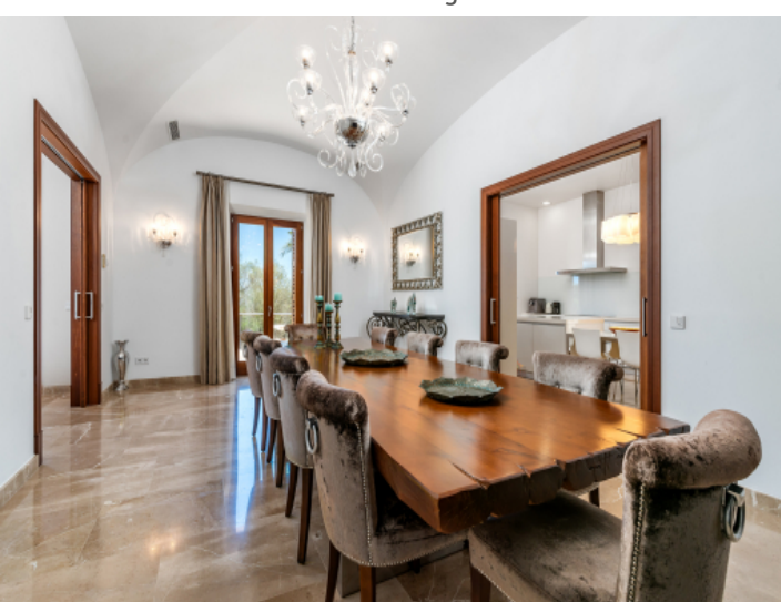
Dining area with high ceilings