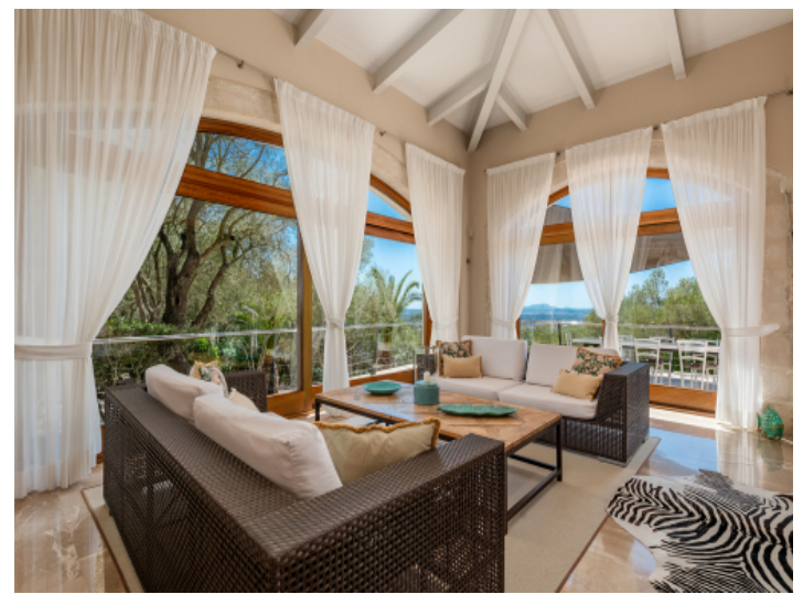
Additional living area