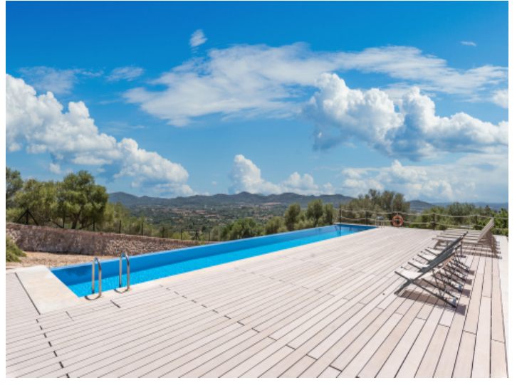
Pool in a unique location