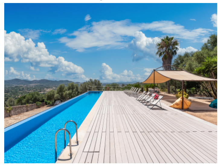
Very large pool