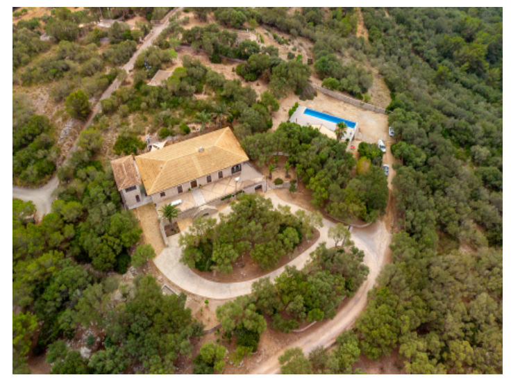
View of the property fromabove