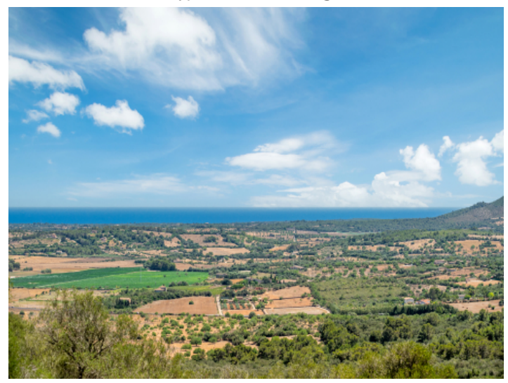
Sweepings views as far as the sea