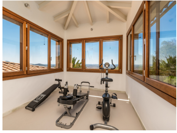
Gym with magnificent views