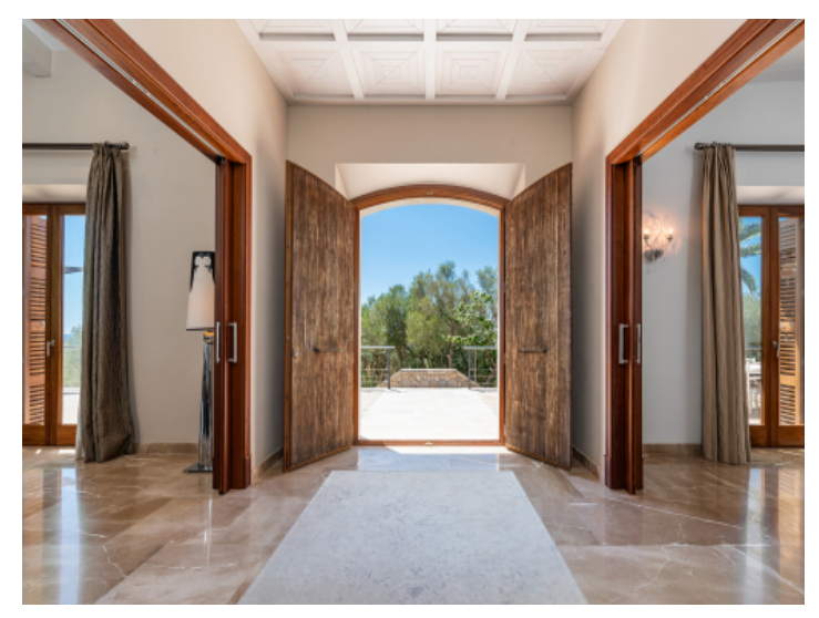
Beautiful entrance area