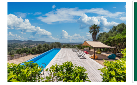
Manacor-Nord search for property MAL-120249