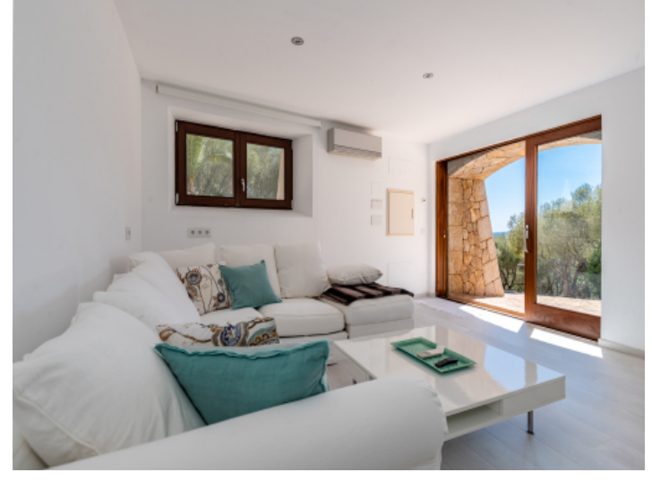
Living area with access to a terrace