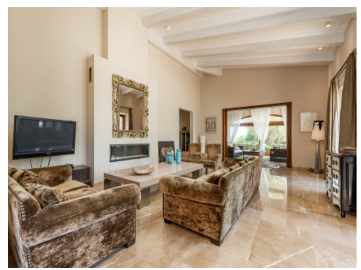
Luxurious living area