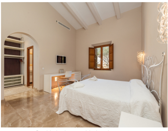
Double bedroom with dressing room