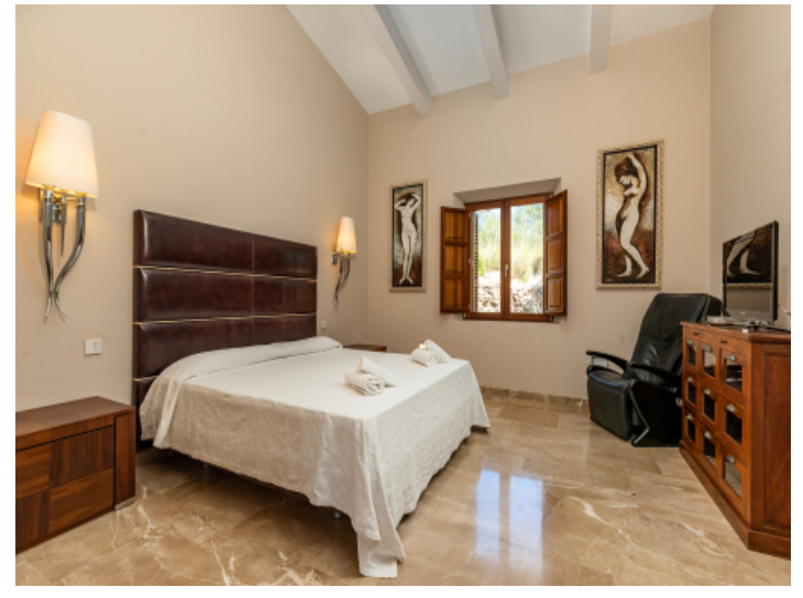
Spacious double bedroom