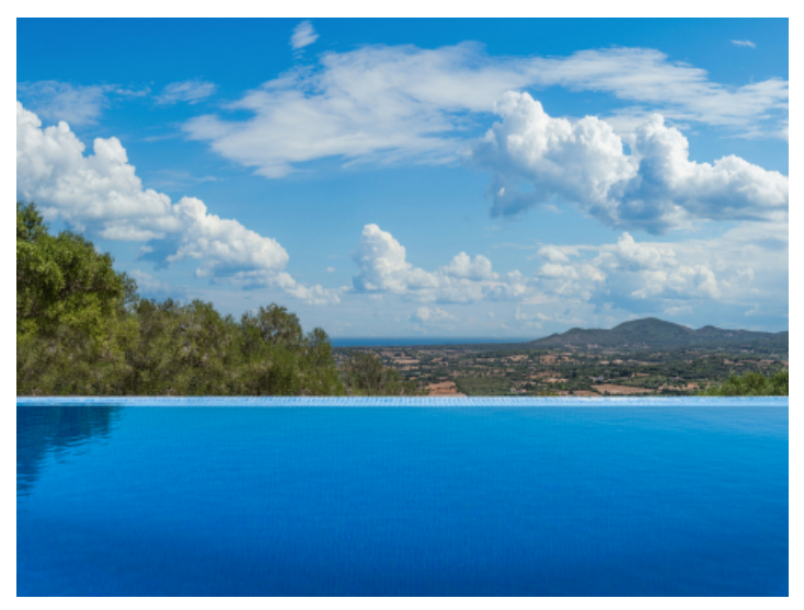
Infinitypool with stunning views