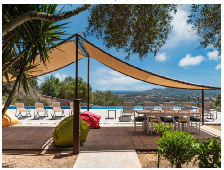
Tranquil chillout pool terrace