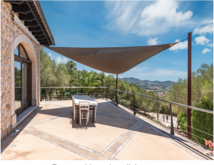
Terrace with outdoor dining area