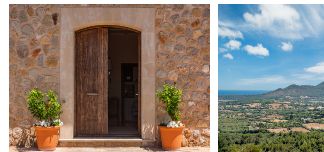
Entrance to the finca