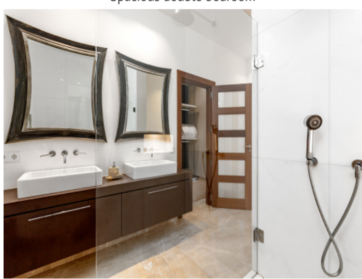
Bathroom with two sinks